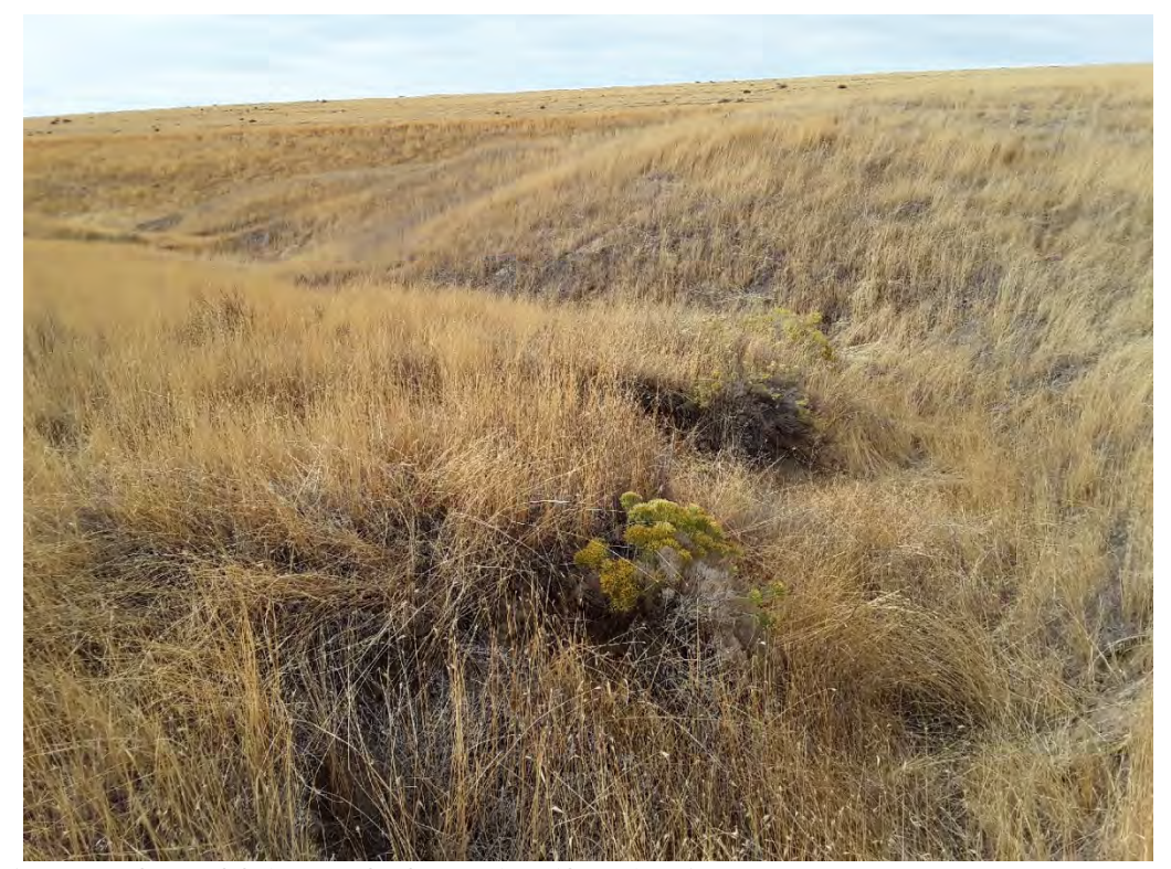
Photopoint 701. Ephemeral drainage, upland vegetation with no sign of water. EPH401.