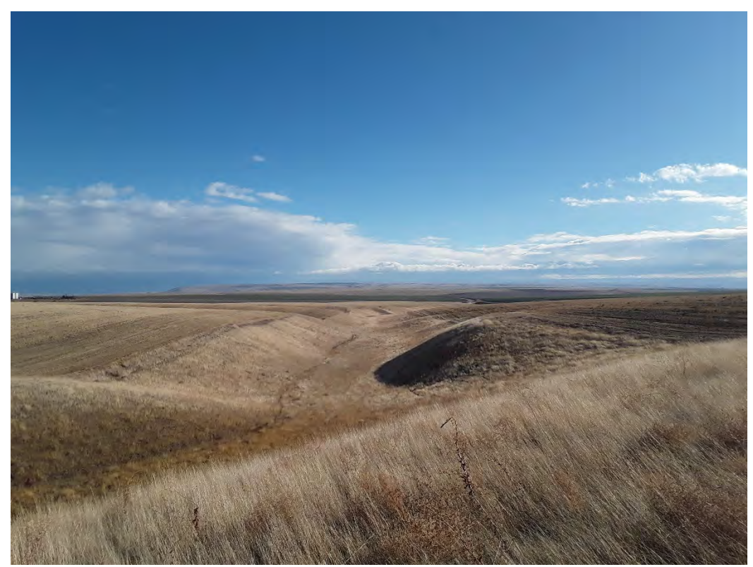
Photopoint 803. No beds, no banks, no stream present on NHD line.