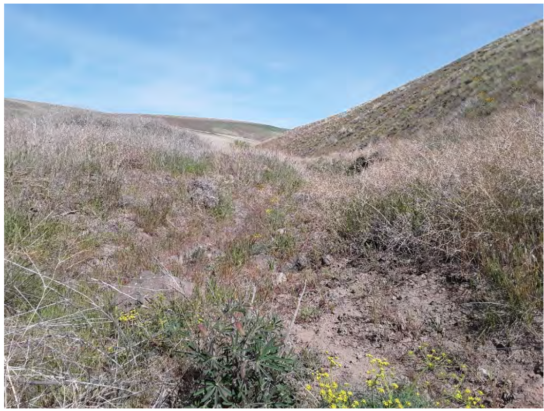
Photopoint 904a. Ephemeral drainage, typical conditions. EPH-904A. Facing north.