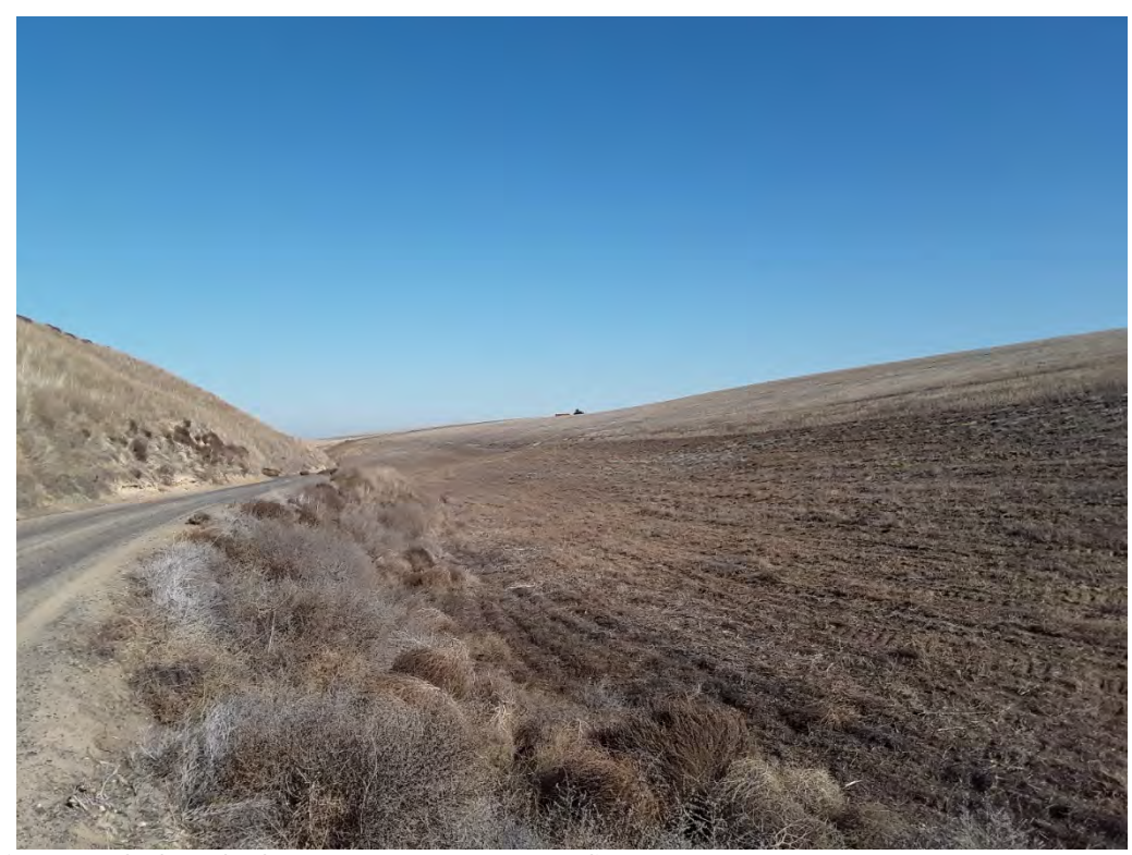
Photopoint 54. No beds, no banks, no stream present on NHD line.