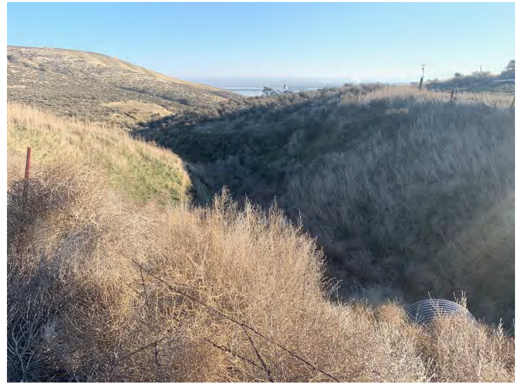
Photopoint 74. Ephemeral drainage, upland vegetation with no sign of water. EPH300.