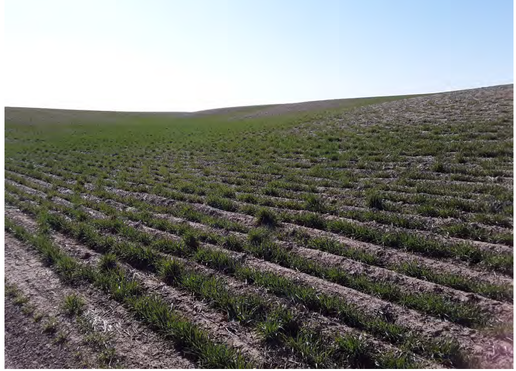
Photopoint 2. No beds, no banks, no stream present on NHD line.