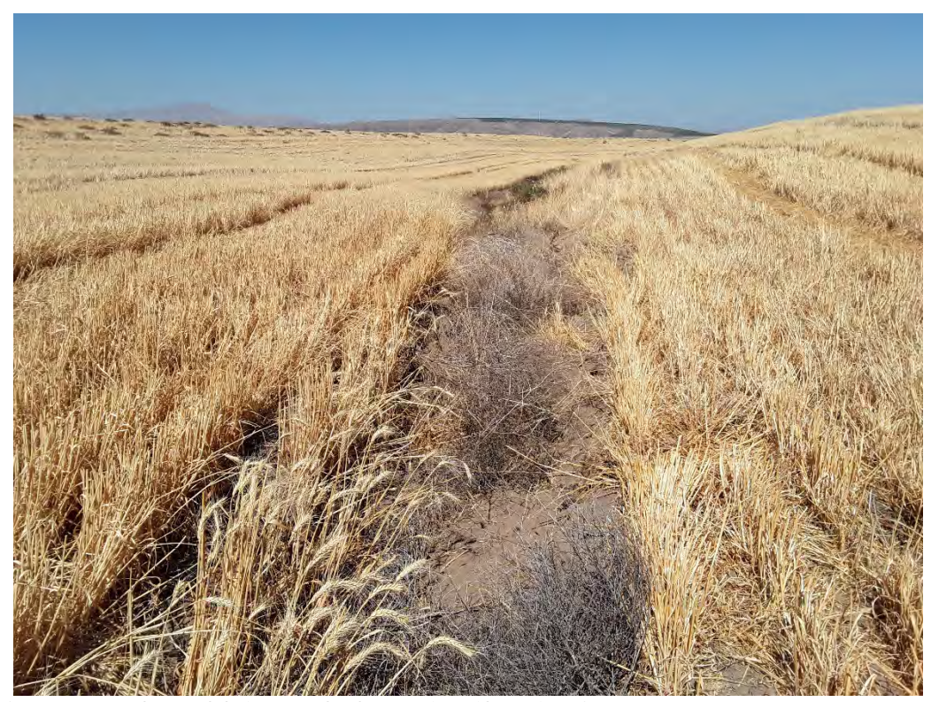
Photopoint EPH104. Ephemeral drainage, upland vegetation with no sign of water.