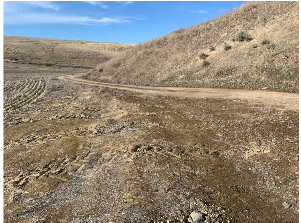
Photopoint 209. No beds, no banks, no stream present on NHD line.