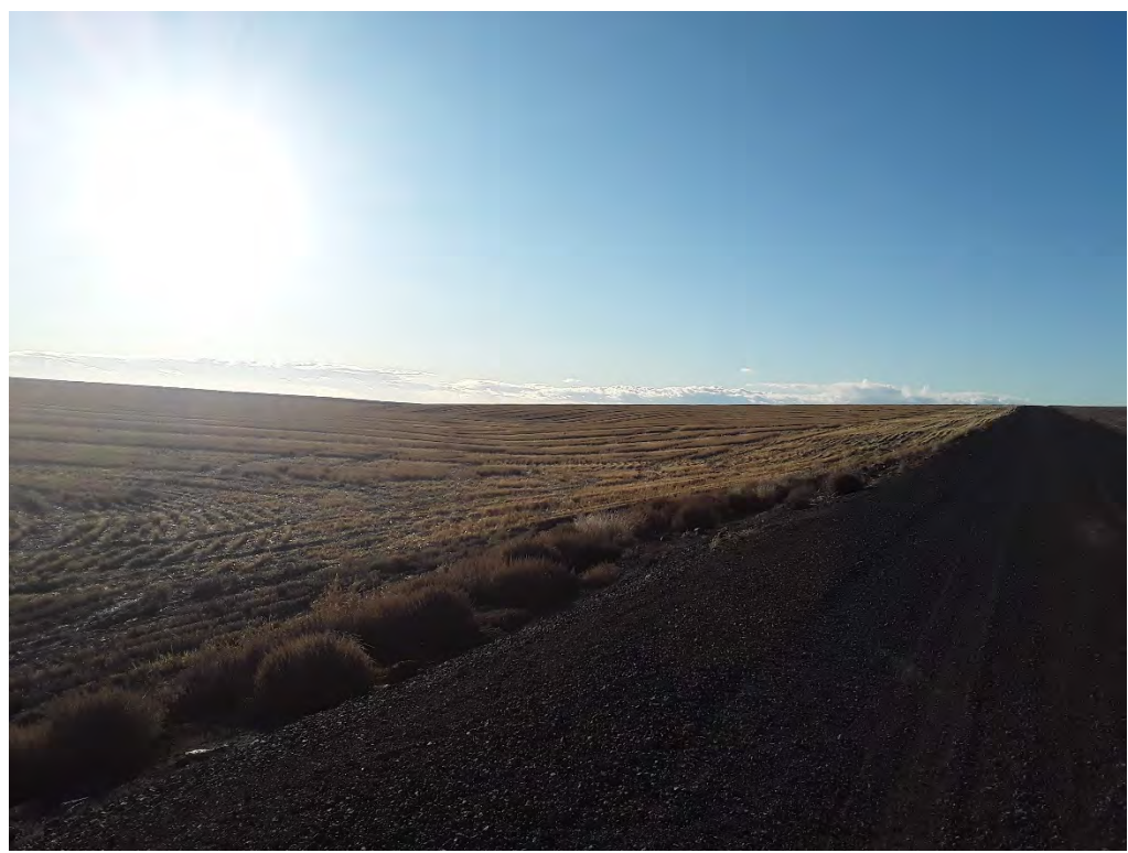
Photopoint 809. No beds, no banks, no stream present on NHD line.