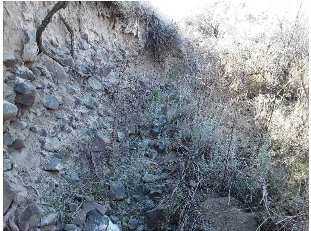
Photopoint 8. Streambed with watermarks on rocks, and water in pools due to recent rainfall. INT01.