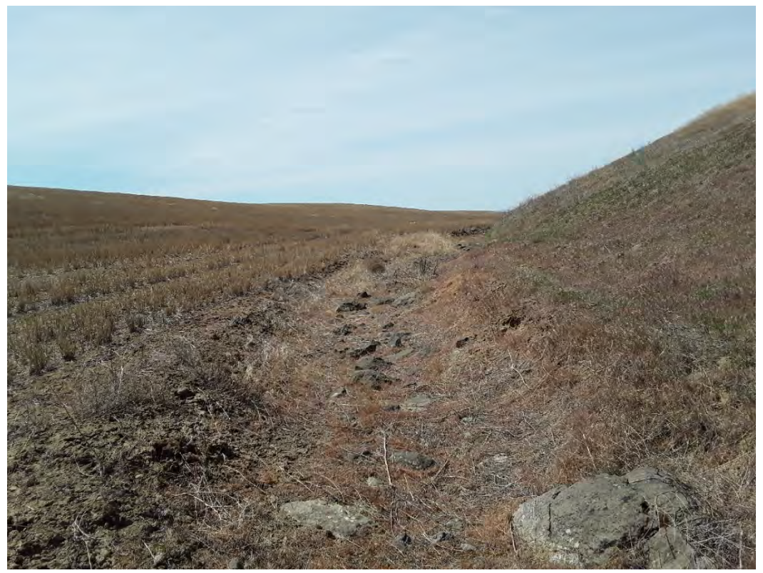
Photopoint 900b. Ephemeral drainage, typical conditions. EPH-900. Facing southwest.