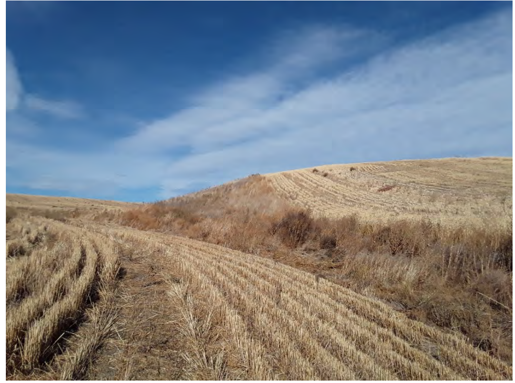
Photopoint 705. No beds, no banks, no stream present on NHD line. Hillside between plowed fields.