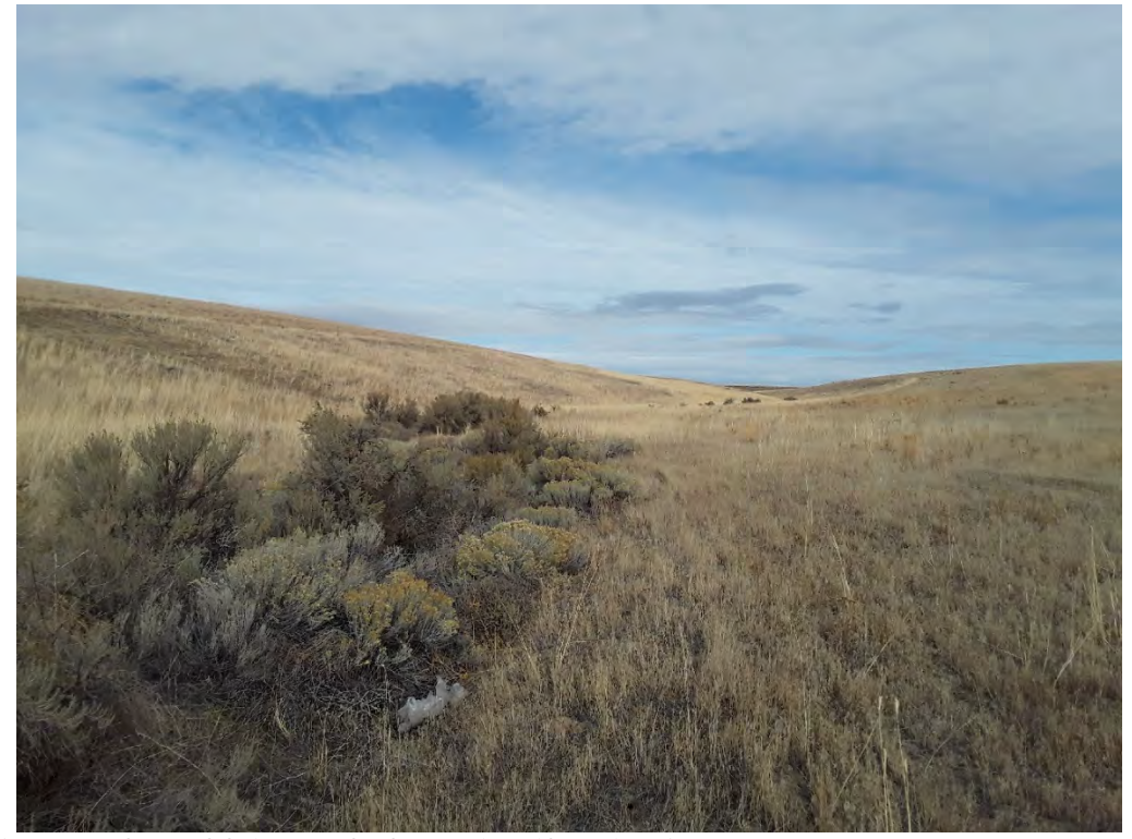
Photopoint 720. Ephemeral drainage, upland vegetation with no sign of water. EPH700.