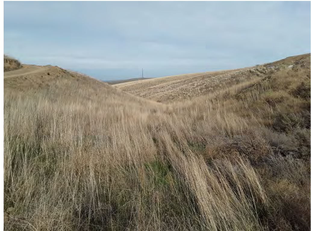
Photopoint 69. No beds, no banks, no stream present on NHD line.