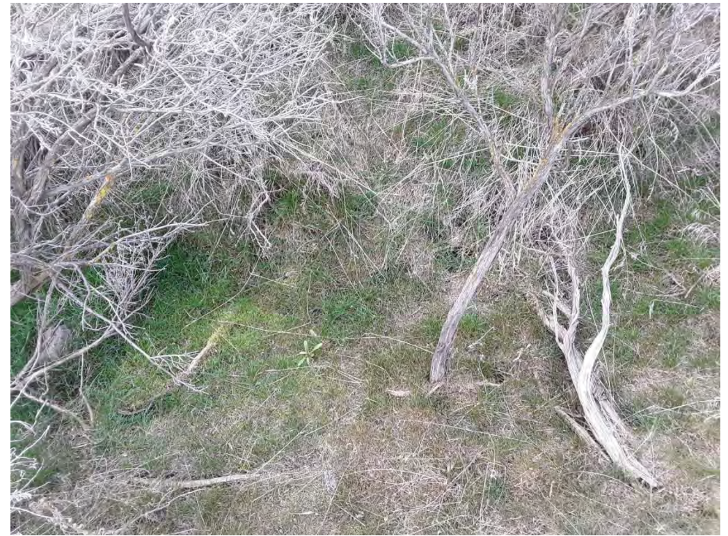
Photopoint 59. Soil Sample Site. SS02.