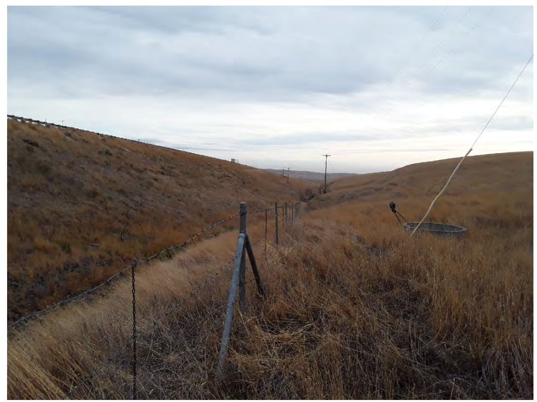
Photopoint 713. No beds, no banks, no stream present on NHD line. Bottom between two hills next to freeway.