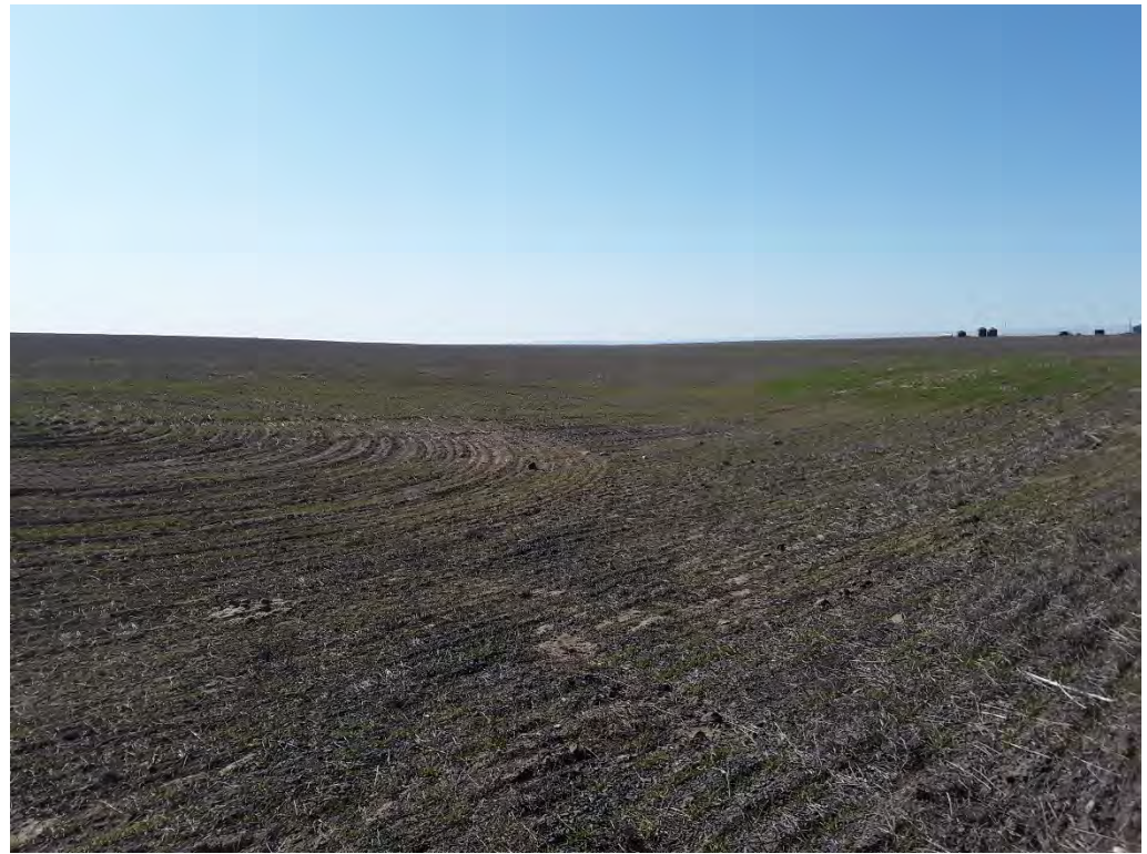
Photopoint 26. No beds, no banks, no stream present on NHD line.