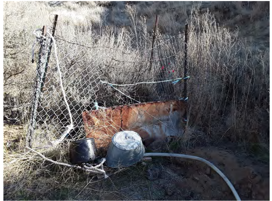
Photopoint 24. Well in bedrock in stream bottom.