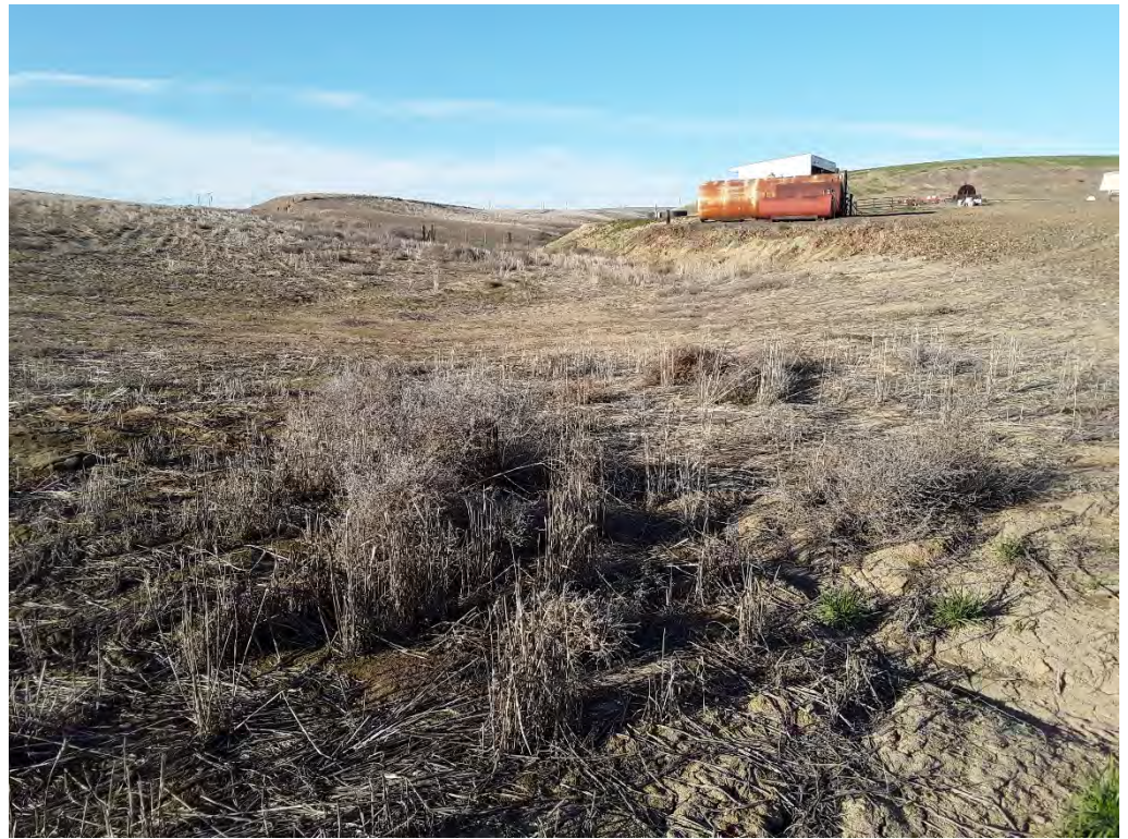
Photopoint 89. No beds, no banks, no stream present on NHD line.