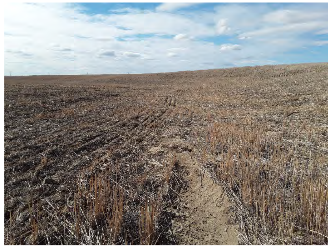
Photopoint 613. End of EPH602.