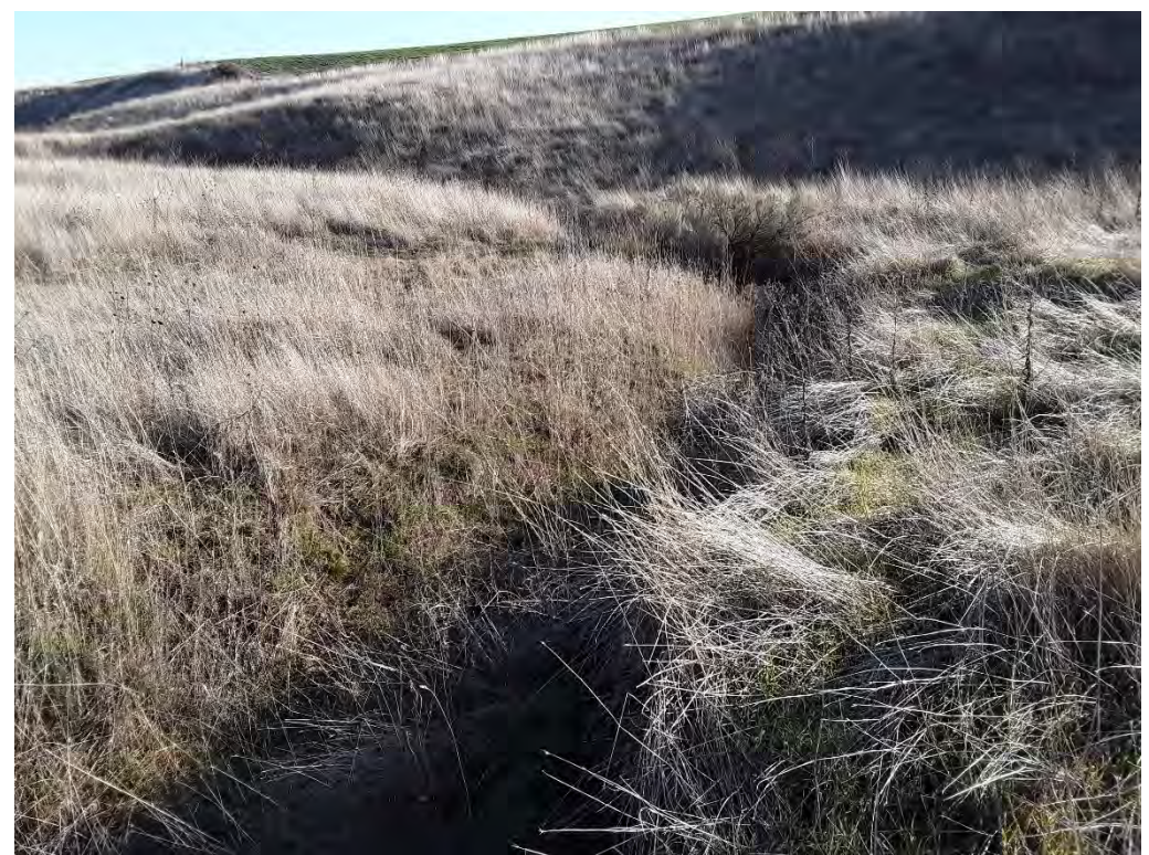
Photopoint 95. Ephemeral drainage, upland vegetation with no sign of water. EPH400.