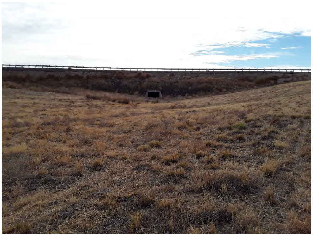
Photopoint 610. No beds, no banks, no stream present on NHD line. Culvert under road.