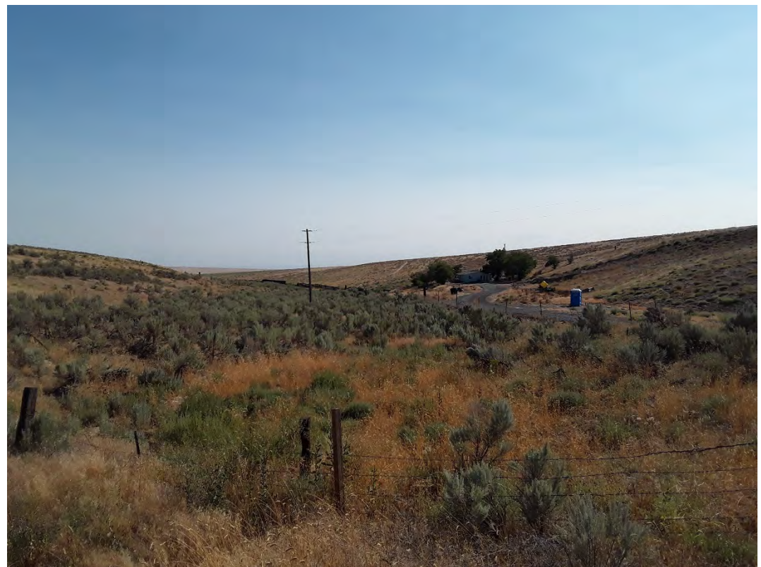
Photopoint XBB 309. No beds, no banks, no stream present on NHD line.