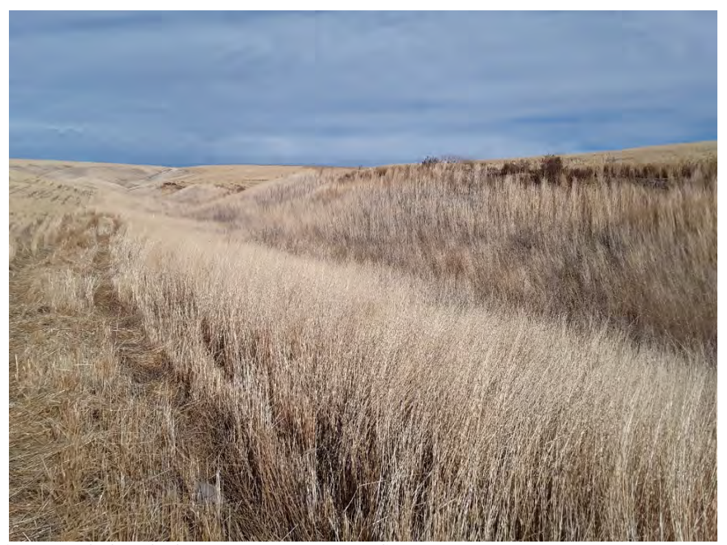
Photopoint 706. No beds, no banks, no stream present on NHD line.