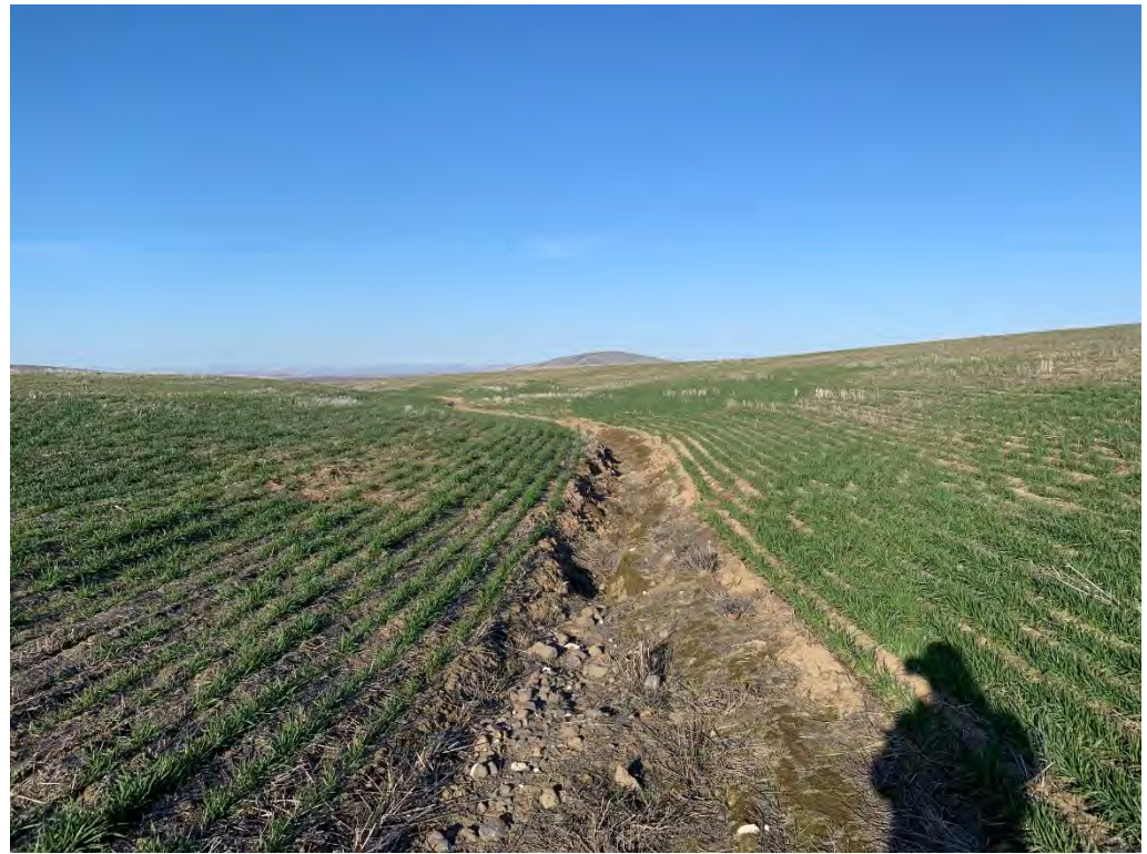
Photopoint 18. Ephemeral drainage, upland vegetation with no sign of water. EPH104.