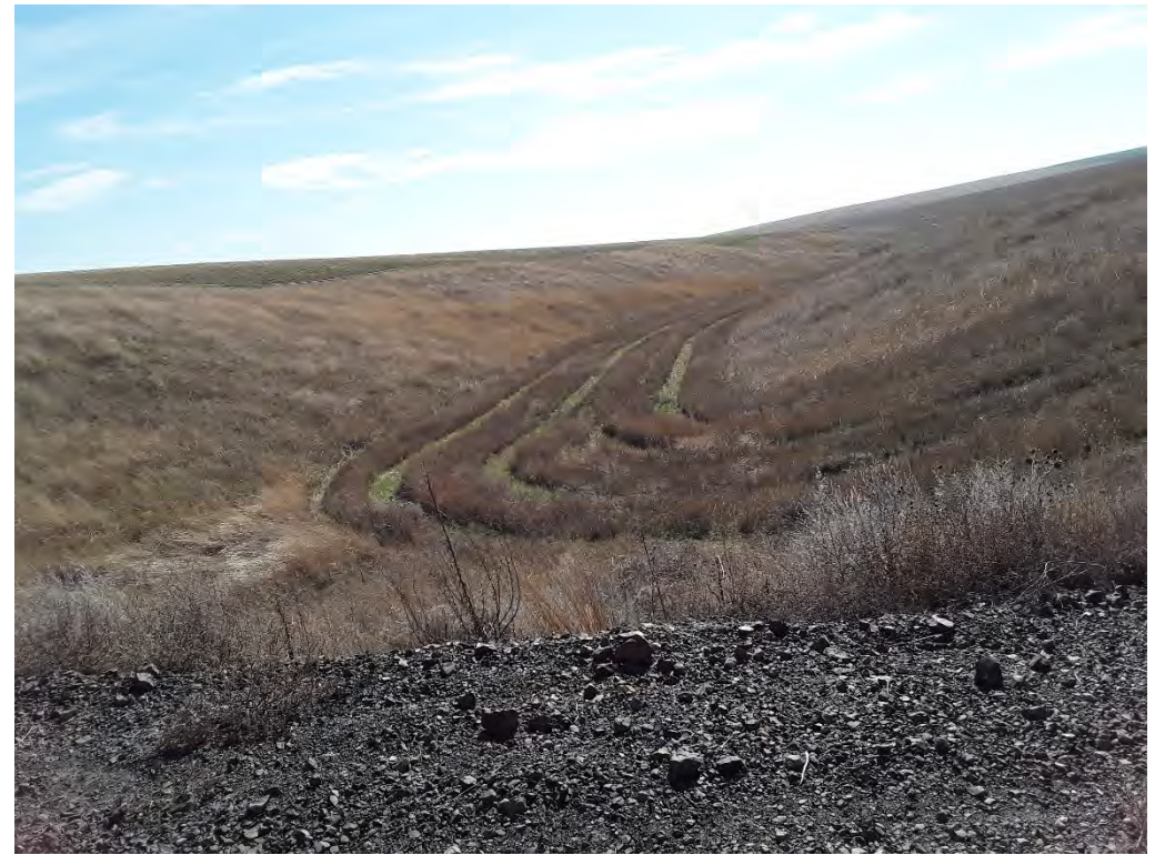
Photopoint 114. No beds, no banks, no stream present on NHD line.