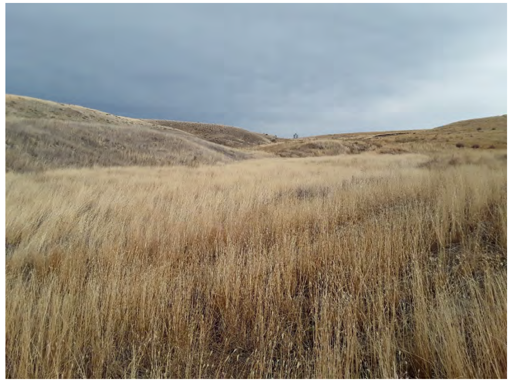
Photopoint 702. No beds, no banks, no stream present on NHD line. Upstream end of EPH401.