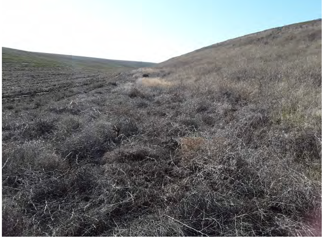
Photopoint 51. No beds, no banks, no stream present on NHD line.