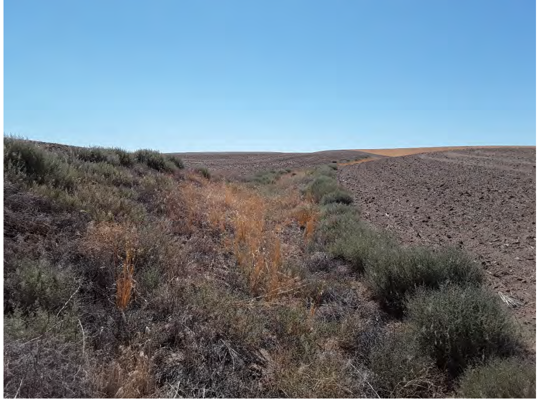
Photopoint XBB 301. No beds, no banks, no stream present on NHD line.