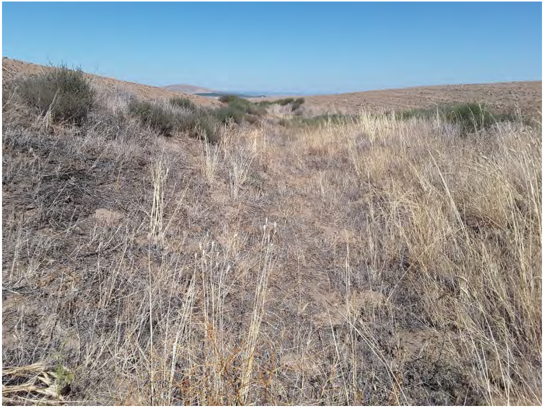
Photopoint XBB 313. No beds, no banks, no stream present on NHD line.