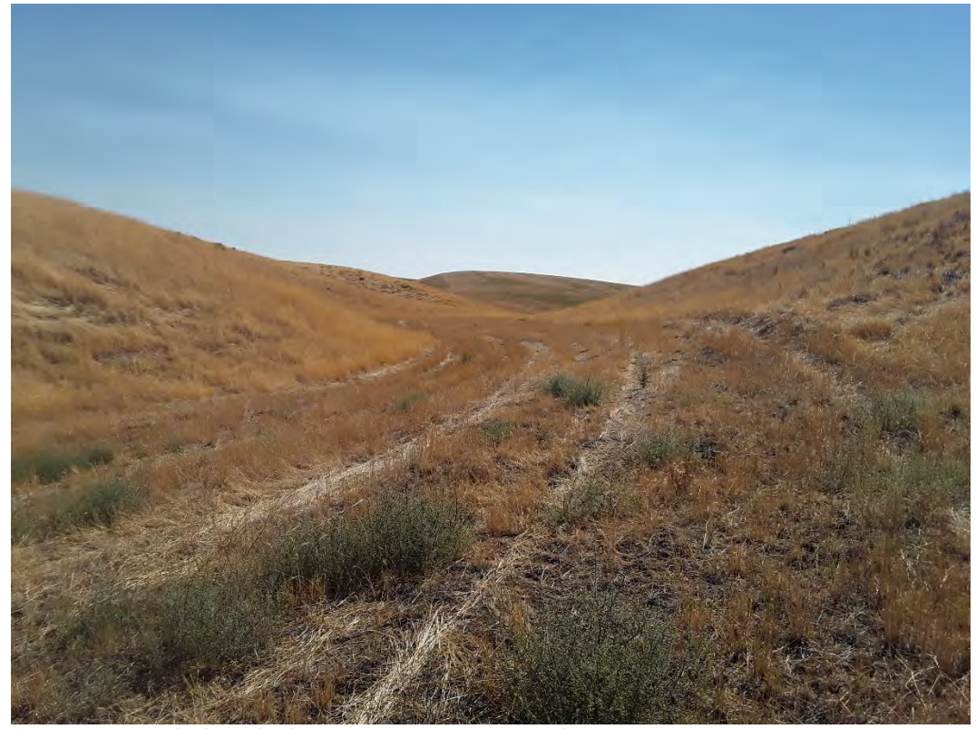
Photopoint XBB 305. No beds, no banks, no stream present on NHD line.