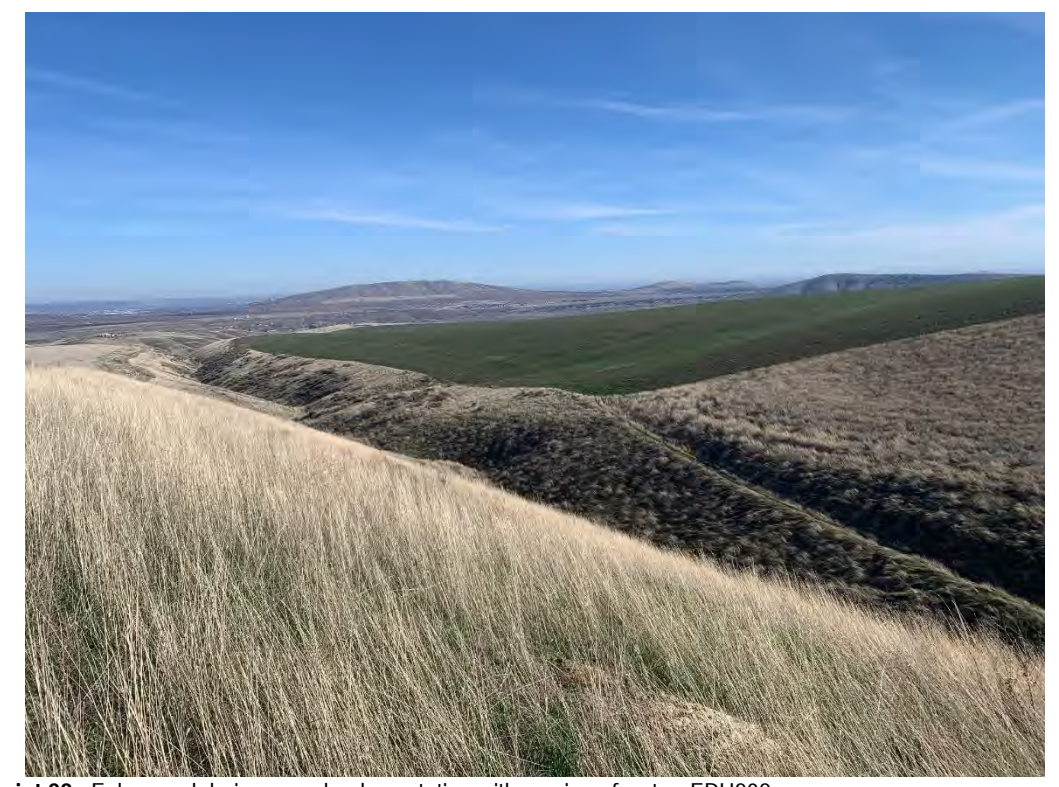
Photopoint 22. Ephemeral drainage, upland vegetation with no sign of water. EPH202.