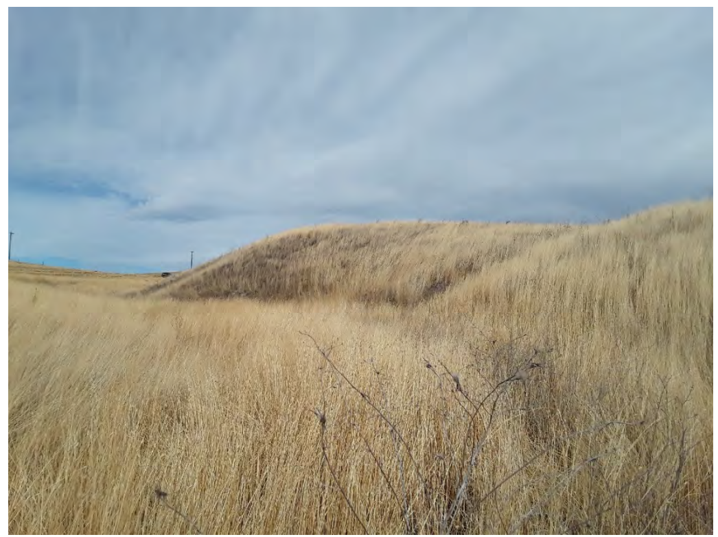
Photopoint 704. Ephemeral drainage, upland vegetation with no sign of water. EPH401.