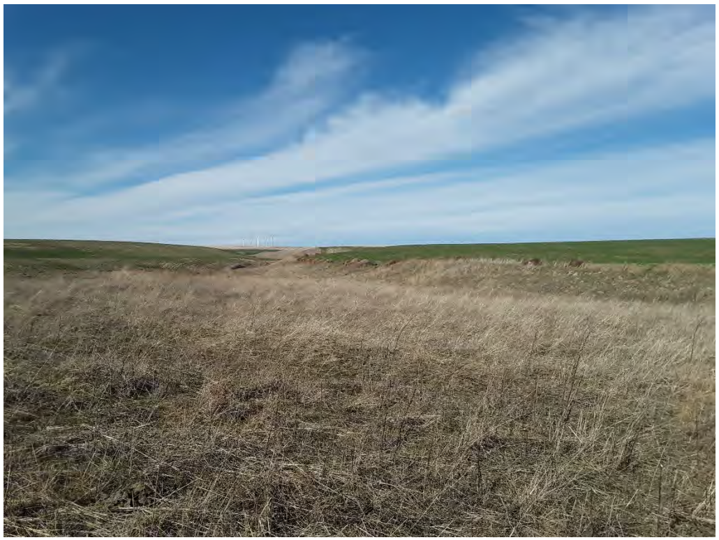
Photopoint 107. No beds, no banks, no stream present on NHD line.