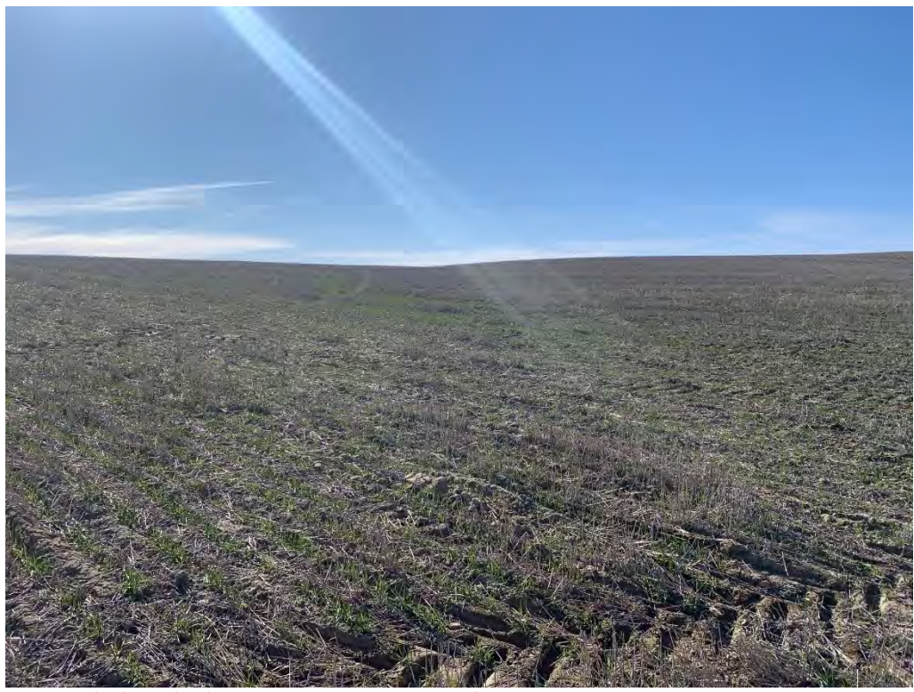
Photopoint 21. No beds, no banks, no stream present on NHD line.