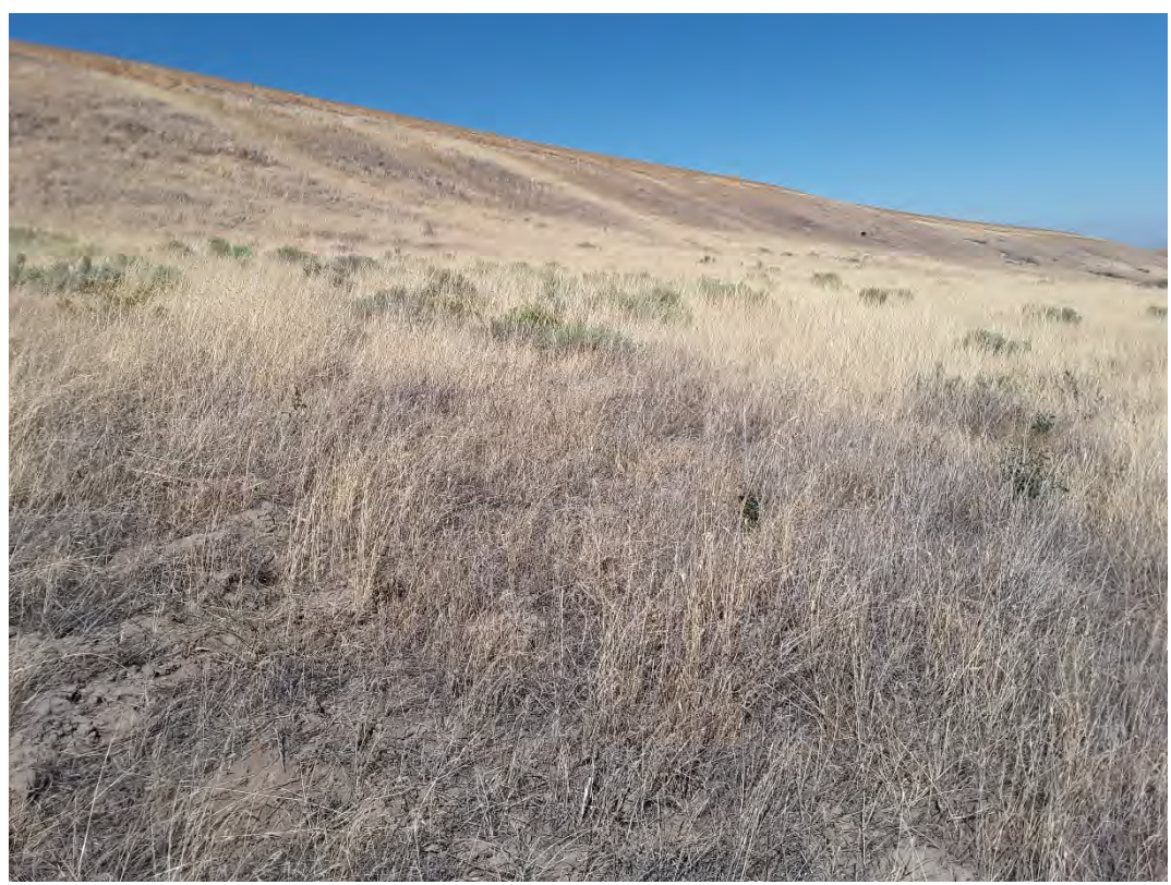
Photopoint XBB 304. No beds, no banks, no stream present on NHD line.