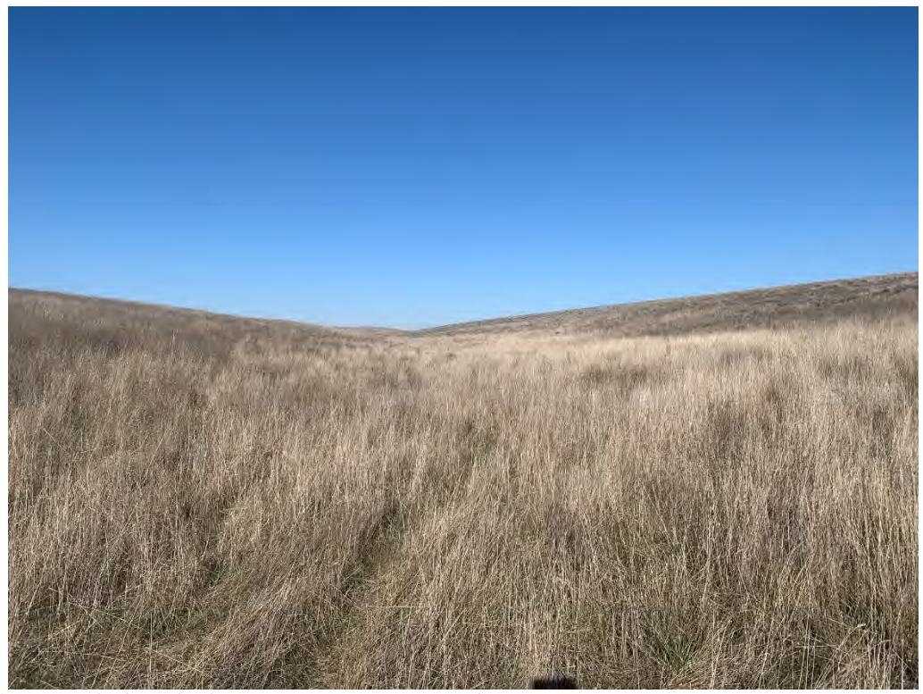
Photopoint 75. No beds, no banks, no stream present on NHD line.