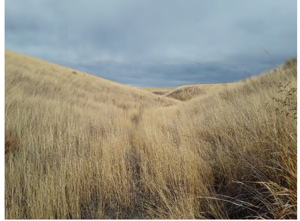
Photopoint 703. Ephemeral drainage, upland vegetation with no sign of water. EPH401.