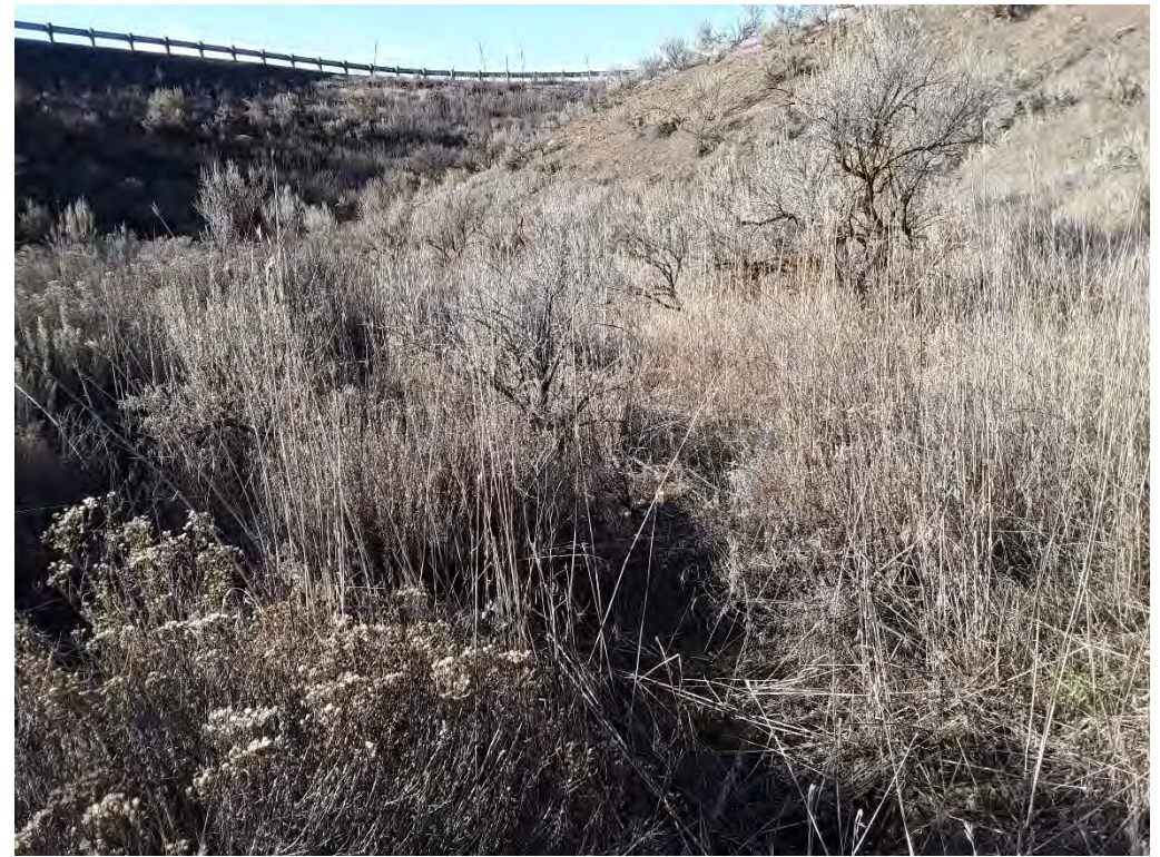
Photopoint 78. Ephemeral drainage, upland vegetation with no sign of water. EPH308.