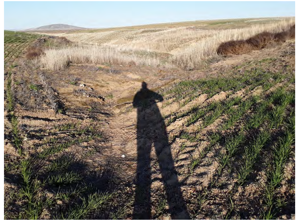
Photopoint 15. Ephemeral drainage, upland vegetation with no sign of water. EPH105.