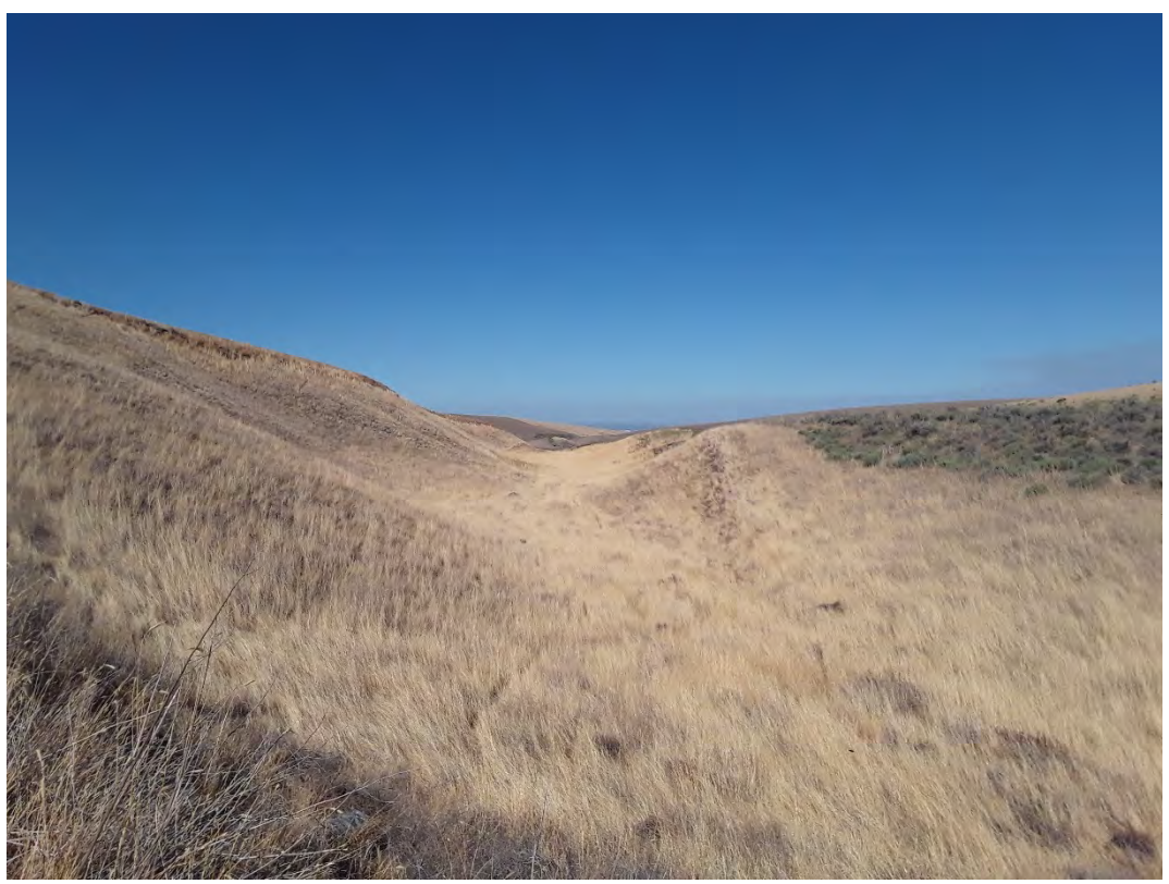
Photopoint XBB 306. No beds, no banks, no stream present on NHD line.