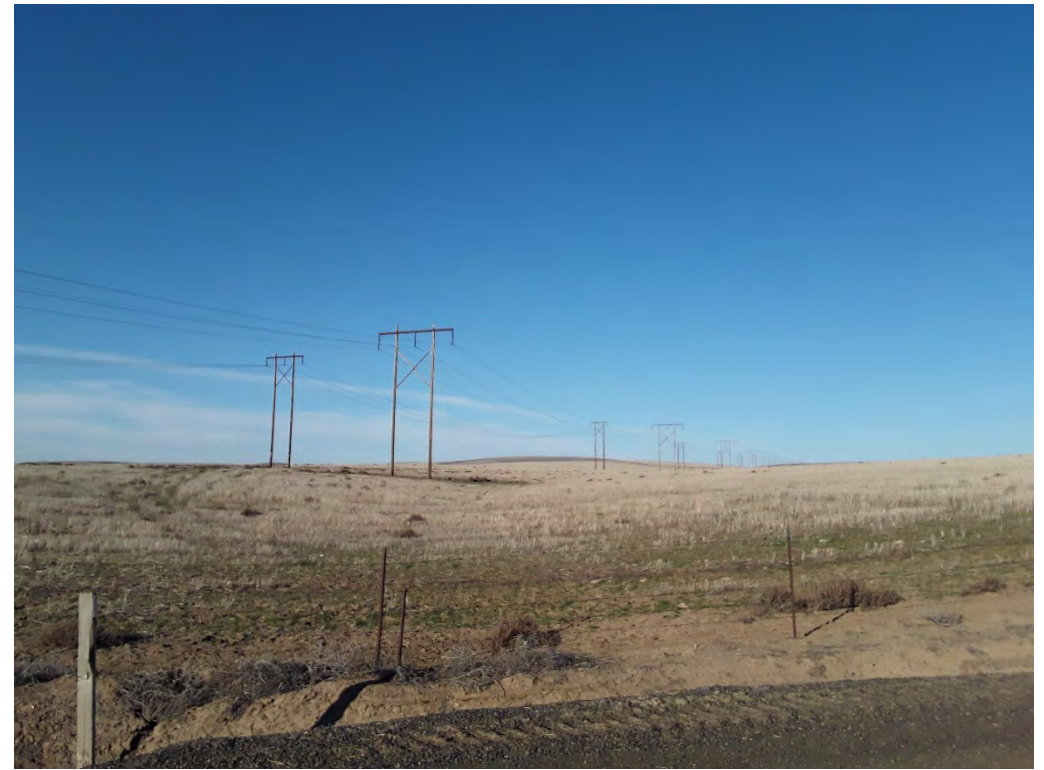
Photopoint 84. No beds, no banks, no stream present on NHD line.