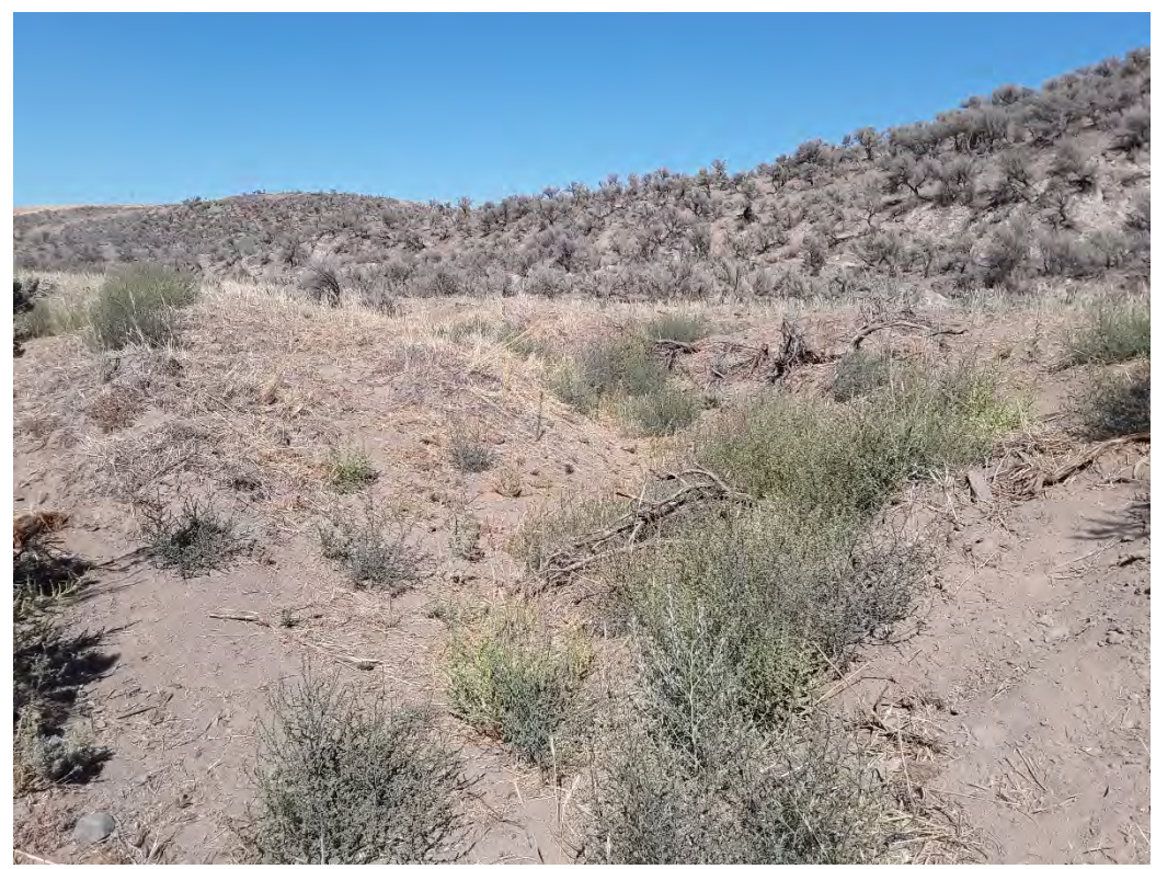
Photopoint EPH501 SE. Ephemeral drainage, upland vegetation with no sign of water.