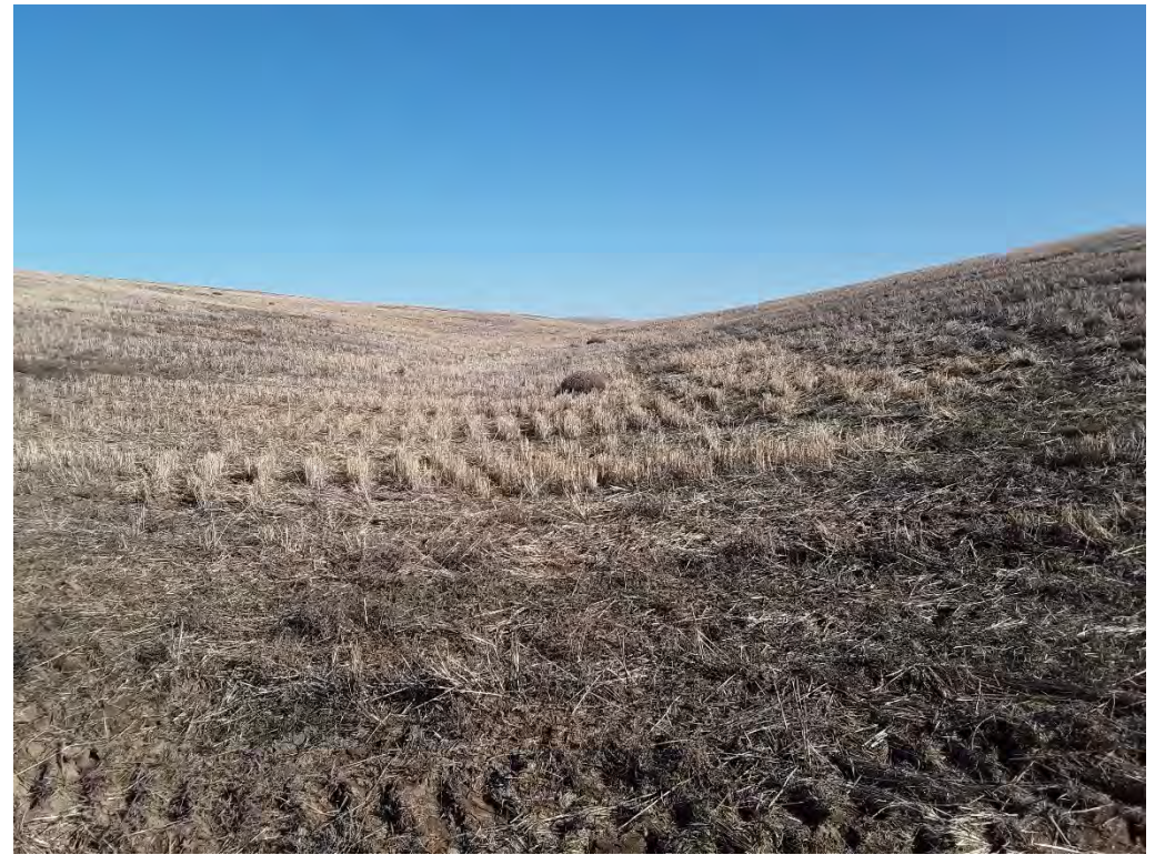
Photopoint 49. No beds, no banks, no stream present on NHD line.