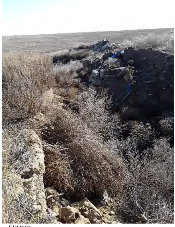
Photopoint 5. Erosional feature. EPH101.