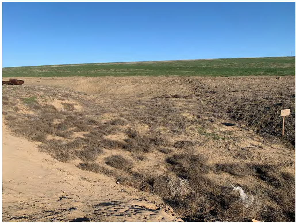
Photopoint 88. Ephemeral drainage, upland vegetation with no sign of water. EPH306.