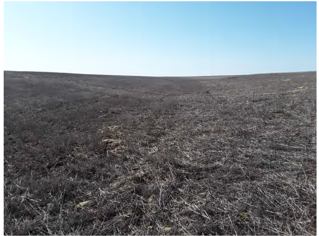
Photopoint 28. No beds, no banks, no stream present on NHD line.