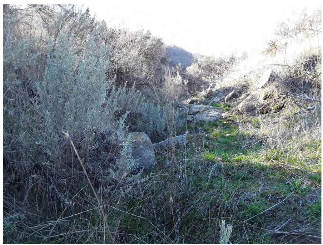
Photopoint 81. Ephemeral drainage, upland vegetation with no sign of water. EPH308.