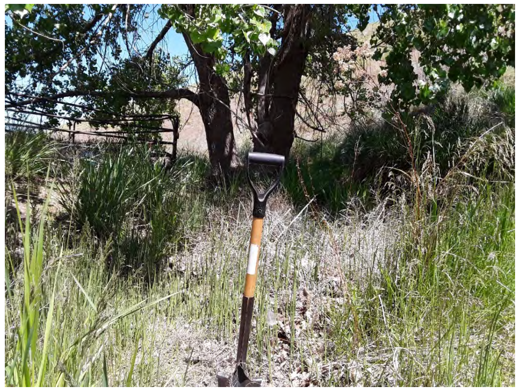
Photopoint E10. Sample site. No water, horsetail, well pump in background.