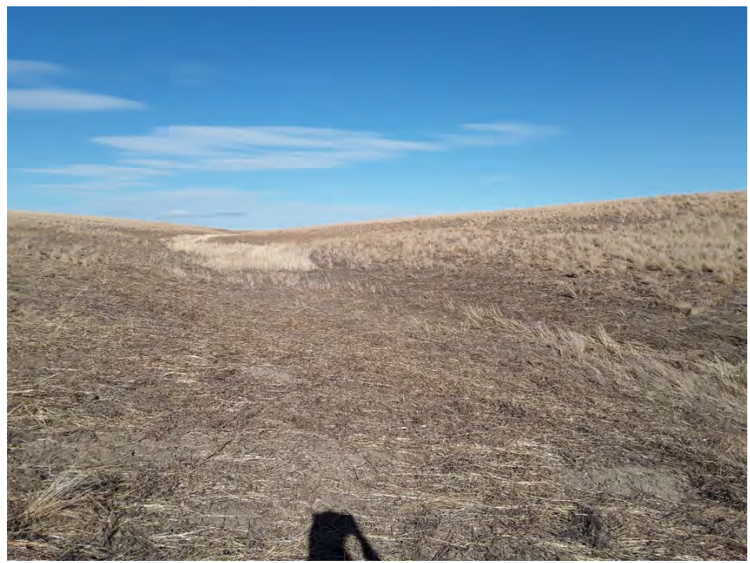
Photopoint 725. No beds, no banks, no stream present on NHD line.