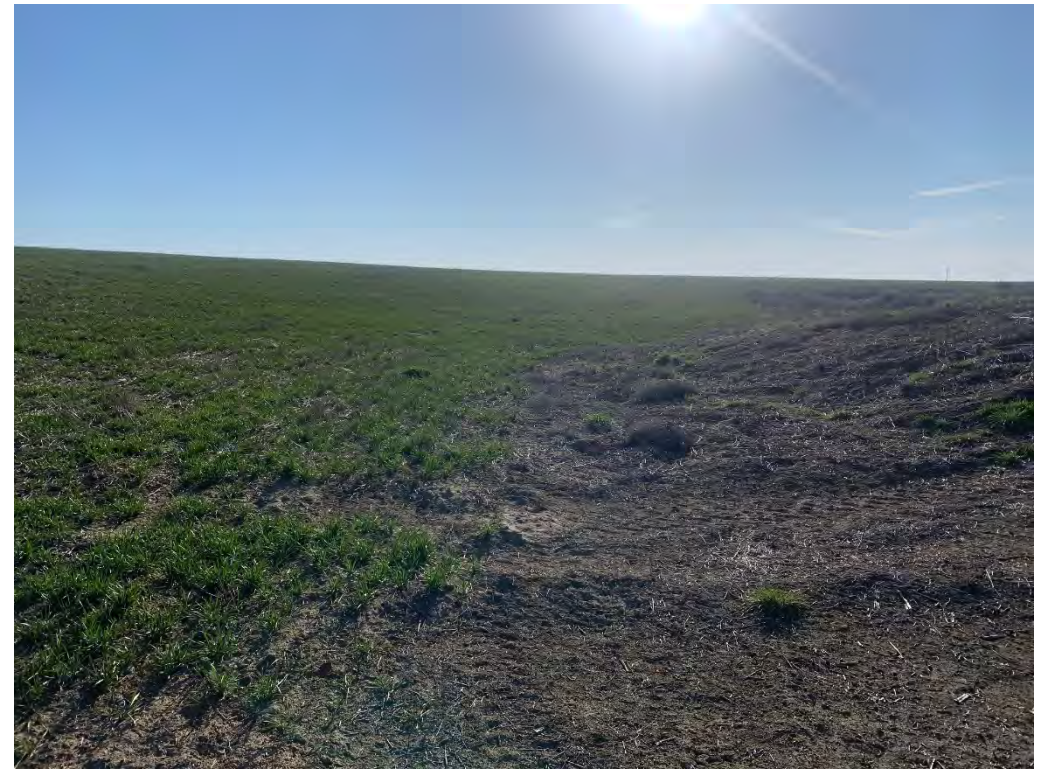
Photopoint 80. No beds, no banks, no stream present on NHD line.