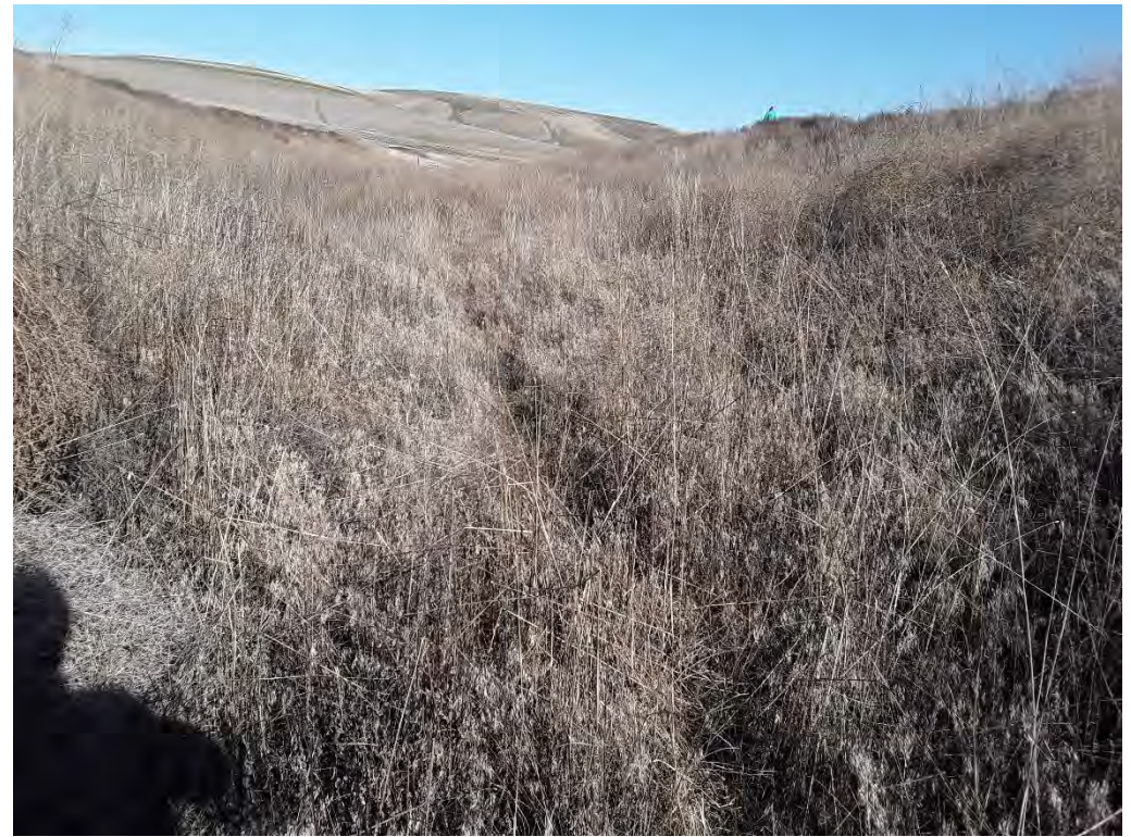
Photopoint 4. Ephemeral drainage, upland vegetation with no sign of water. EPH100.