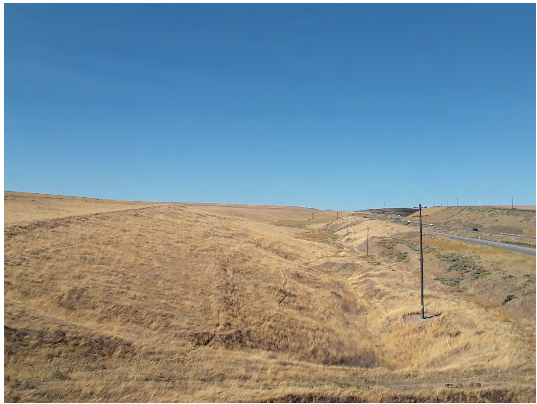
Photopoint XBB 308. No beds, no banks, no stream present on NHD line.