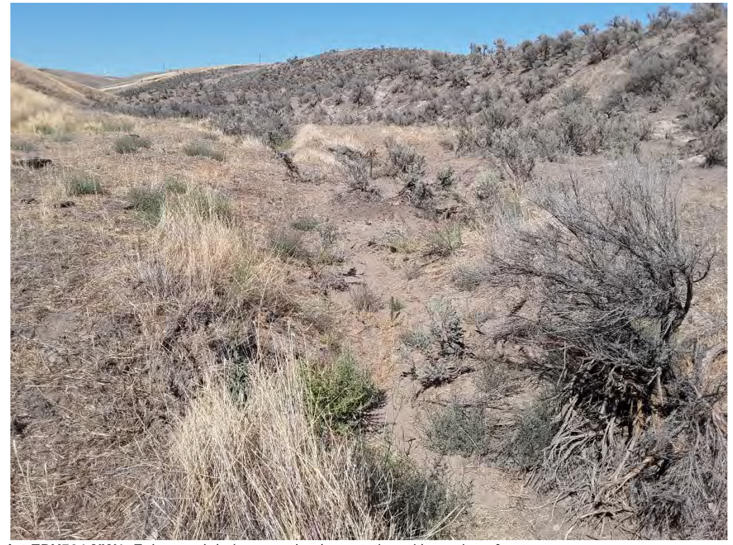
Photopoint EPH501 NW1. Ephemeral drainage, upland vegetation with no sign of water.