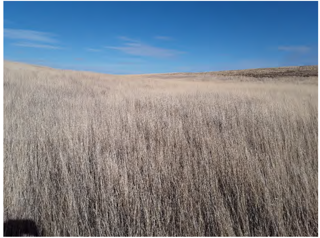
Photopoint 724. Ephemeral drainage, upland vegetation with no sign of water. Upstream end of EPH700, begins to lose bed and banks.