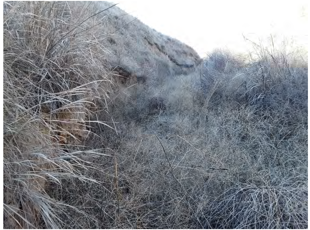
Photopoint 6. Erosional feature. EPH102.