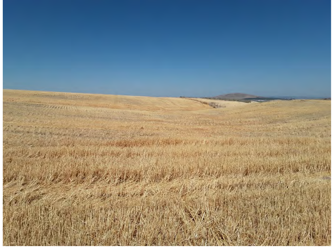
Photopoint XBB 311. No beds, no banks, no stream present on NHD line.