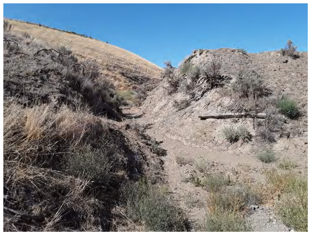
Photopoint EPH500 levee 1. Ephemeral drainage, upland vegetation with no sign of water.