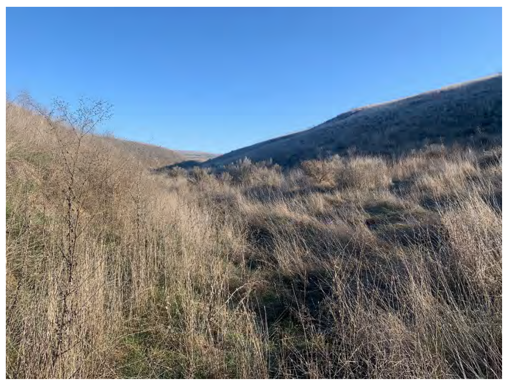
Photopoint 90. Ephemeral drainage, upland vegetation with no sign of water. EPH401.