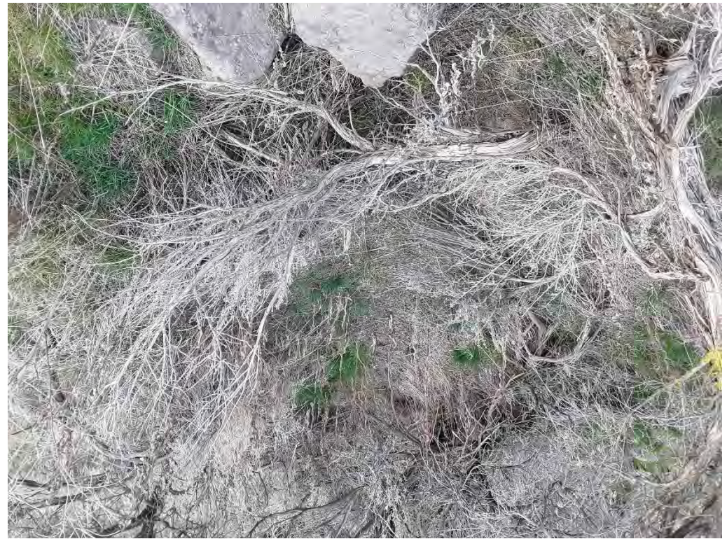
Photopoint 63. Streambed with damp soils. INT02.