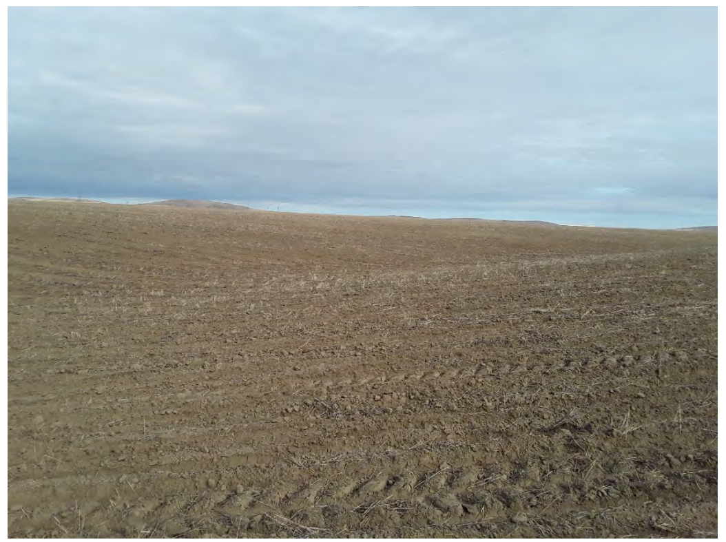
Photopoint 714. No beds, no banks, no stream present on NHD line.