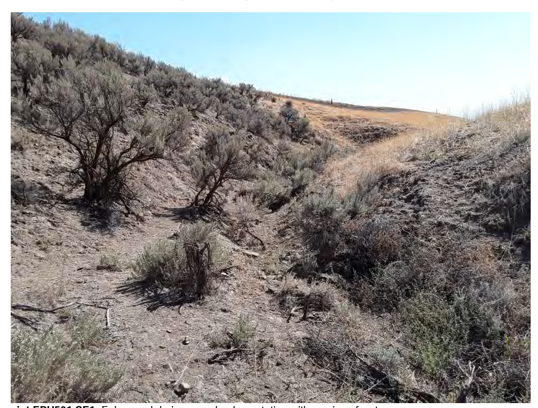
Photopoint EPH501 SE1. Ephemeral drainage, upland vegetation with no sign of water.