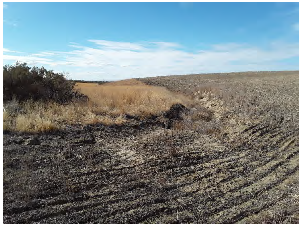
Photopoint 611. Ephemeral drainage, upland vegetation with no sign of water. Ephemeral drainage begins at this point, EPH602.