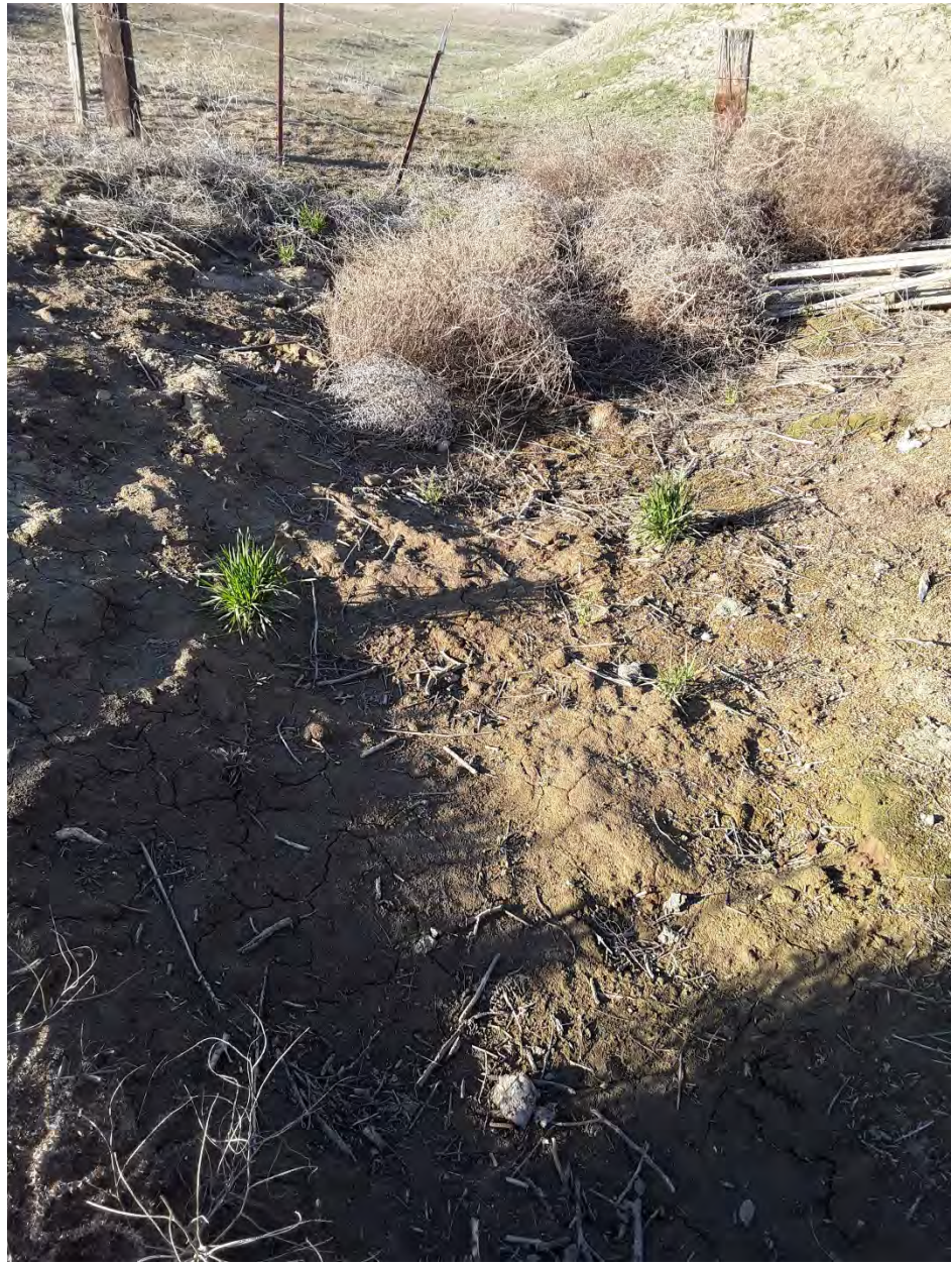
Photopoint 87. Ephemeral drainage, upland vegetation with no water. EPH307.