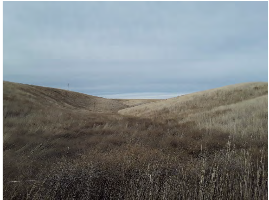
Photopoint 108. No beds, no banks, no stream present on NHD line.