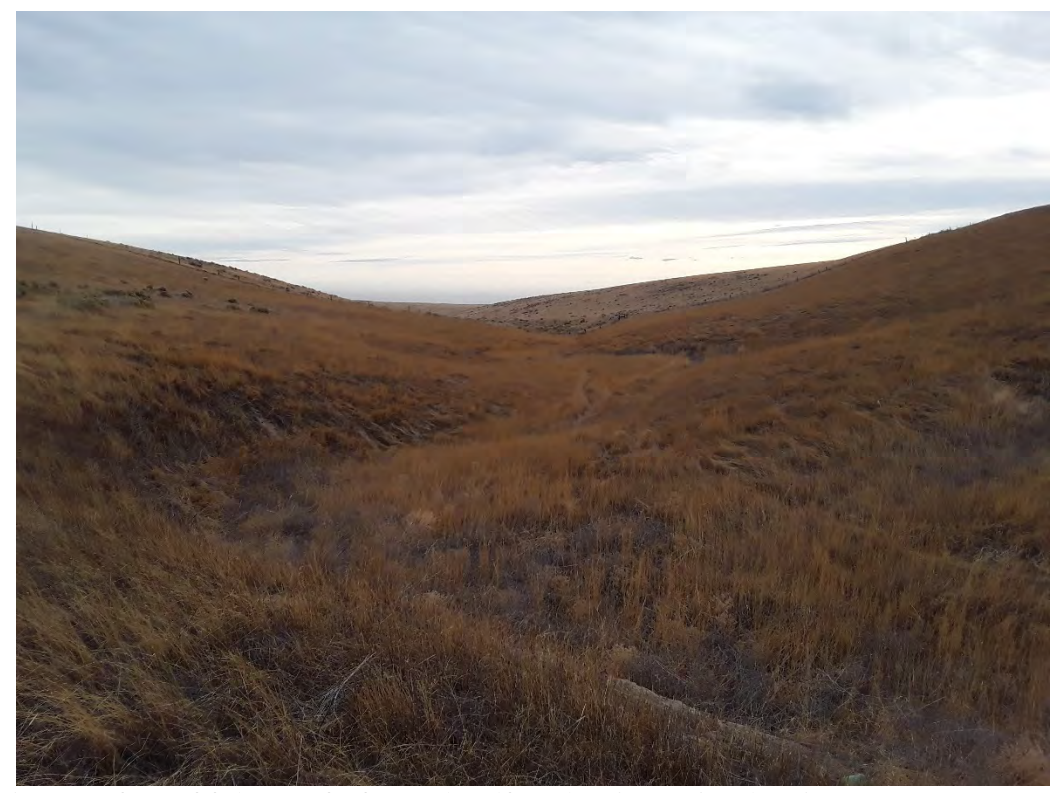
Photopoint 608. Ephemeral drainage, upland vegetation with no sign of water. Overview of EPH600.