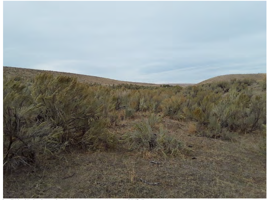
Photopoint 710. No beds, no banks, no stream present on NHD line.