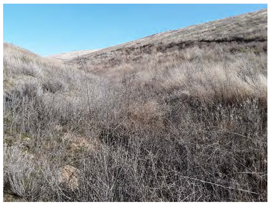
Photopoint 101. No beds, no banks, no stream present on NHD line.