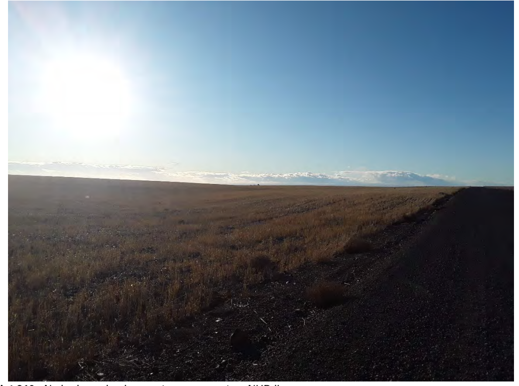
Photopoint 810. No beds, no banks, no stream present on NHD line.