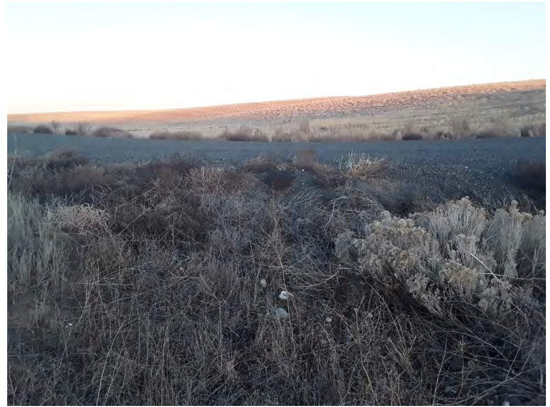
Photopoint 813. No beds, no banks, no stream present on NHD line. No culvert alongside road.