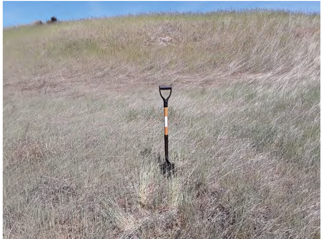
Photopoint E18. Sample site. Upland, cereal rye and non-hydric soils.