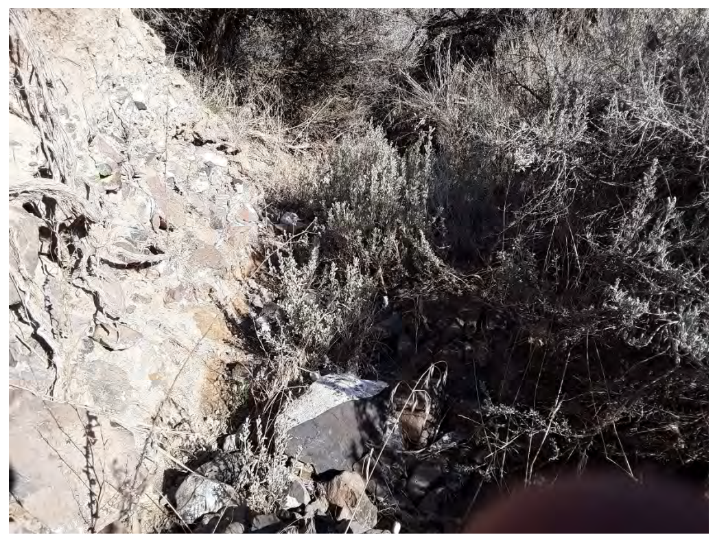
Photopoint 9. Streambed with watermarks on rocks, and water in pools due to recent rainfall. INT01.