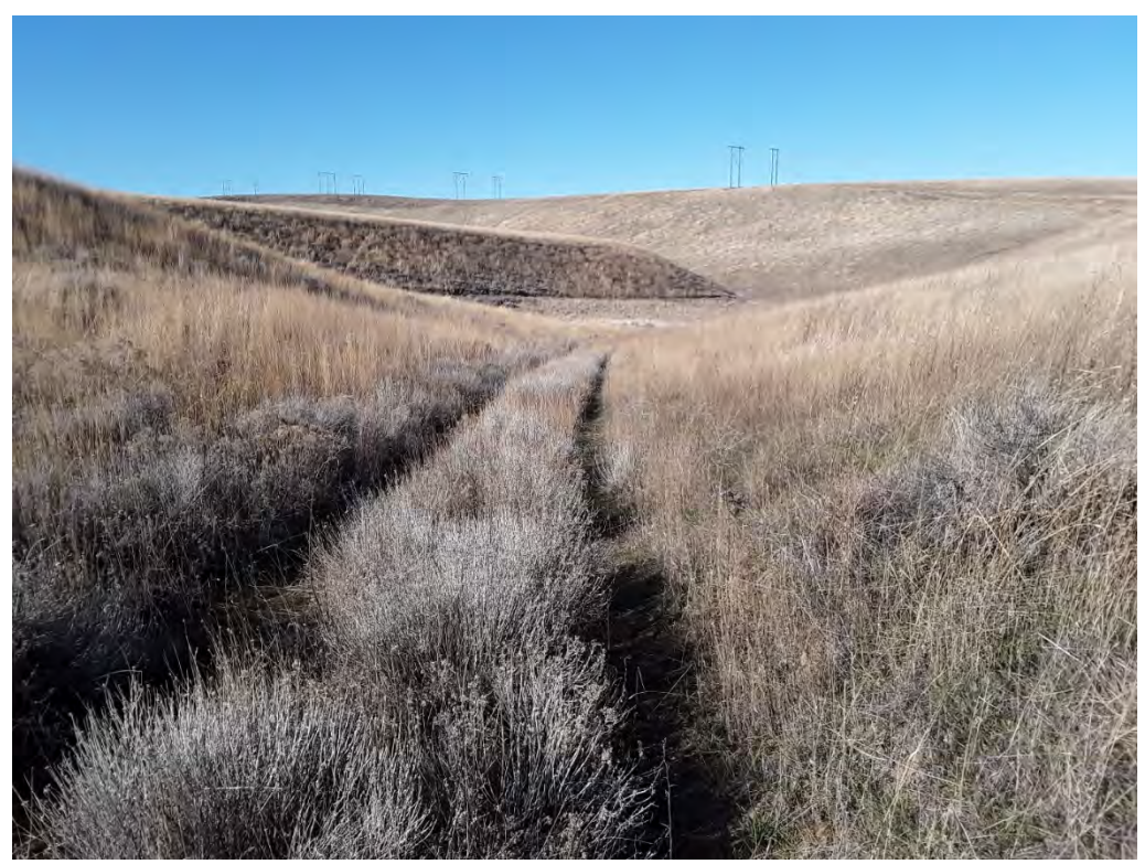
Photopoint 56. No beds, no banks, no stream present on NHD line.