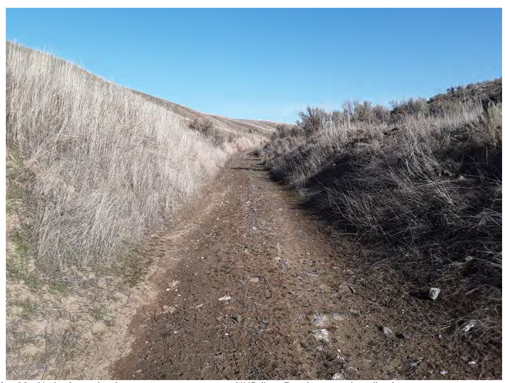
Photopoint 99. No beds, no banks, no stream present on NHD line. Road present in valley bottom.