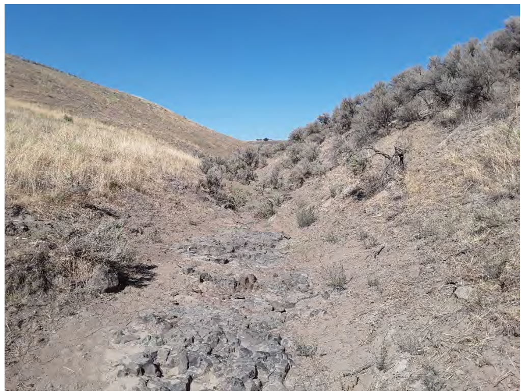
Photopoint EPH500 N. Ephemeral drainage, upland vegetation with no sign of water.