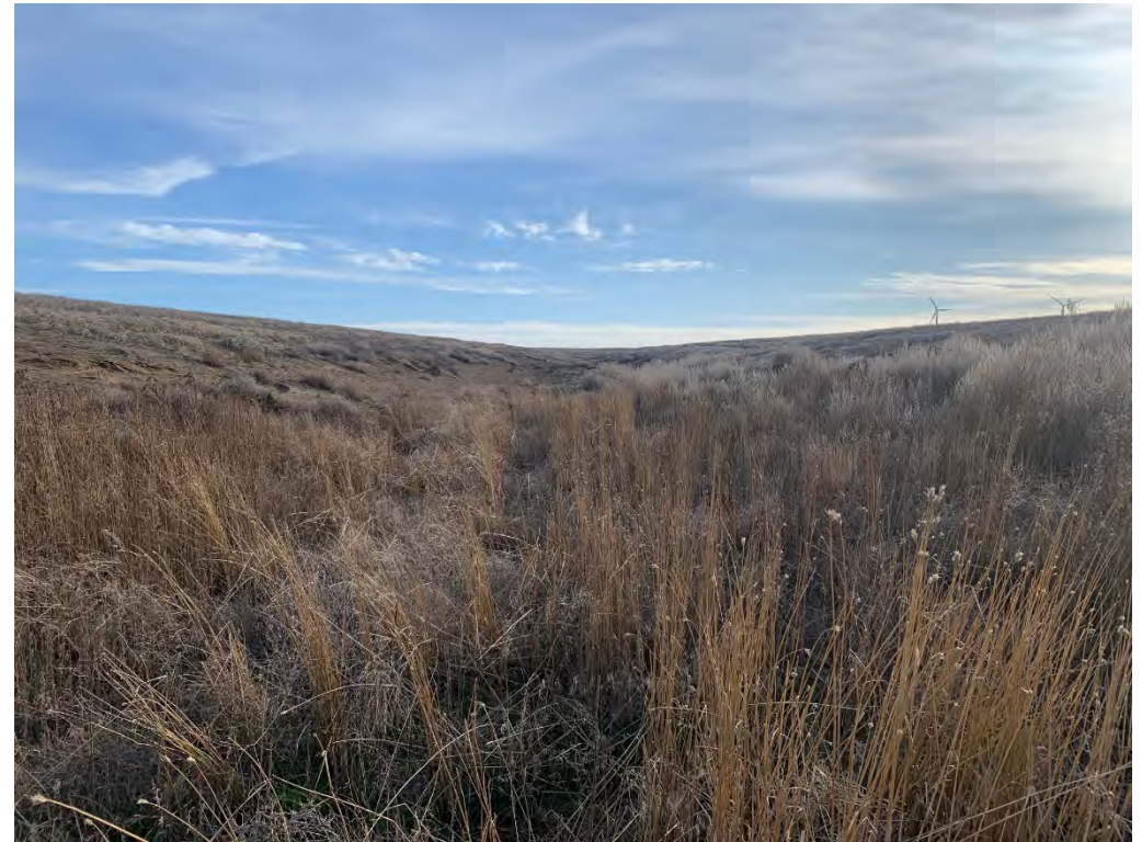
Photopoint 68. No beds, no banks, no stream present on NHD line.