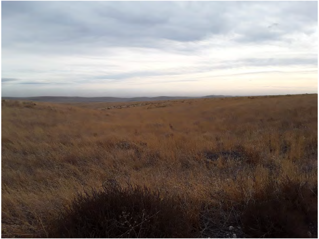
Photopoint 606. No beds, no banks, no stream present on NHD line.