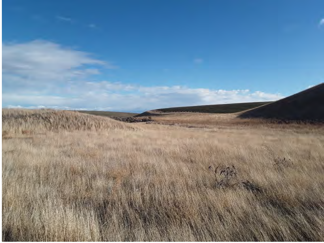
Photopoint 804. No beds, no banks, no stream present on NHD line.