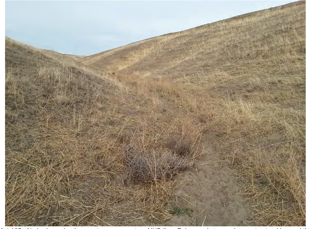
Photopoint 605. No beds, no banks, no stream present on NHD line. Ephemeral stream does not extend beyond this point.