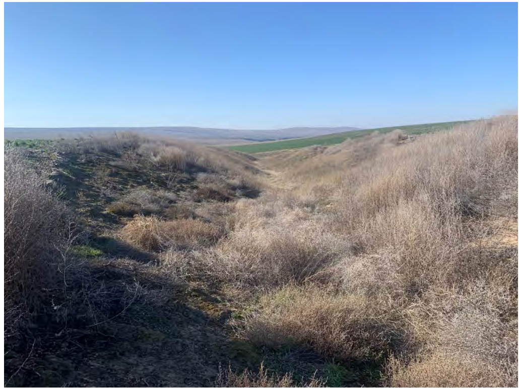
Photopoint 96. Ephemeral drainage, upland vegetation with no sign of water. EPH303.