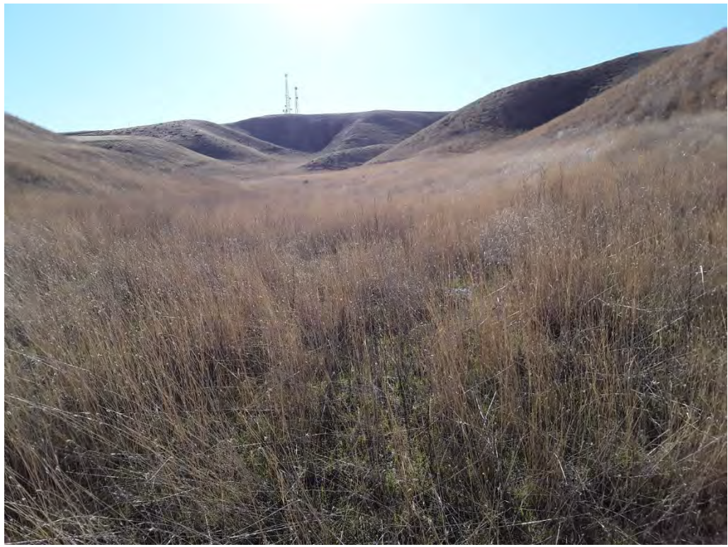
Photopoint 58. No beds, no banks, no stream present on NHD line.