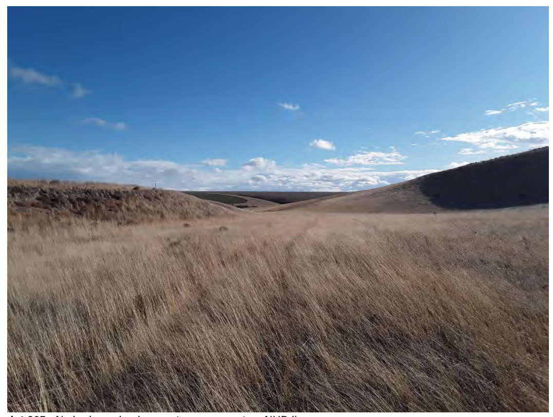
Photopoint 805. No beds, no banks, no stream present on NHD line.