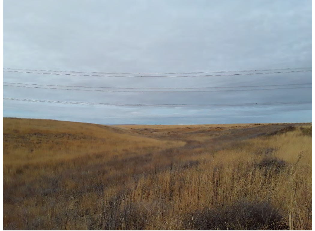
Photopoint 716. No beds, no banks, no stream present on NHD line.