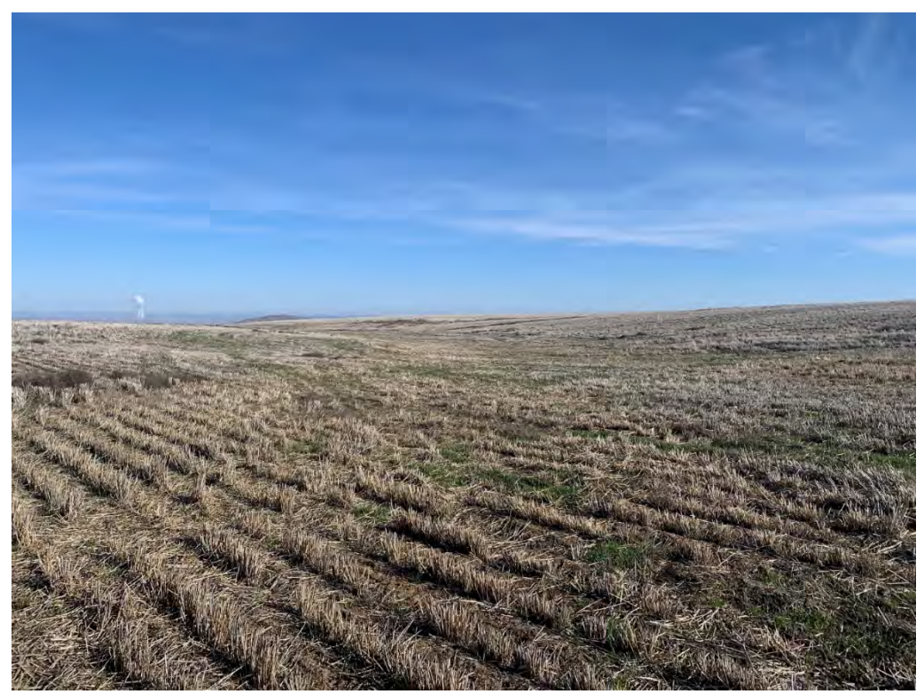
Photopoint 25. No beds, no banks, no stream present on NHD line.