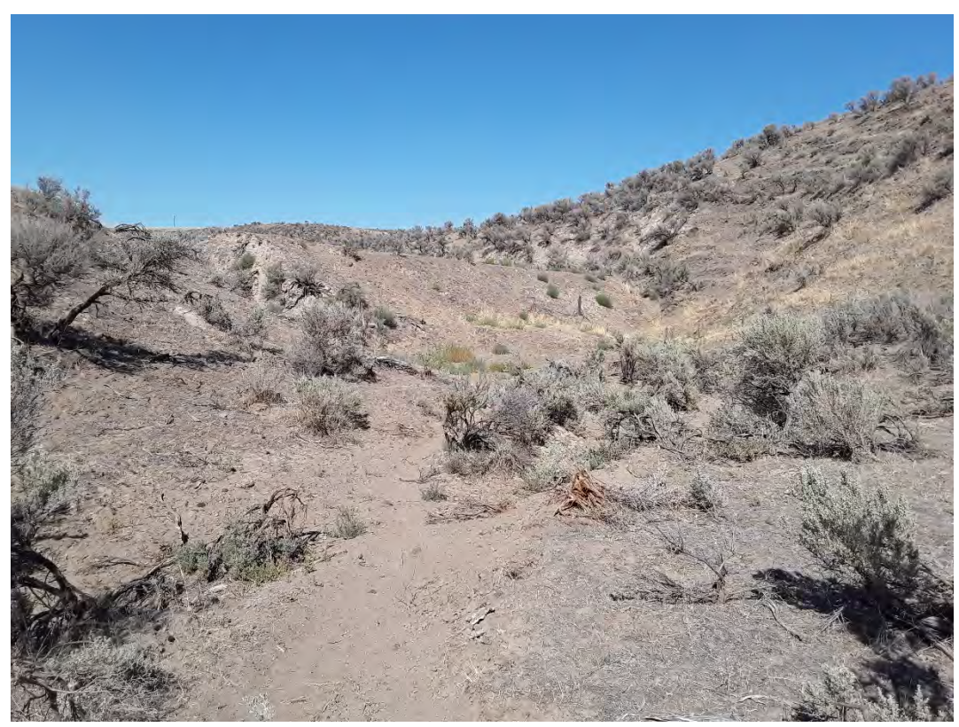
Photopoint EPH500 levee 2. Ephemeral drainage, upland vegetation with no sign of water.