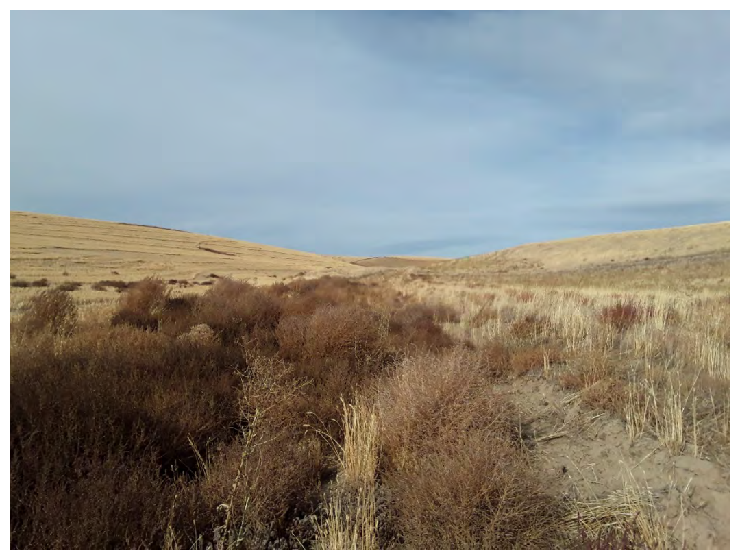
Photopoint 602. Ephemeral drainage, upland vegetation with no sign of water Ephemeral stream does not extend uphill. EPH306.