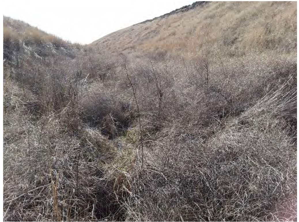
Photopoint 55. No beds, no banks, no stream present on NHD line.