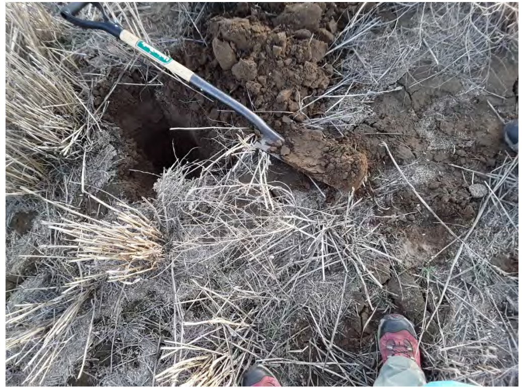
Photopoint 41. Soil sample site. SS01.