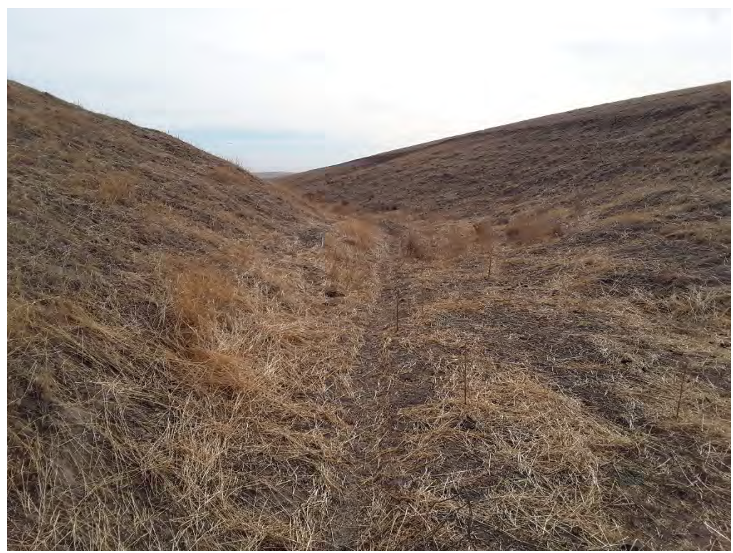
Photopoint 604. No beds, no banks, no stream present on NHD line. Cattle trail.