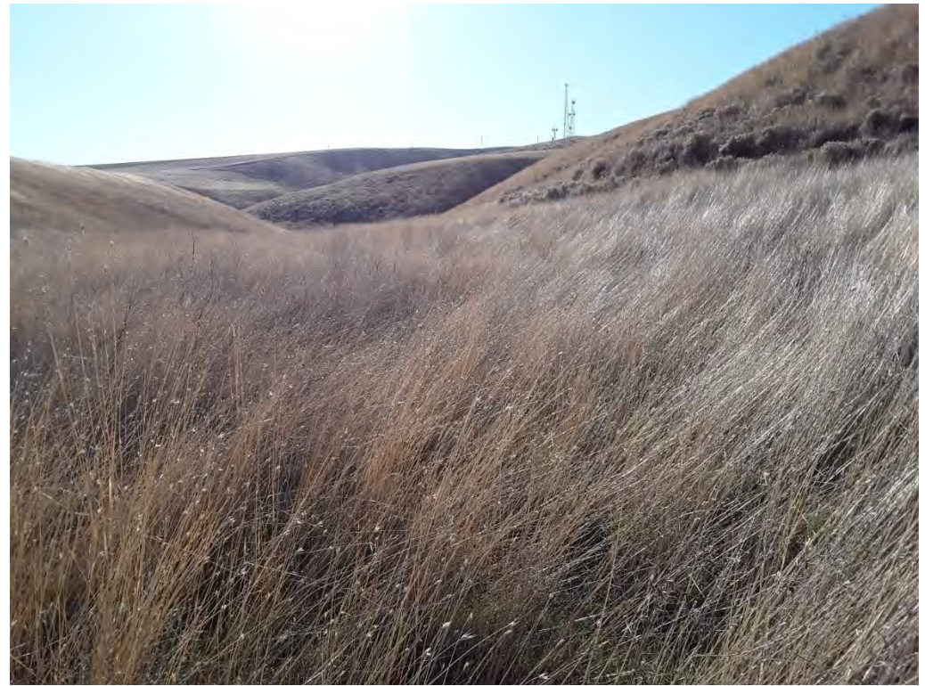
Photopoint 57. No beds, no banks, no stream present on NHD line.