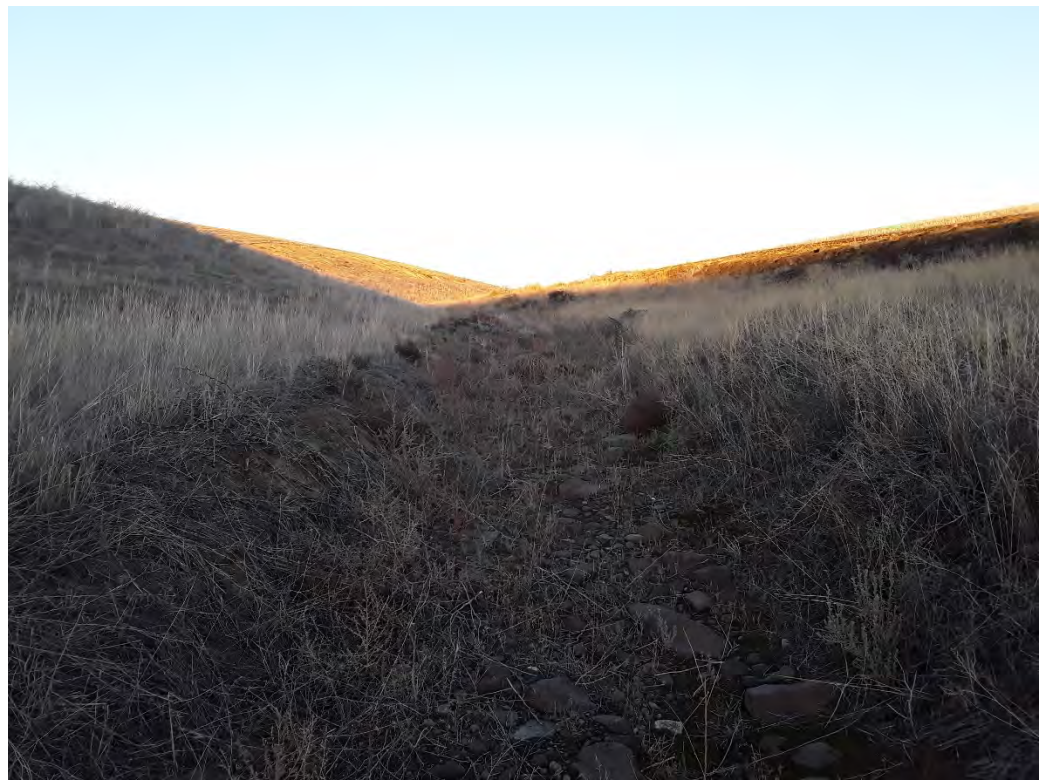
Photopoint 811. Ephemeral drainage, upland vegetation with no sign of water, EPH800.