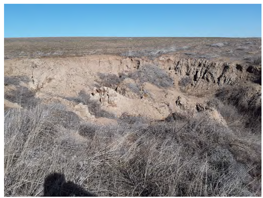
Photopoint 50. Erosional Feature. EPH305.