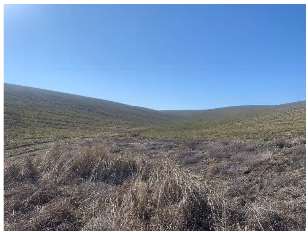
Photopoint 97. Ephemeral drainage, upland vegetation with no sign of water. EPH303.