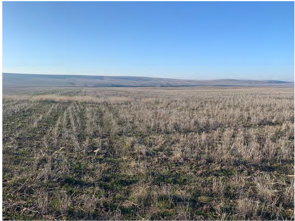
Photopoint 91. No beds, no banks, no stream present on NHD line.