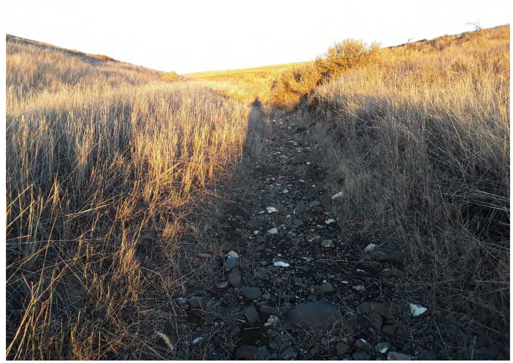
Photopoint 812. Ephemeral drainage, upland vegetation with no sign of water, EPH800.