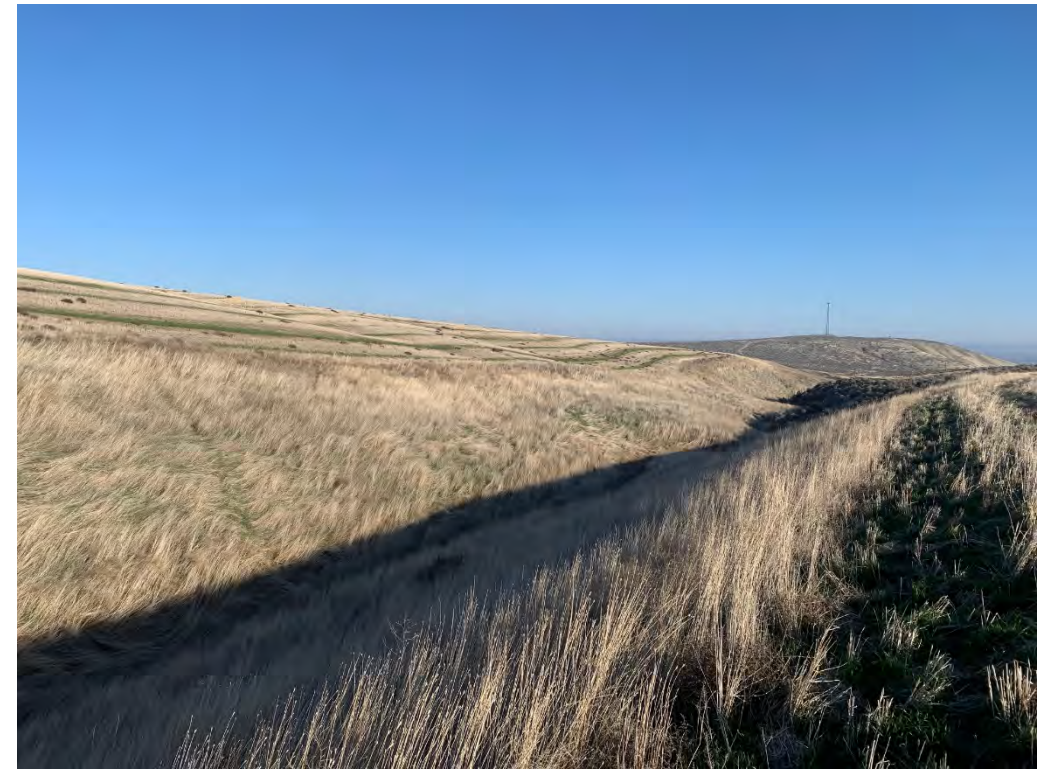
Photopoint 72. Ephemeral drainage, upland vegetation with no sign of water. EPH301.