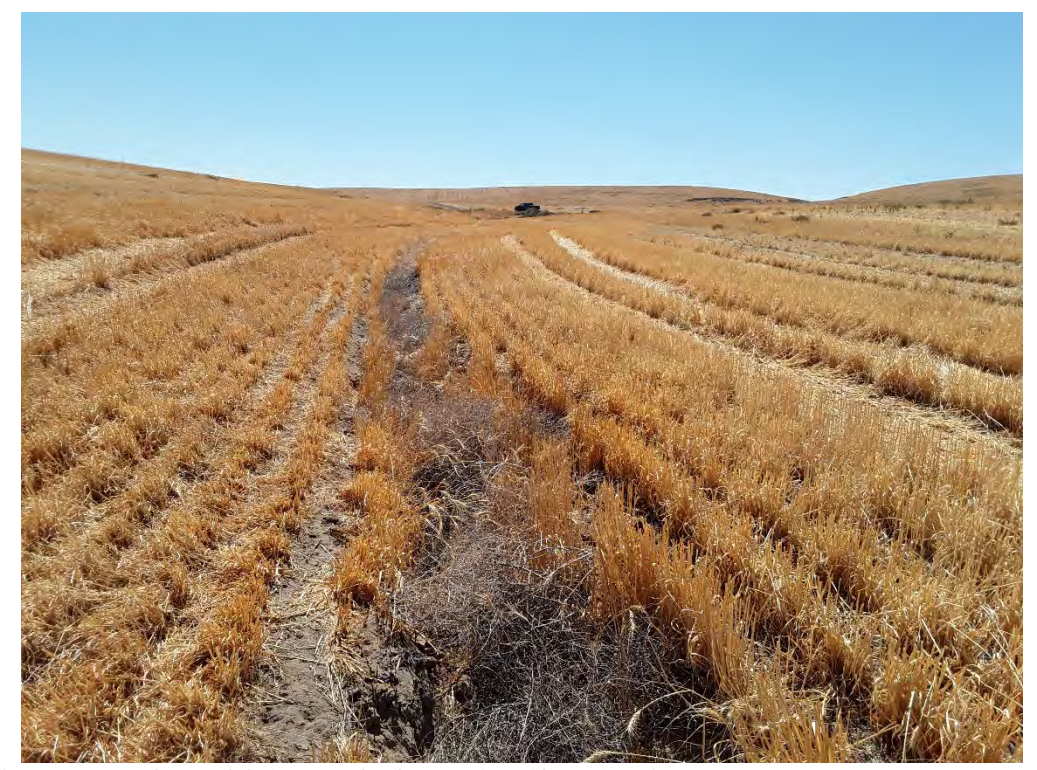
Photopoint EPH104. Ephemeral drainage, upland vegetation with no sign of water.