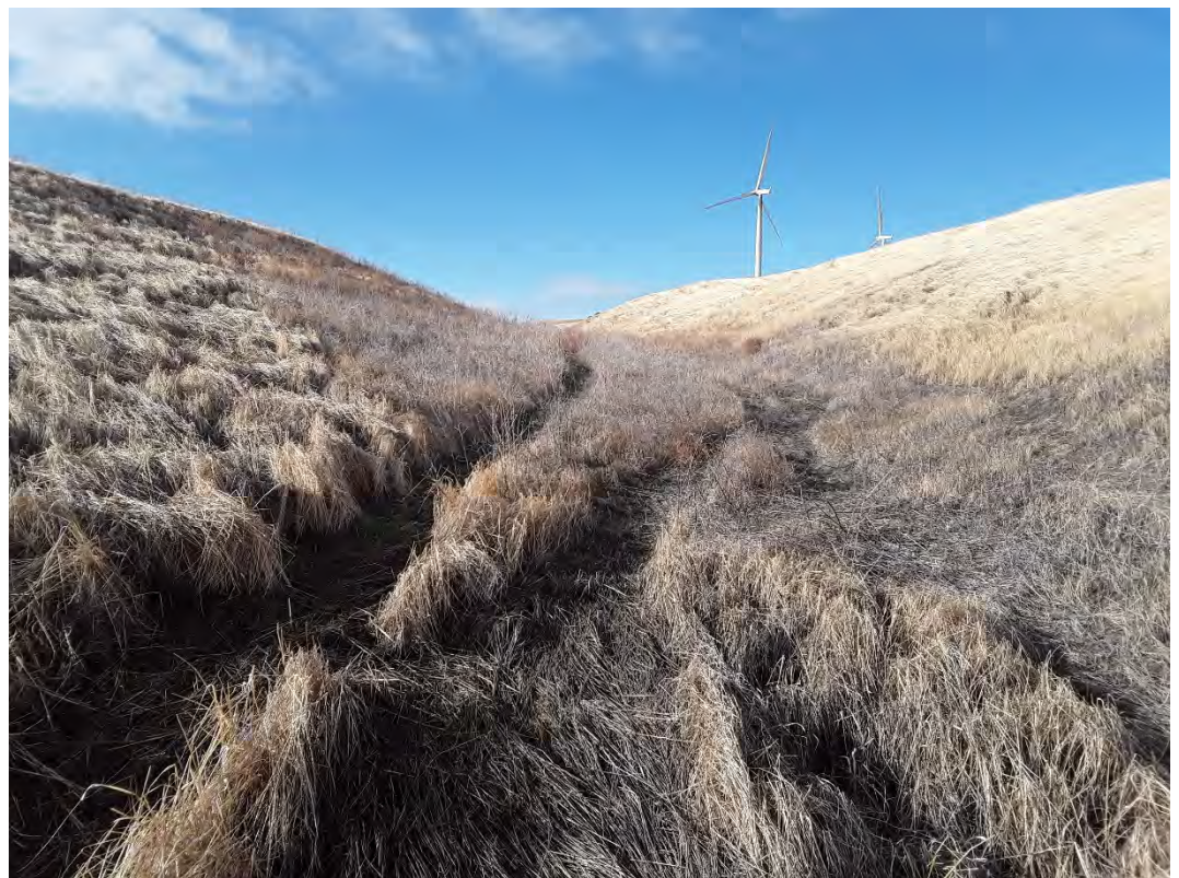
Photopoint 802. No beds, no banks, no stream present on NHD line.