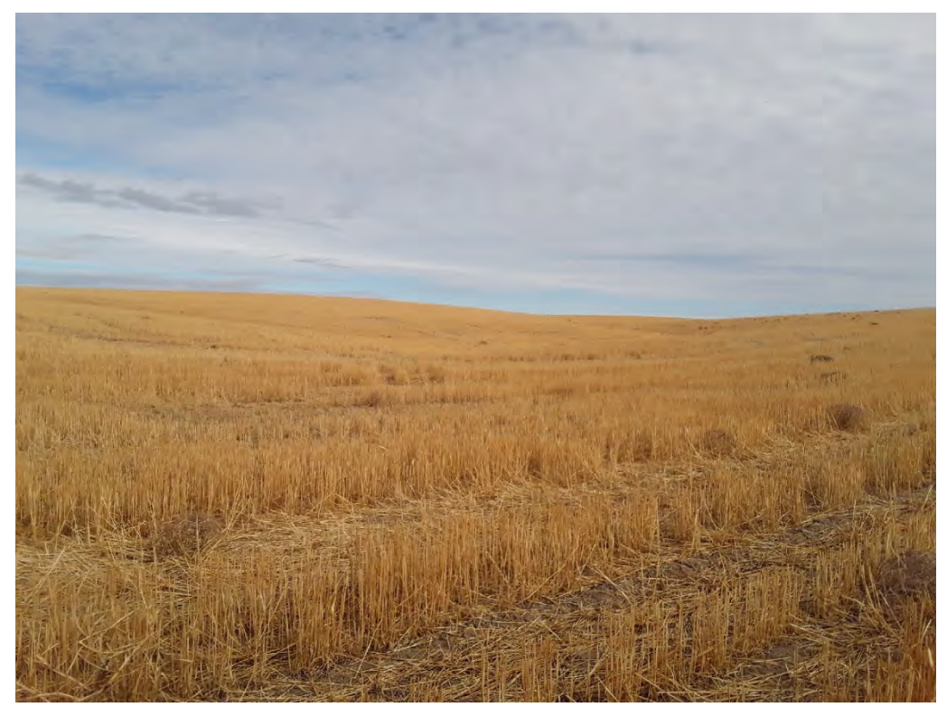
Photopoint 719. No beds, no banks, no stream present on NHD line.