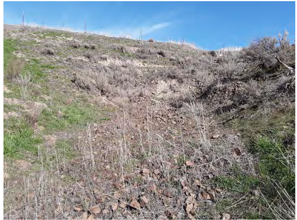
Photopoint 102. Ephemeral drainage, upland vegetation with no sign of water. EPH405.