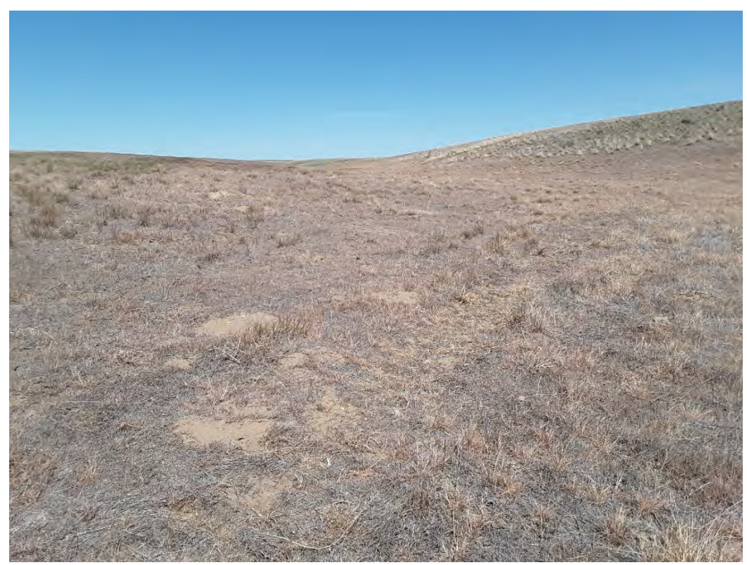
Photopoint 901. No beds, no banks, no stream present on NHD line. Facing northeast.