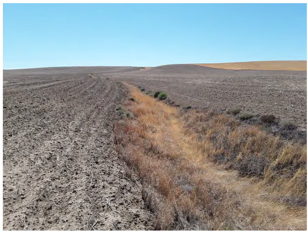
Photopoint XBB 312. No beds, no banks, no stream present on NHD line.