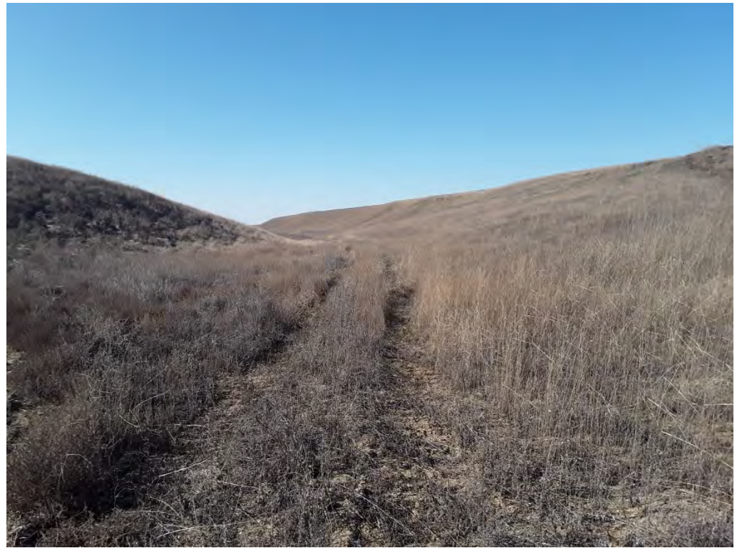
Photopoint 47. No beds, no banks, no stream present on NHD line.