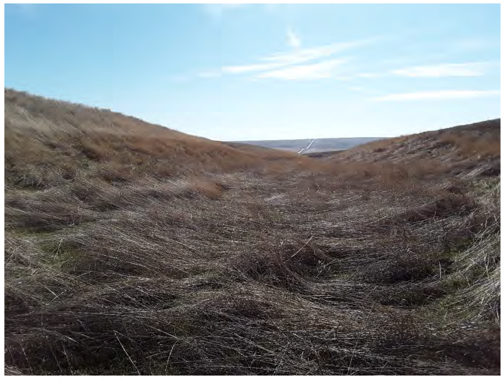
Photopoint 109. No beds, no banks, no stream present on NHD line.