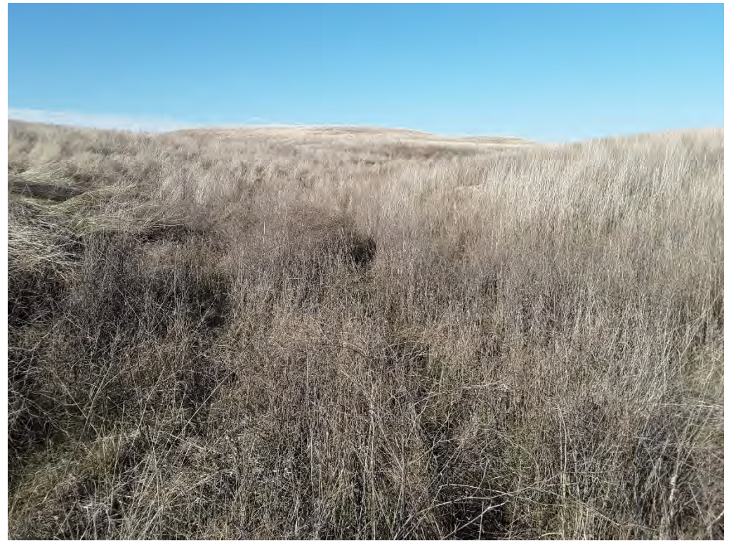
Photopoint 76. No beds, no banks, no stream present on NHD line.