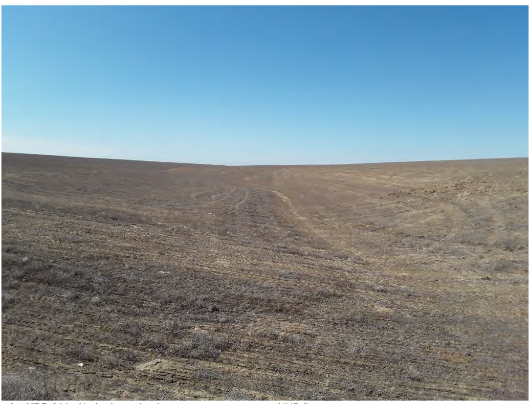
Photopoint XBB 300. No beds, no banks, no stream present on NHD line.