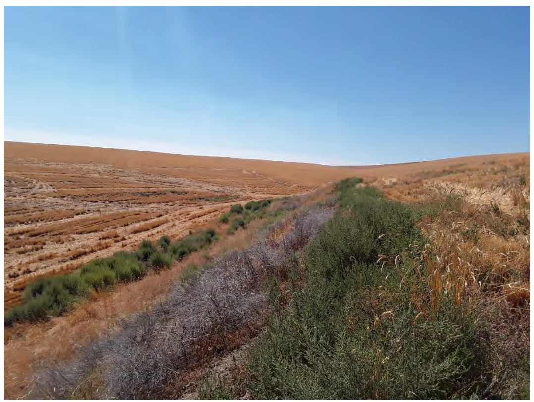
Photopoint XBB 302. No beds, no banks, no stream present on NHD line.