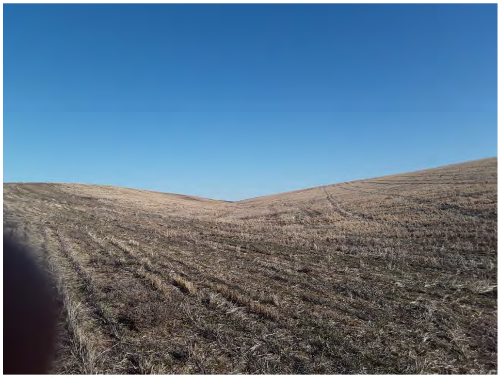
Photopoint 48. No beds, no banks, no stream present on NHD line.