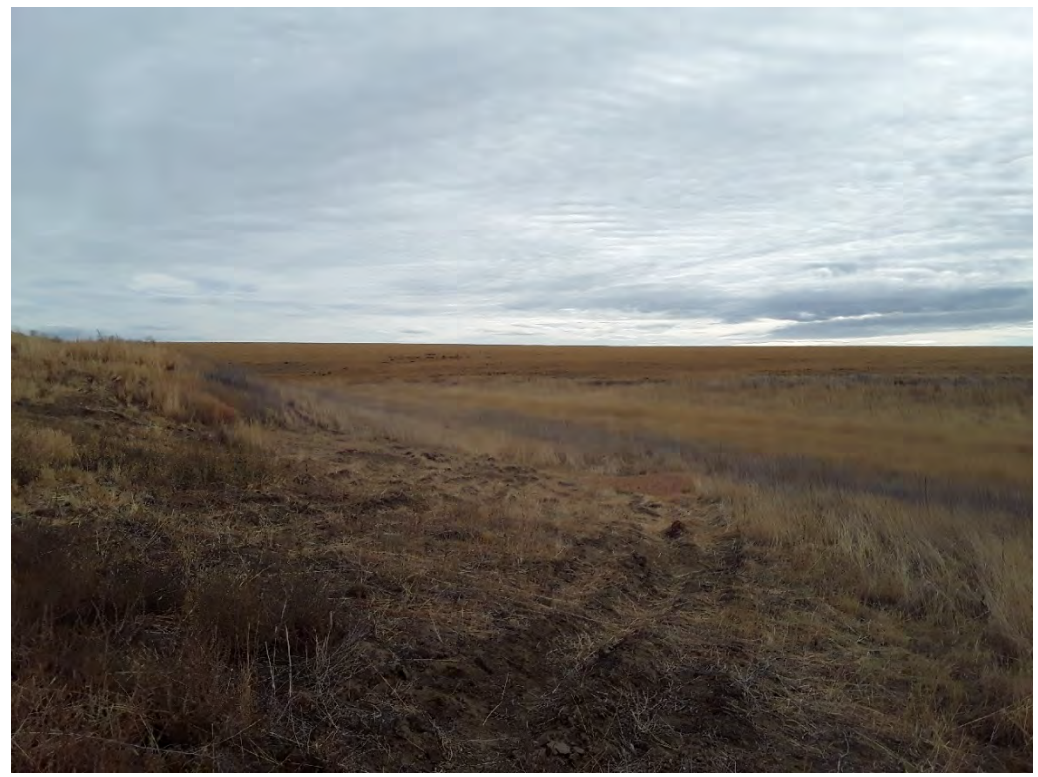
Photopoint 717. No beds, no banks, no stream present on NHD line.