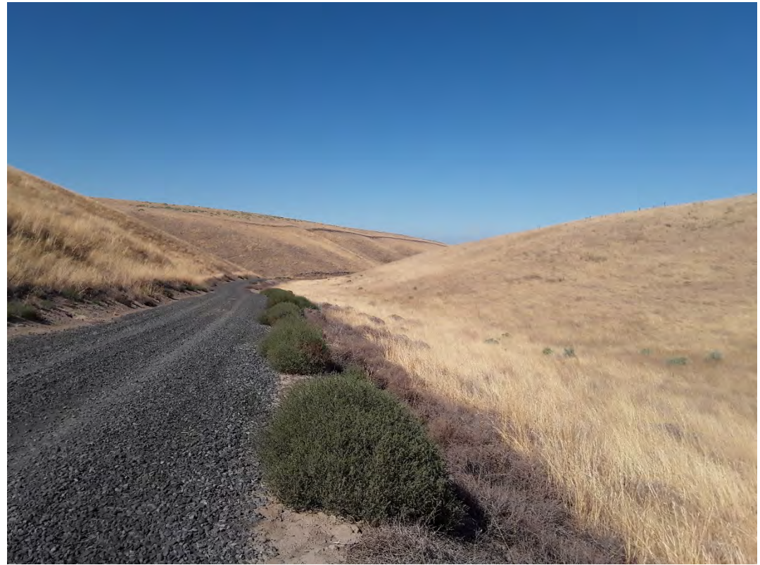
Photopoint XBB 307. No beds, no banks, no stream present on NHD line.