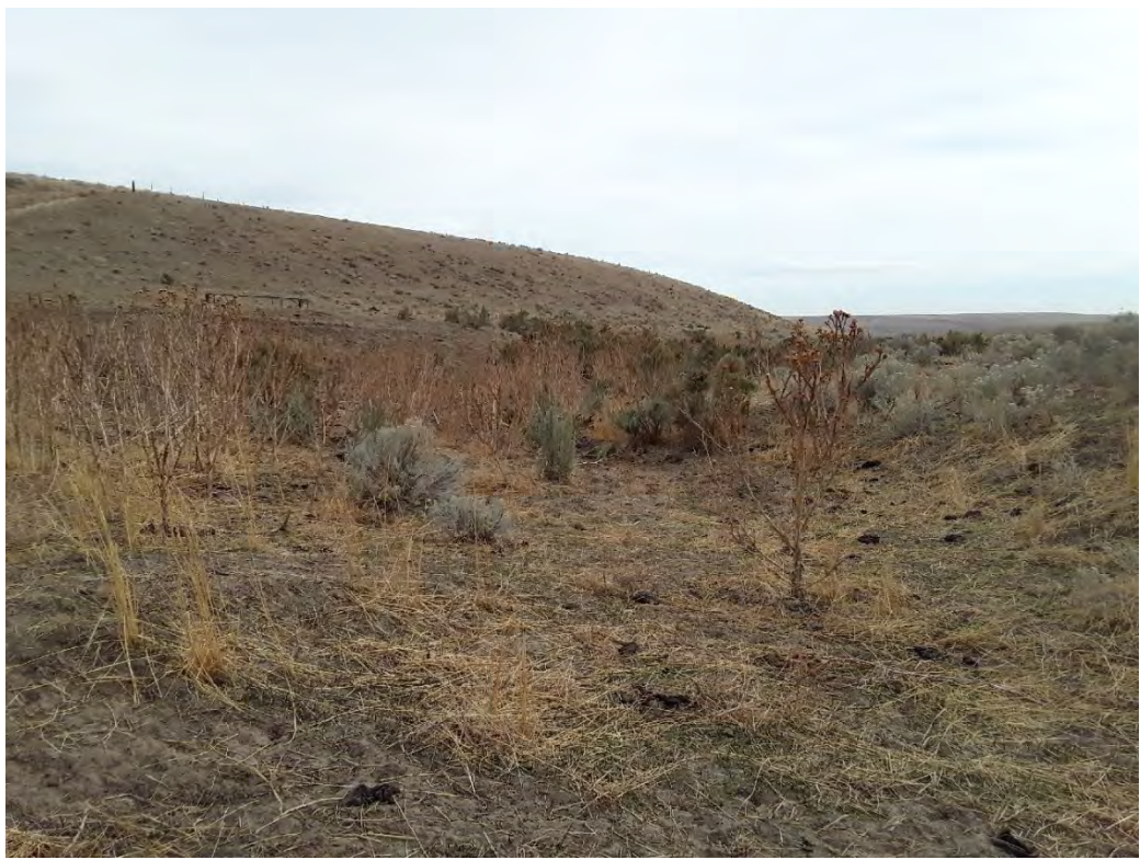
Photopoint 711. No beds, no banks, no stream present on NHD line.