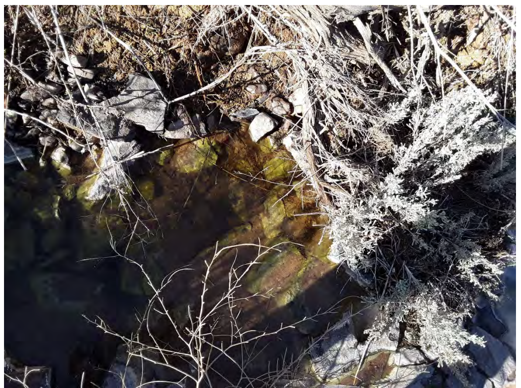
Photopoint 11. Water in pools due to recent rainfall. INT01.