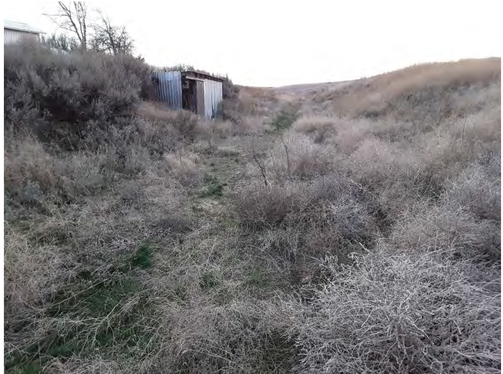
Photopoint 70. No beds, no banks, no stream present on NHD line.