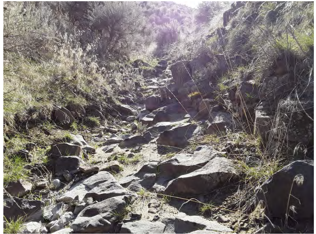
Photopoint 10. Streambed with watermarks on rocks, and water in pools due to recent rainfall. INT01.