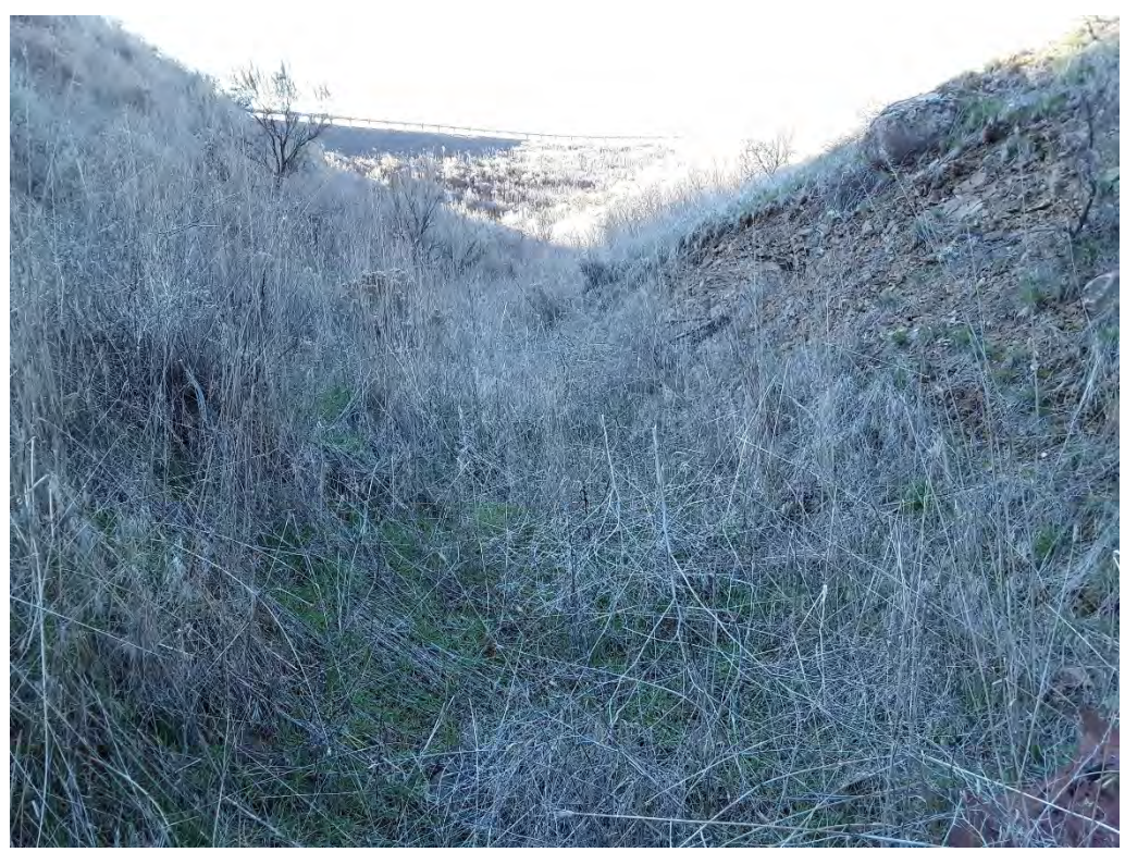
Photopoint 79. Ephemeral drainage, upland vegetation with no sign of water. EPH308.