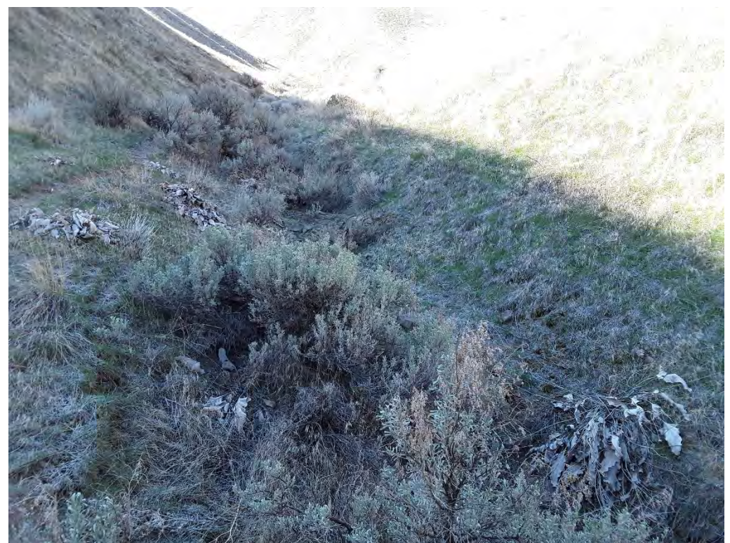
Photopoint 23. Ephemeral drainage, upland vegetation with no sign of water. EPH203.