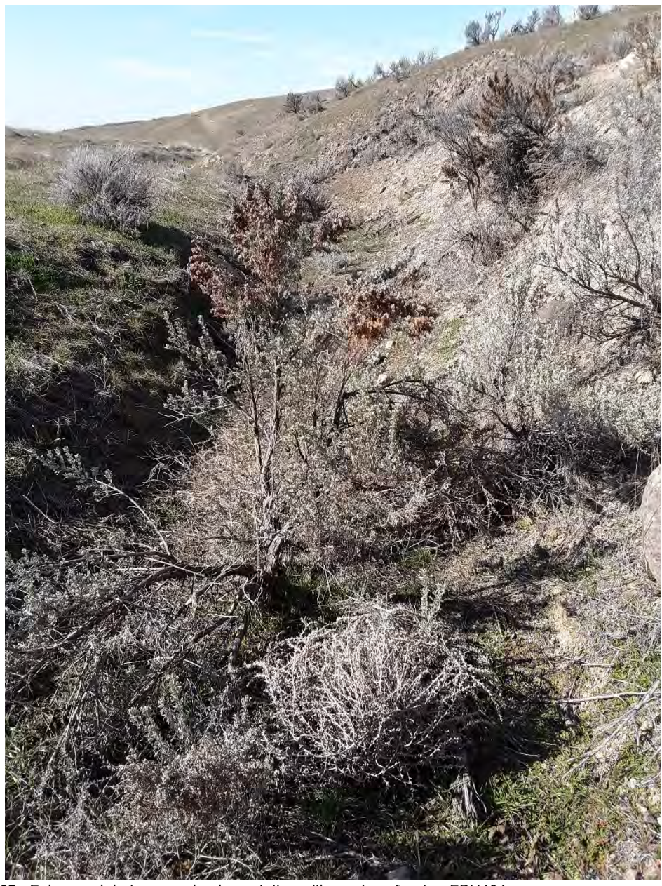
Photopoint 105. Ephemeral drainage, upland vegetation with no sign of water. EPH404.