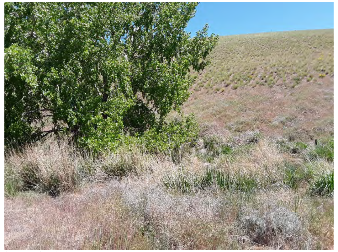
Photopoint E10a. Overview.