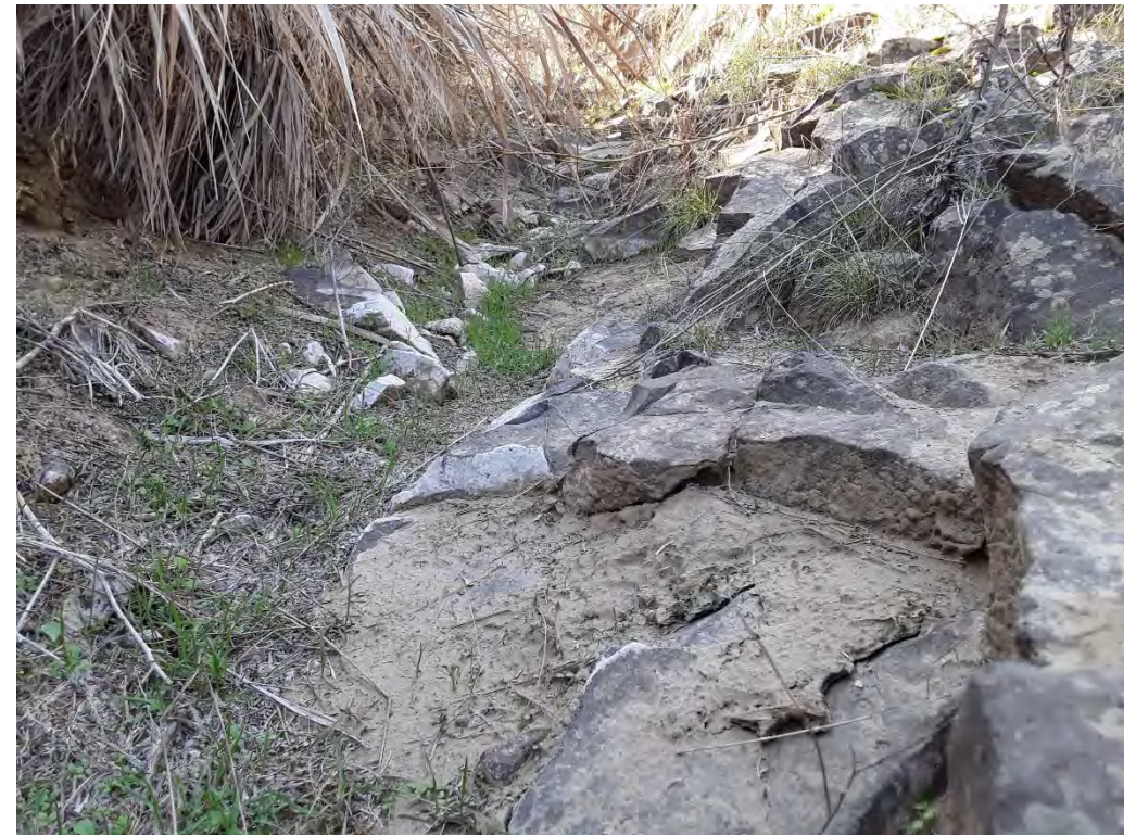
Photopoint 12. Waterline on rocks. INT01.