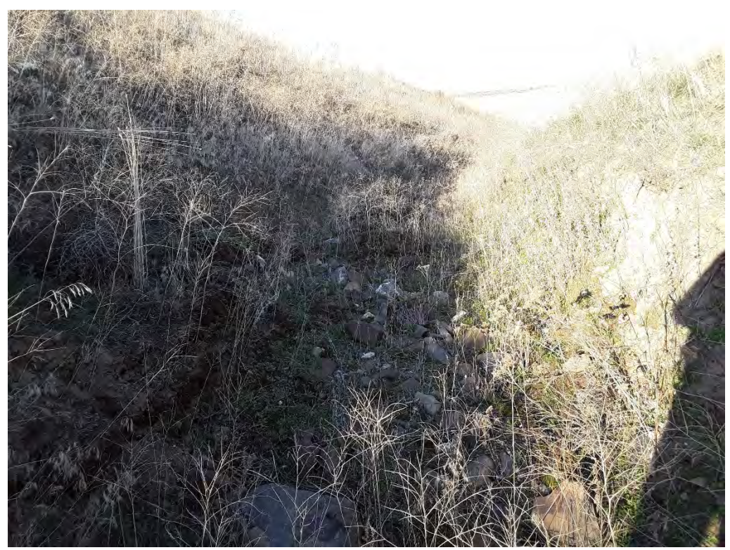
Photopoint 19. Ephemeral drainage, upland vegetation with no sign of water. EPH105.