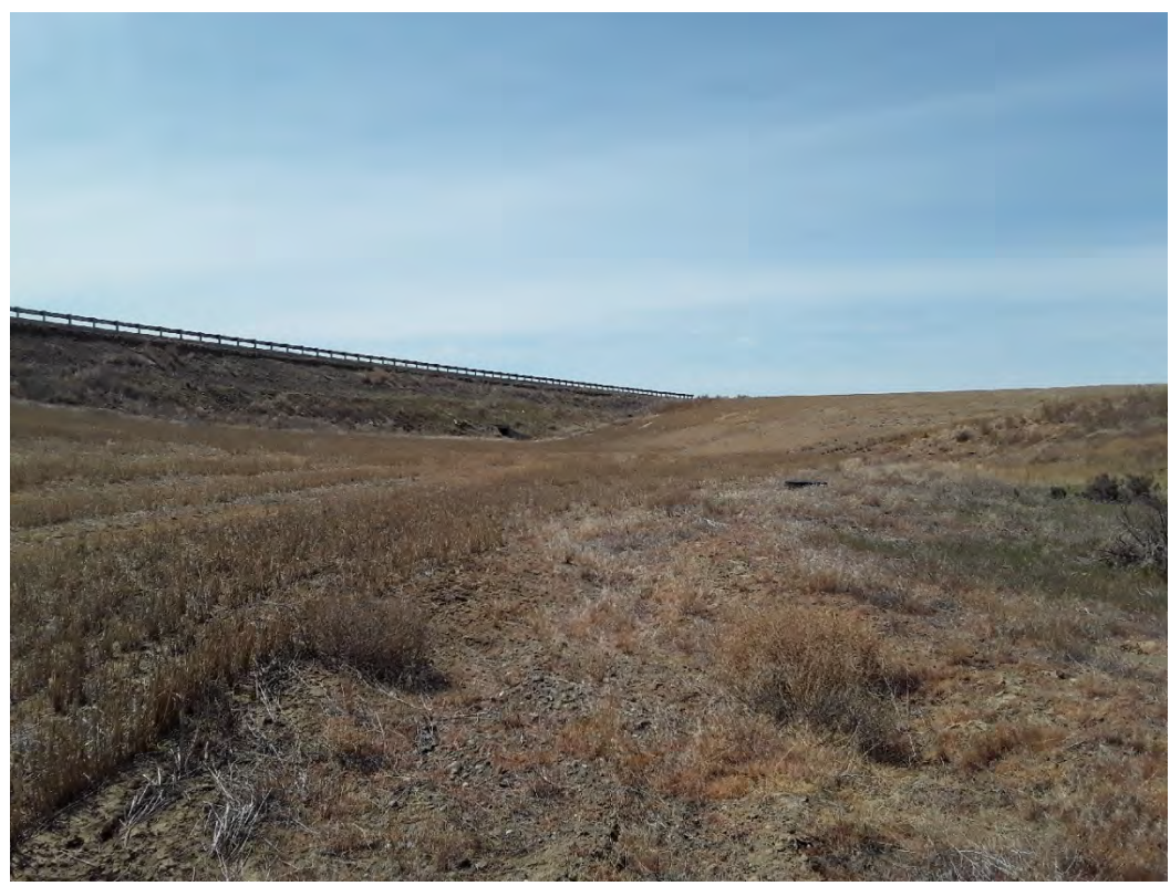
Photopoint 900c. Ephemeral drainage. EPH-900. No bed or banks southwest of here.