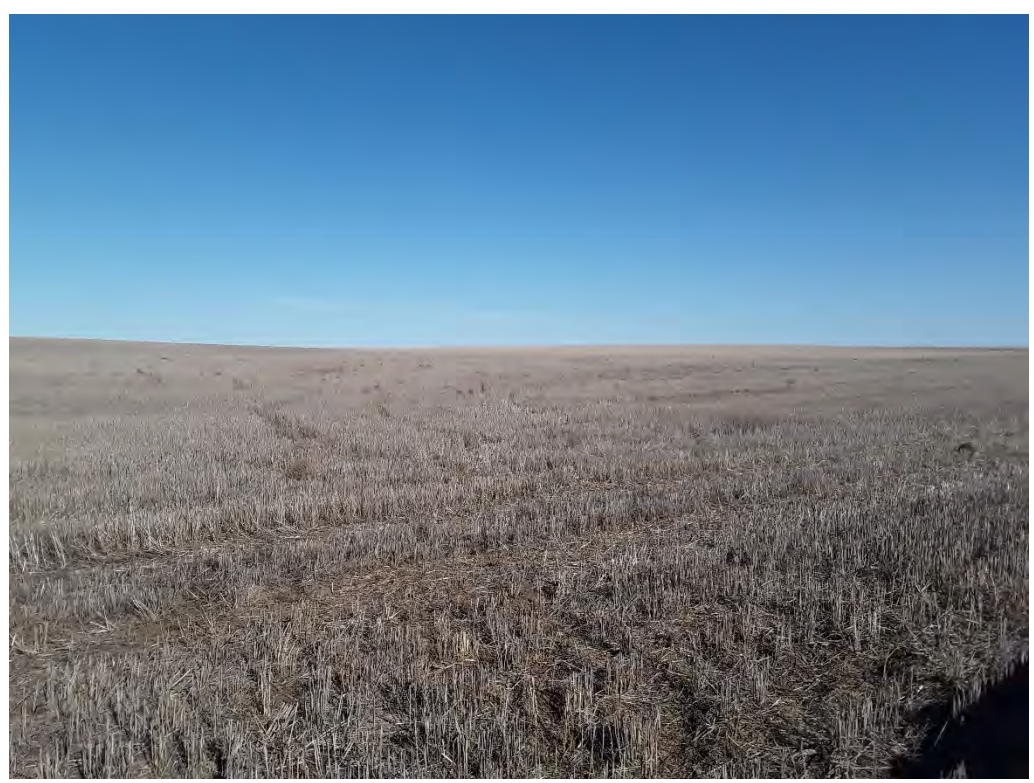
Photopoint 27. No beds, no banks, no stream present on NHD line.