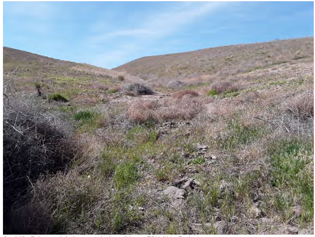
Photopoint 905. Ephemeral drainage, typical conditions. EPH-904. Facing west.