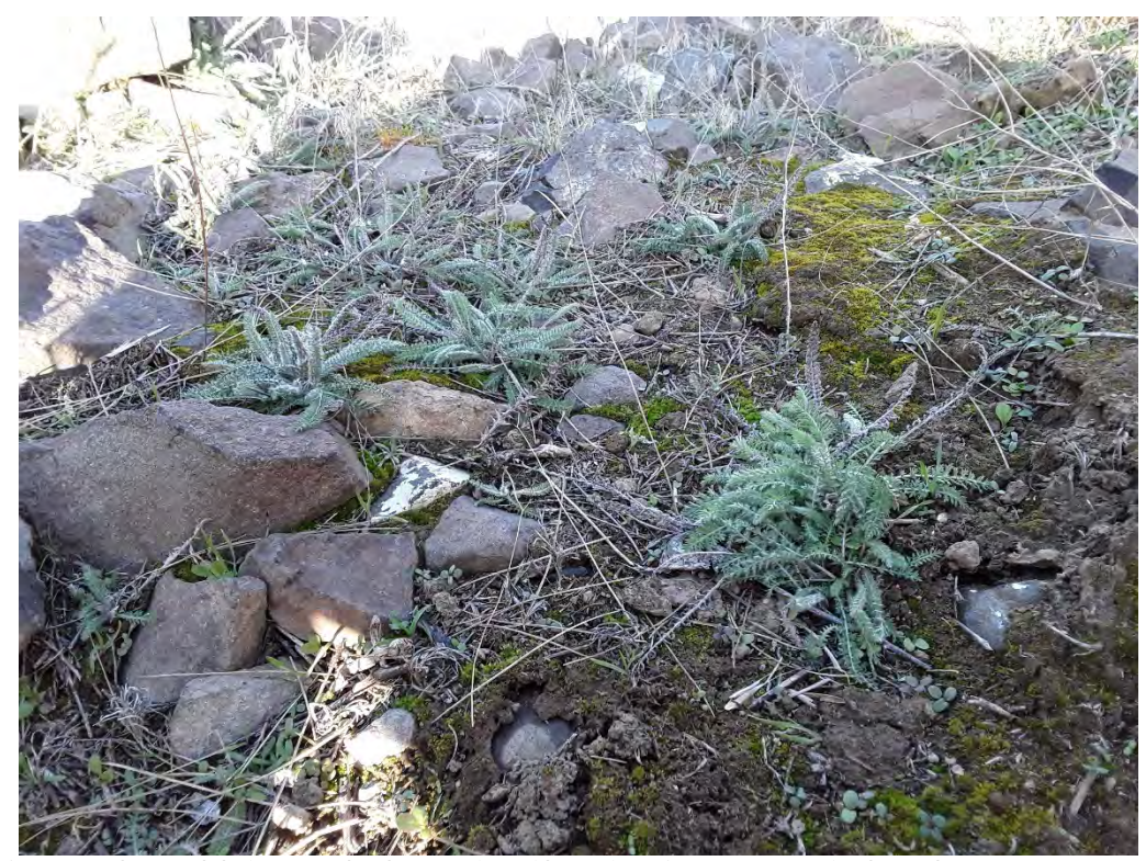
Photopoint 16. Ephemeral drainage, upland vegetation with no sign of water. Yarrow in channel. EPH105.