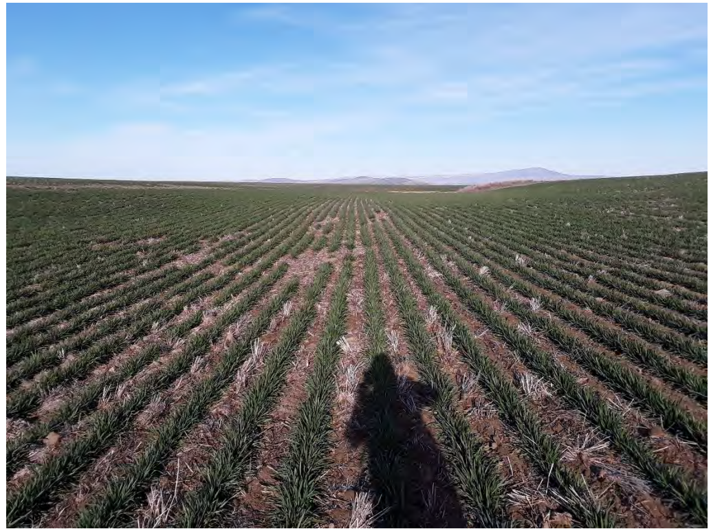
Photopoint 38. No beds, no banks, no stream present on NHD line.