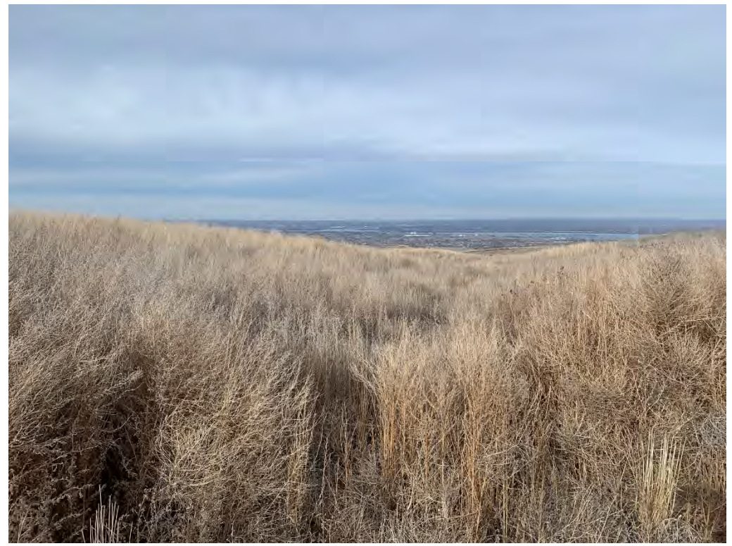
Photopoint 67. No beds, no banks, no stream present on NHD line.