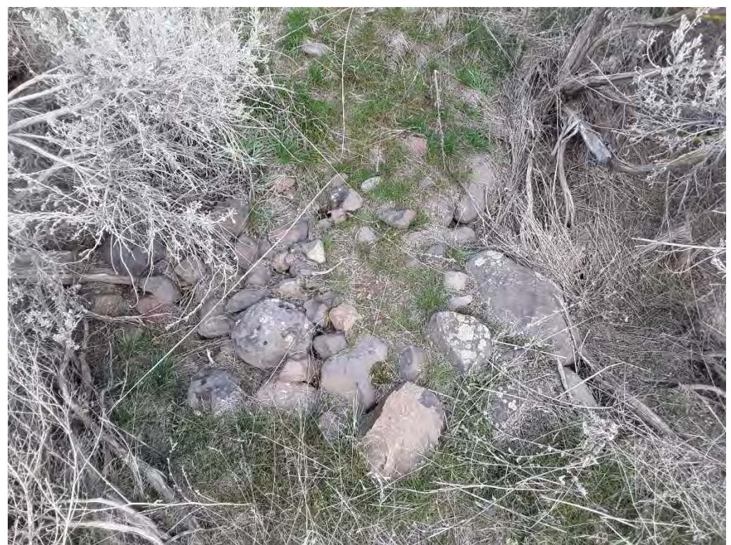
Photopoint 64. Streambed with damp soils. INT02.