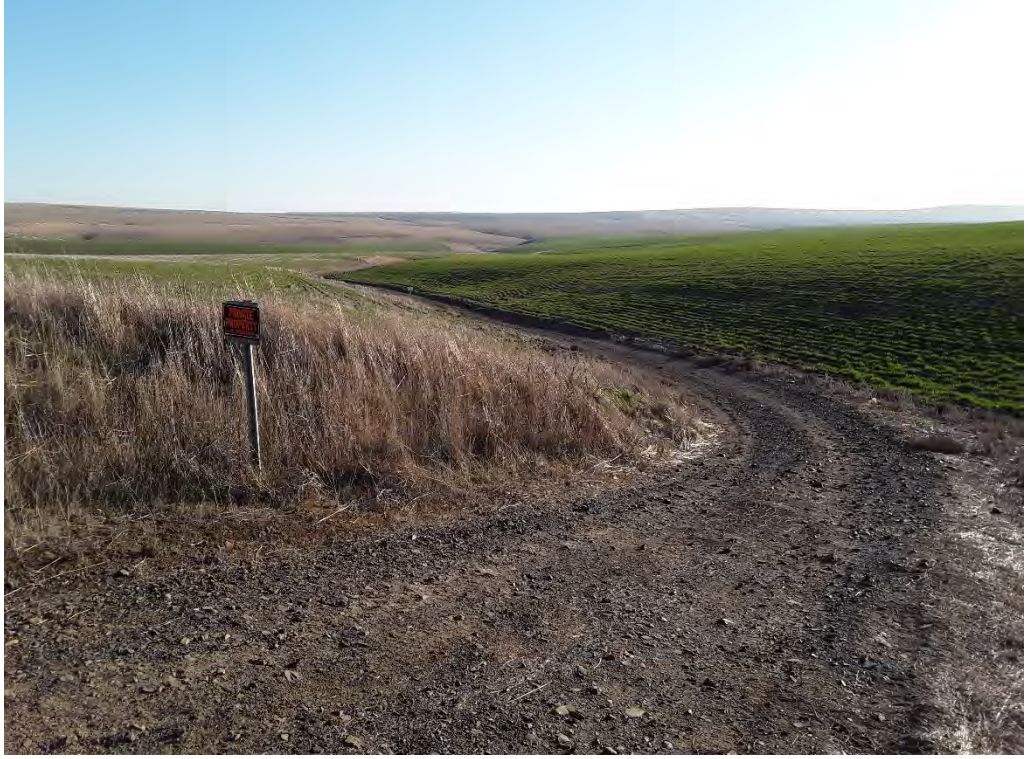
Photopoint 100. No beds, no banks, no stream present on NHD line.