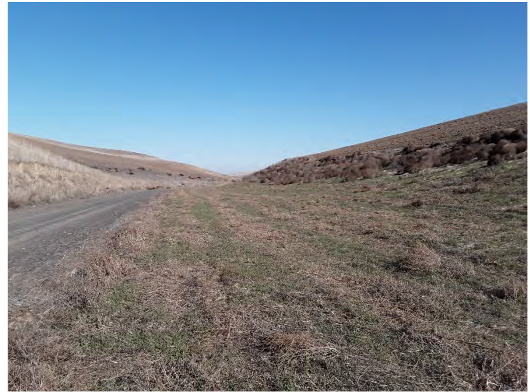
Photopoint 53. No beds, no banks, no stream present on NHD line.