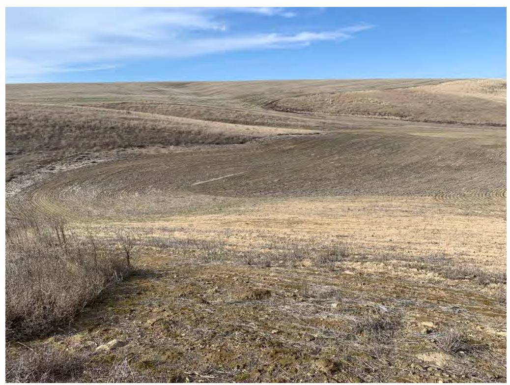
Photopoint 46. No beds, no banks, no stream present on NHD line.