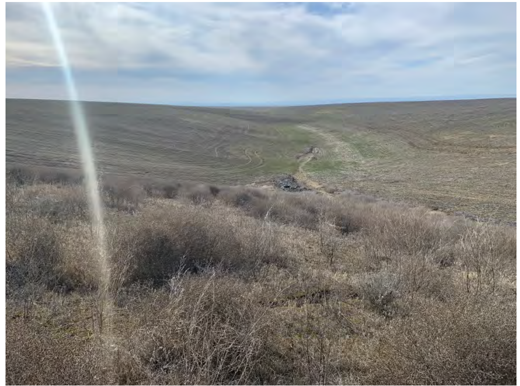
Photopoint 45. No beds, no banks, no stream present on NHD line.