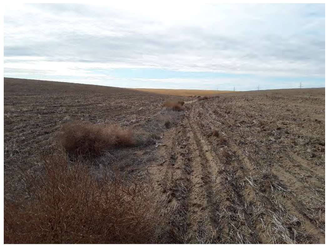
Photopoint 715. No beds, no banks, no stream present on NHD line.