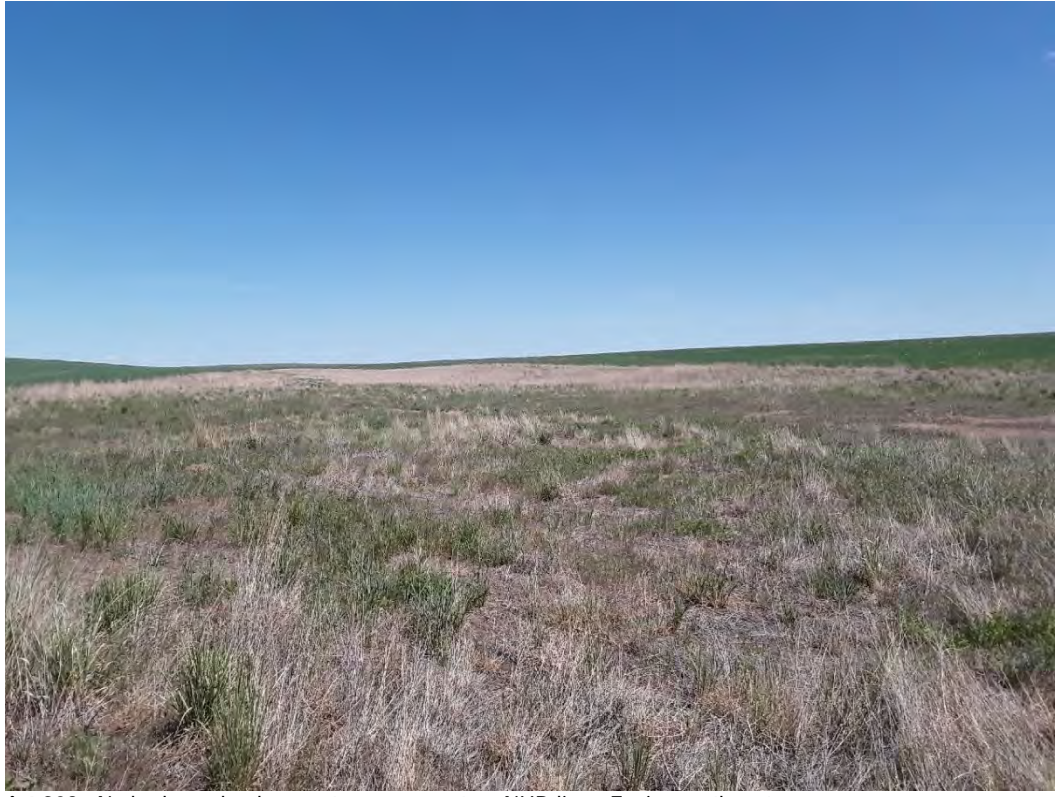
Photopoint 902. No beds, no banks, no stream present on NHD line. Facing northeast.