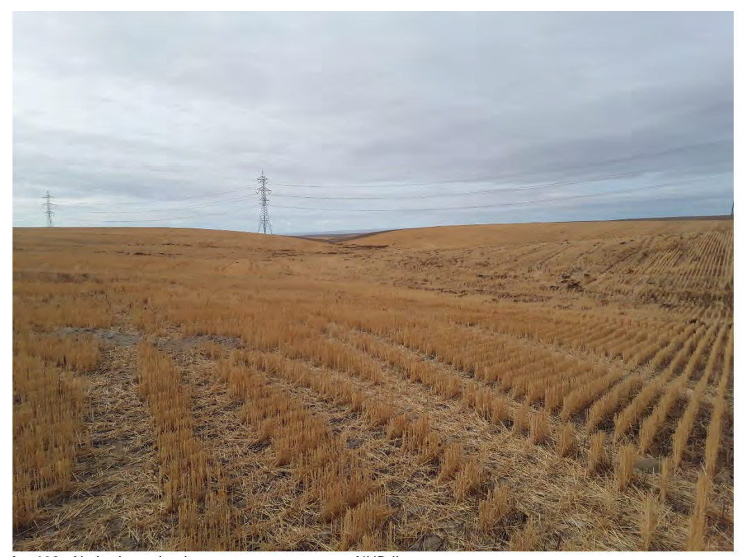
Photopoint 609. No beds, no banks, no stream present on NHD line.