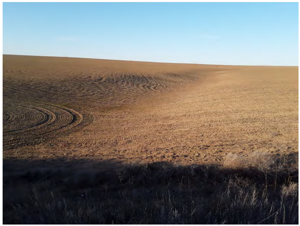
Photopoint 33. No beds, no banks, no stream present on NHD line.