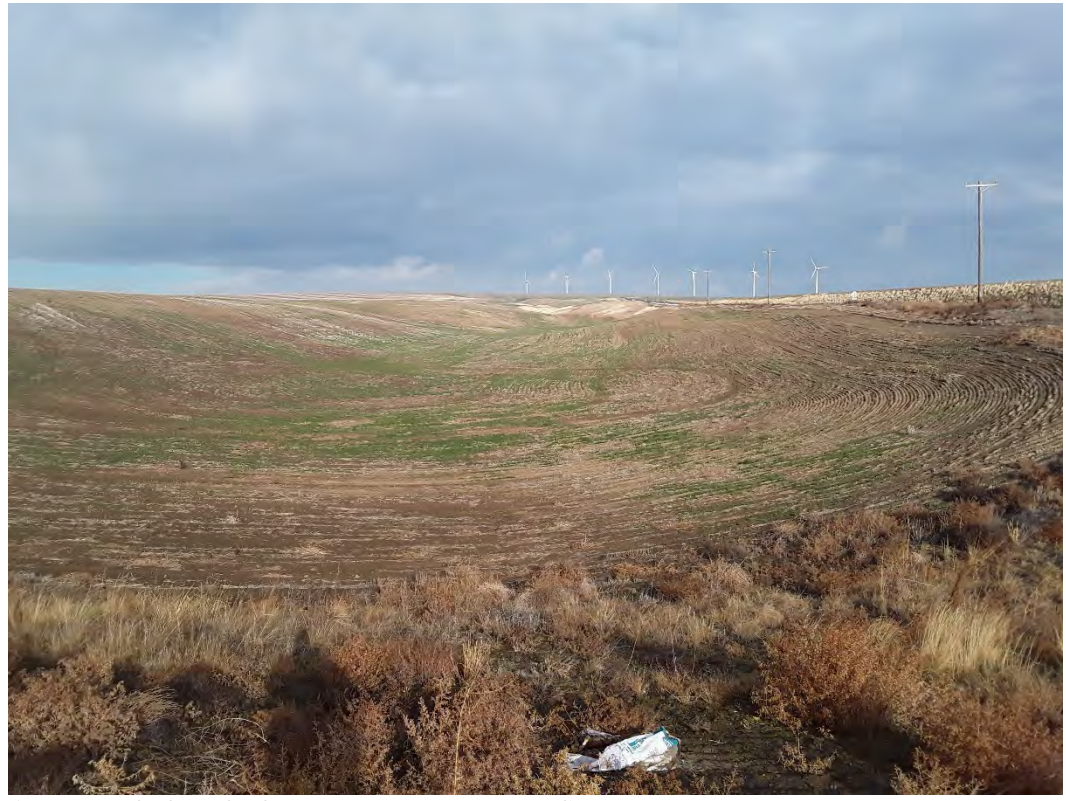
Photopoint 801. No beds, no banks, no stream present on NHD line.