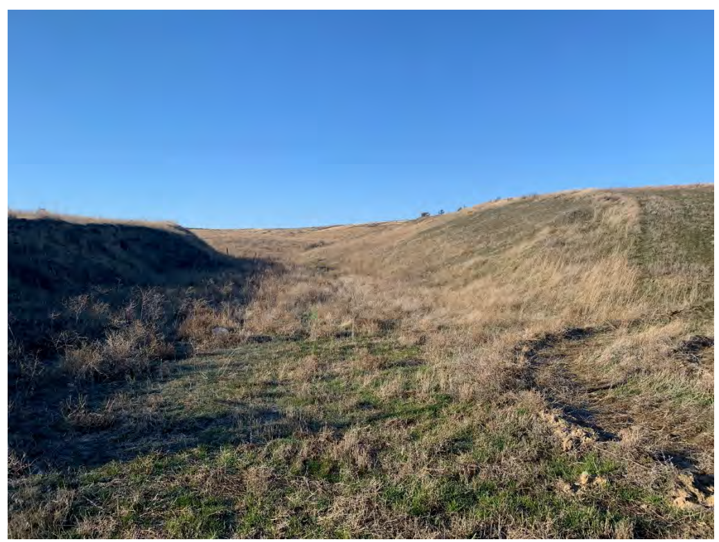
Photopoint 73. No beds, no banks, no stream present on NHD line.