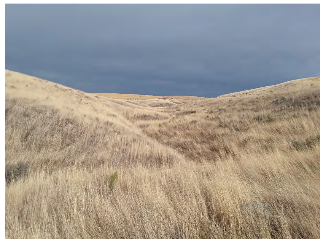
Photopoint 600. Ephemeral drainage, upland vegetation with no sign of water. Overview of drainage, EPH401.