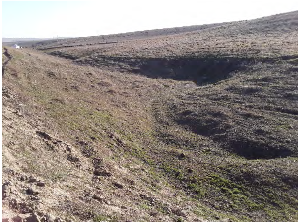
Photopoint 83. Ephemeral drainage, upland vegetation with no sign of water. EPH307.