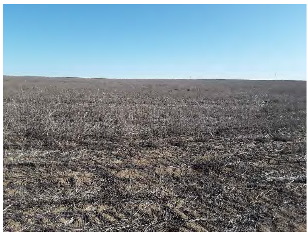
Photopoint 7. No beds, no banks, no stream present on NHD line.