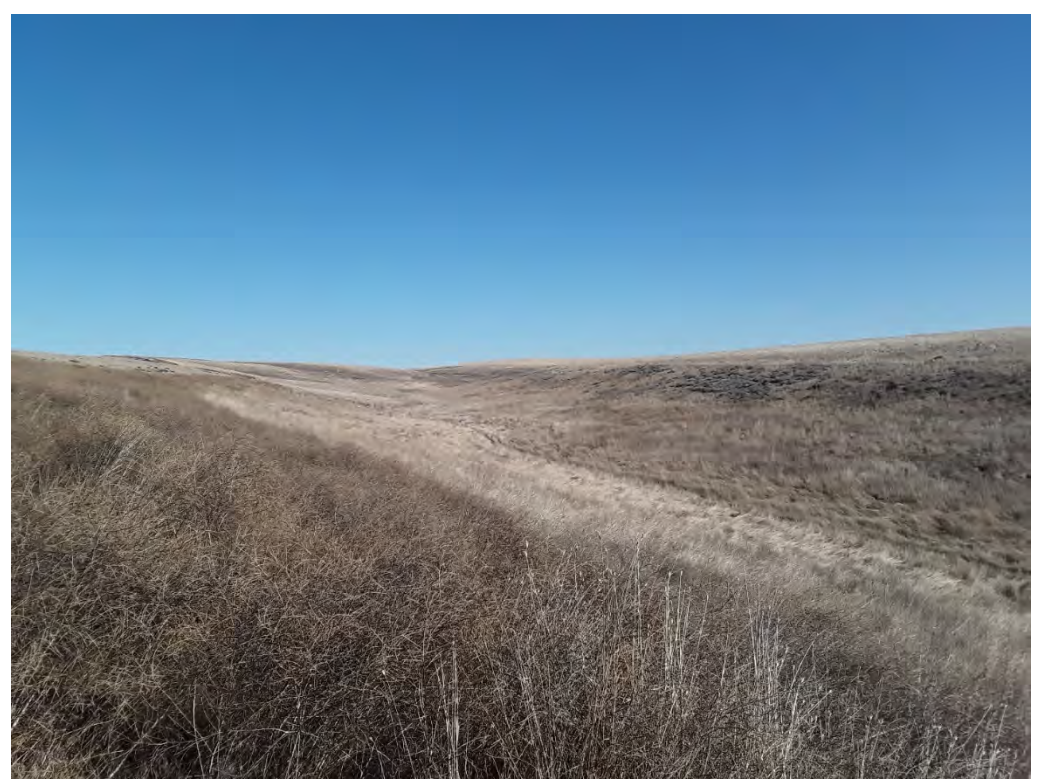
Photopoint 52. No beds, no banks, no stream present on NHD line.