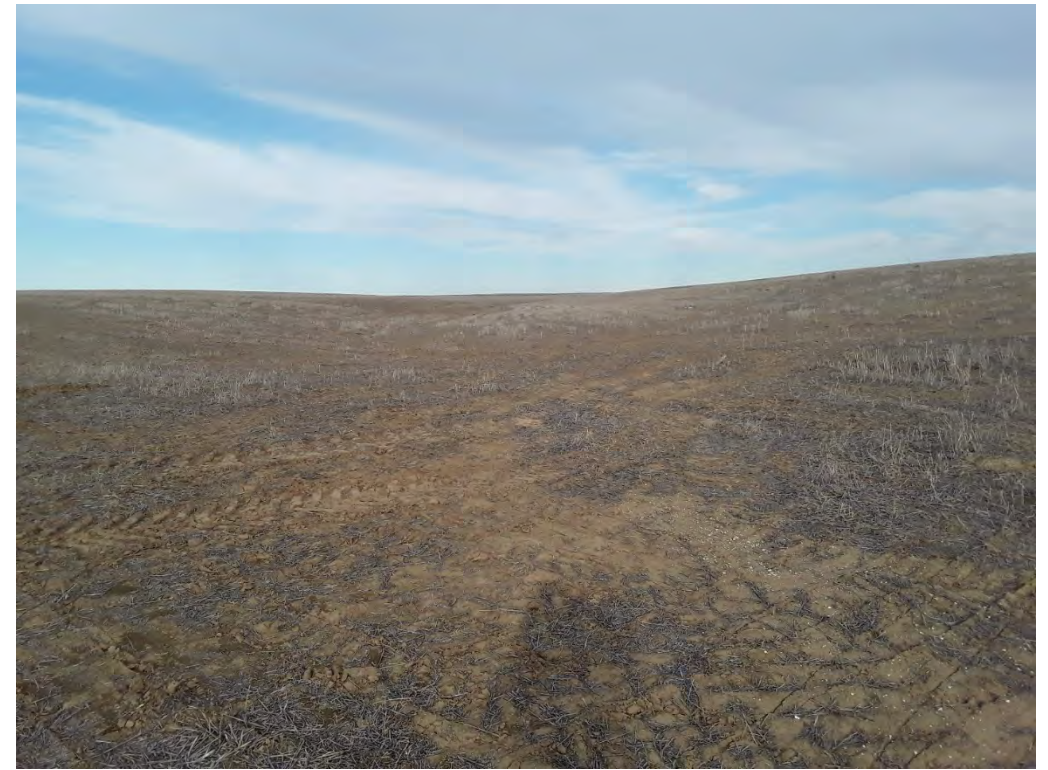
Photopoint 30. No beds, no banks, no stream present on NHD line.