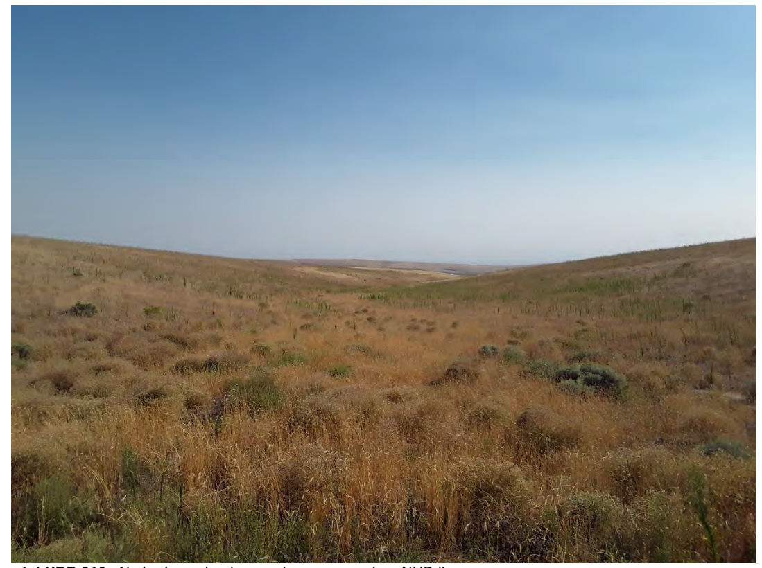
Photopoint XBB 310. No beds, no banks, no stream present on NHD line.