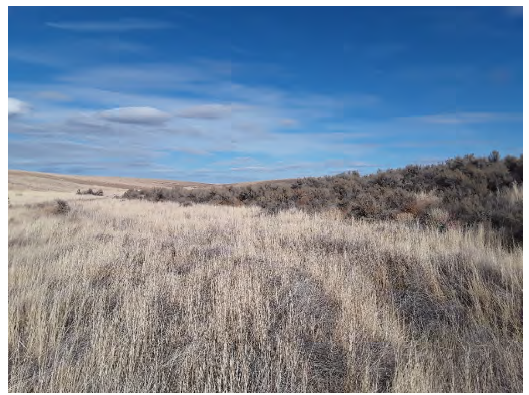
Photopoint 723. Ephemeral drainage, upland vegetation with no sign of water. EPH700.