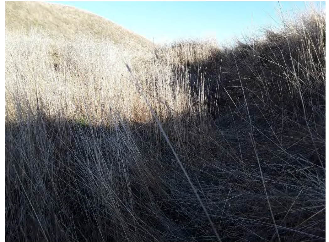
Photopoint 94. Ephemeral drainage, upland vegetation with no sign of water. EPH400.