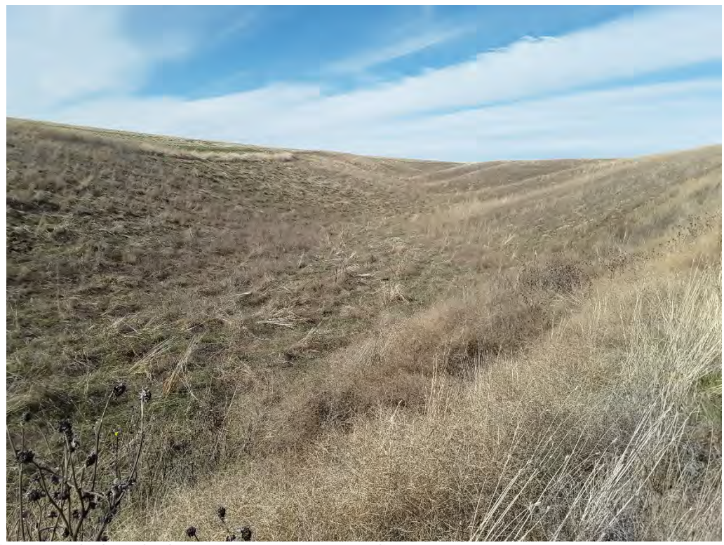
Photopoint 111. No beds, no banks, no stream present on NHD line.