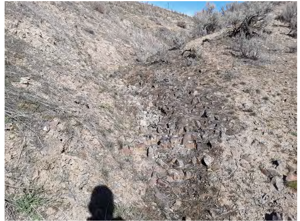
Photopoint 104. Ephemeral drainage, upland vegetation with no sign of water. EPH405.