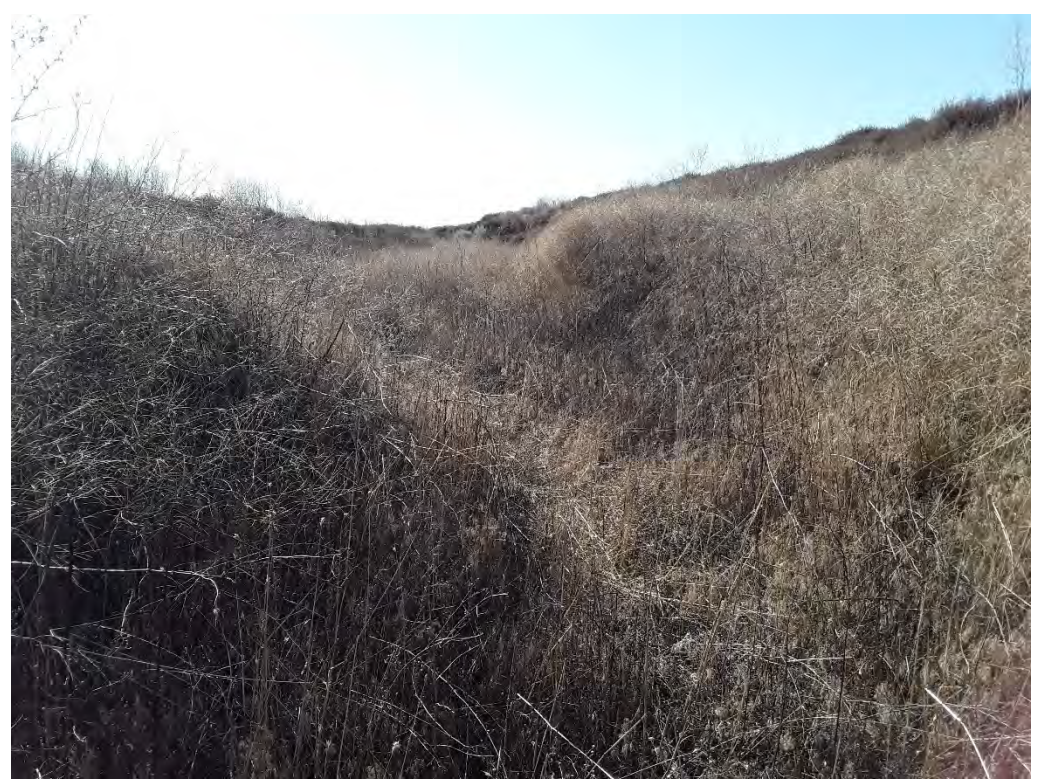
Photopoint 3. Ephemeral drainage, upland vegetation with no sign of water. EPH100.