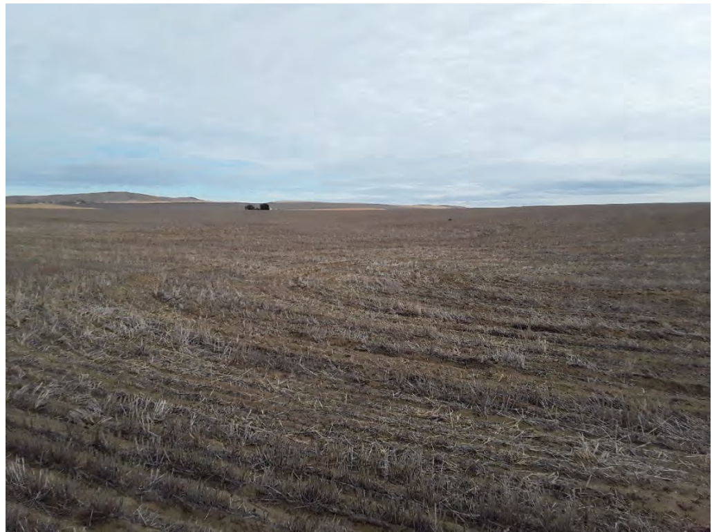
Photopoint 718. No beds, no banks, no stream present on NHD line.