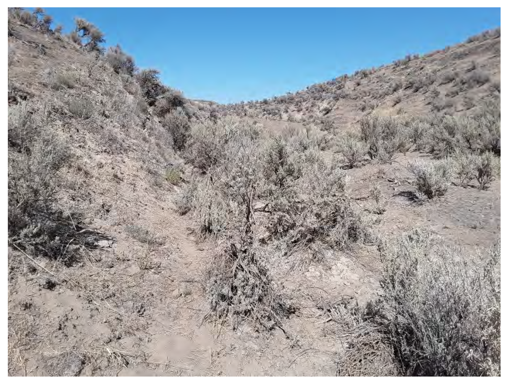
Photopoint EPH500 NE1. Ephemeral drainage, upland vegetation with no sign of water.