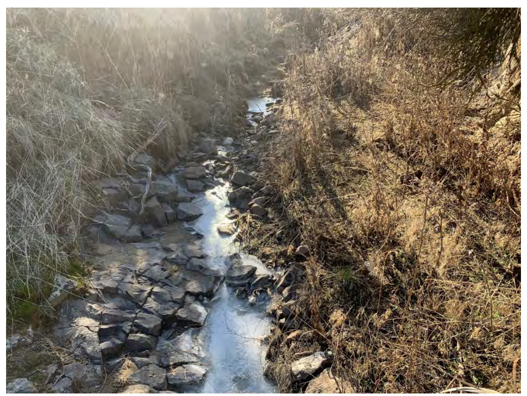
Photopoint 93. Streambed with watermarks on rocks, and water in pools due to recent rainfall. INT01.