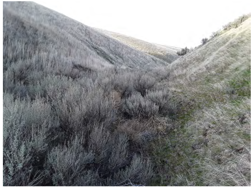
Photopoint 62. Streambed with damp soils. INT02.