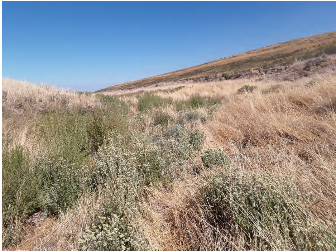
Photopoint XBB 303. No beds, no banks, no stream present on NHD line.