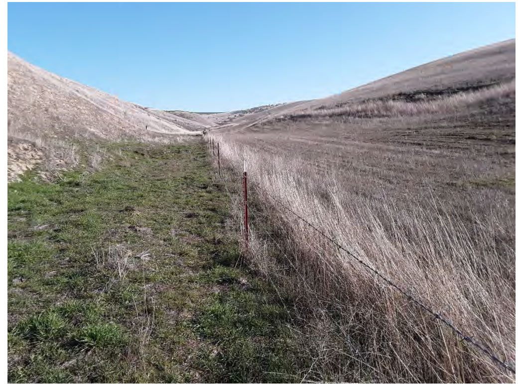
Photopoint 98. No beds, no banks, no stream present on NHD line.