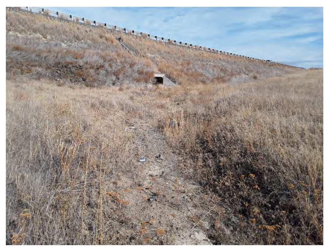
Photopoint 721. Ephemeral drainage, upland vegetation with no sign of water. EPH700, leading up to culvert under road.