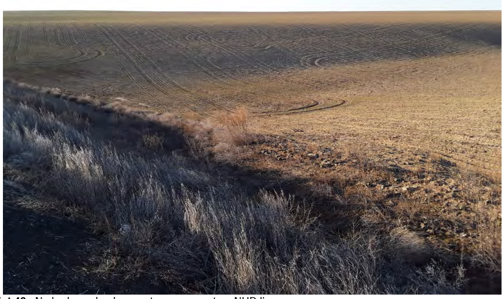
Photopoint 42. No beds, no banks, no stream present on NHD line.