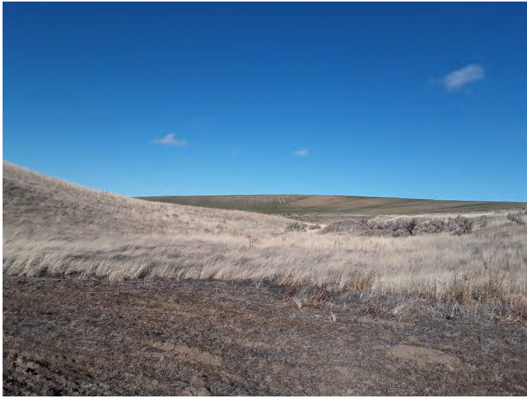
Photopoint 807. No beds, no banks, no stream present on NHD line.