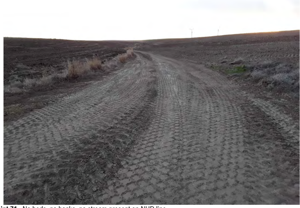
Photopoint 71. No beds, no banks, no stream present on NHD line.