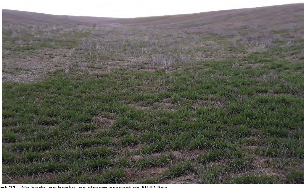
Photopoint 31. No beds, no banks, no stream present on NHD line.