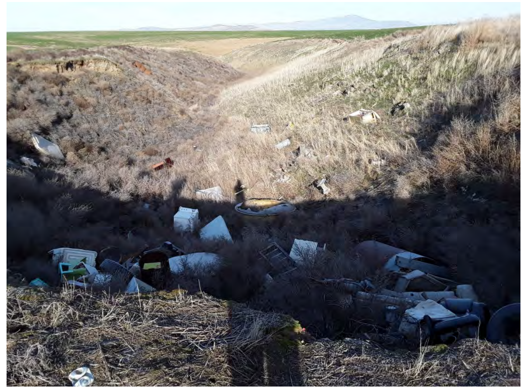
Photopoint 35. Garbage dump.