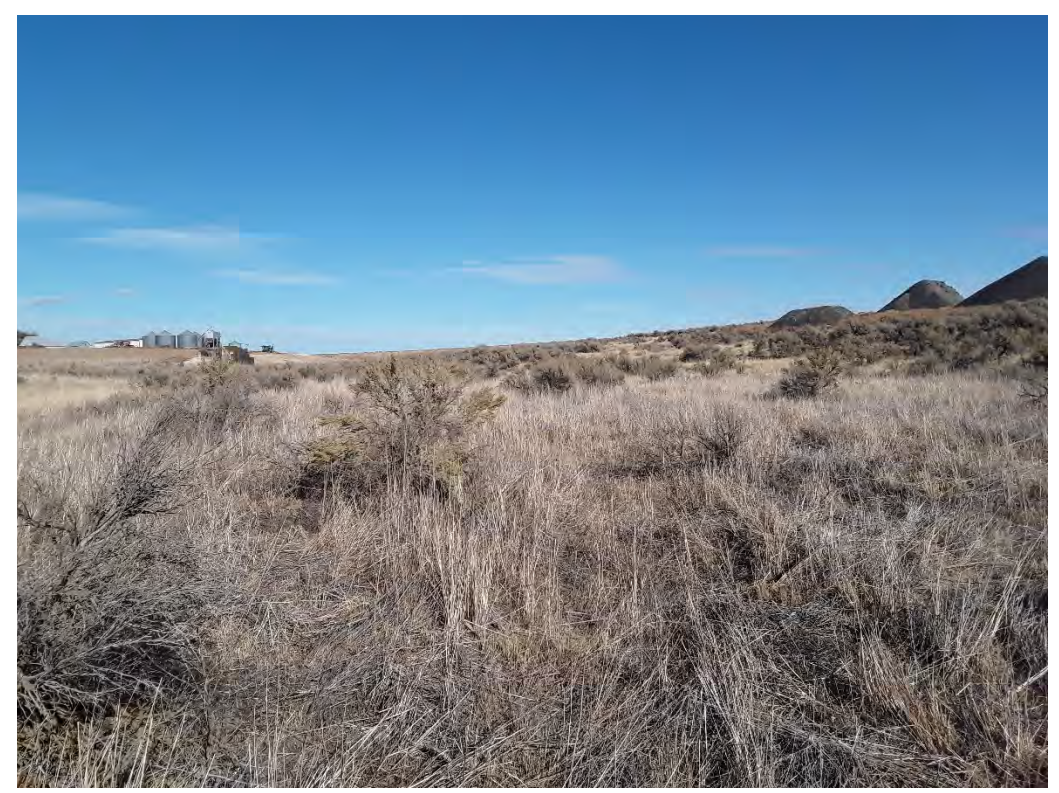
Photopoint 614. No beds, no banks, no stream present on NHD line.