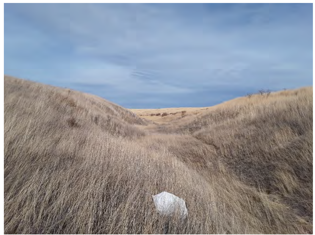
Photopoint 709. No beds, no banks, no stream present on NHD line.