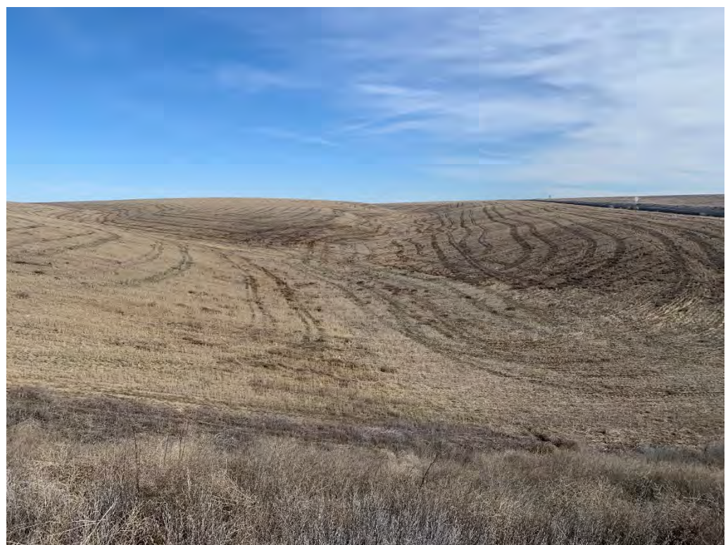
Photopoint 44. No beds, no banks, no stream present on NHD line.