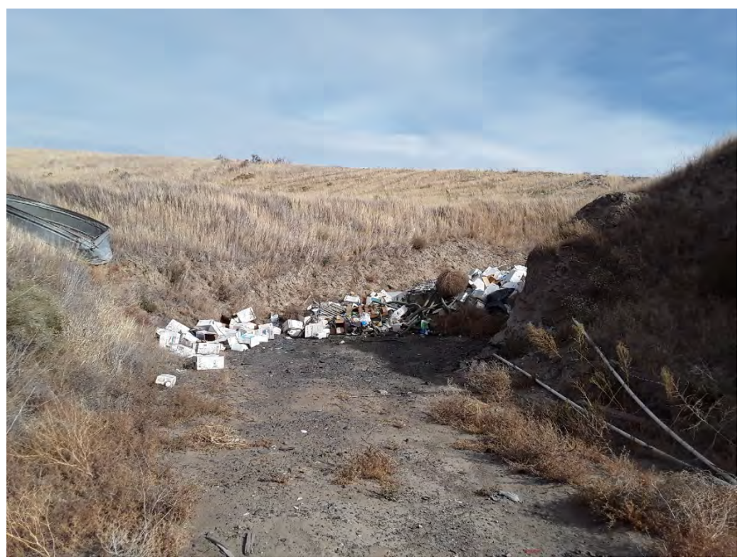
Photopoint 708. Ephemeral drainage, upland vegetation with no sign of water Ephemeral drainage, with trash pile. EPH306.