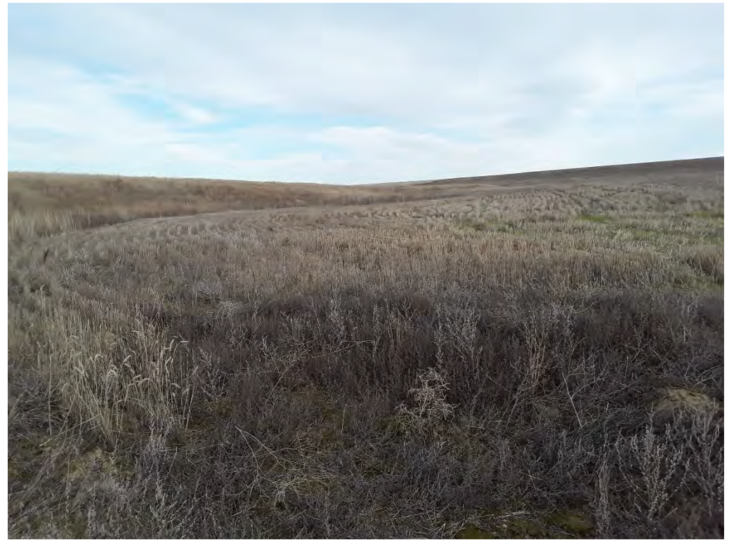
Photopoint 32. No beds, no banks, no stream present on NHD line.