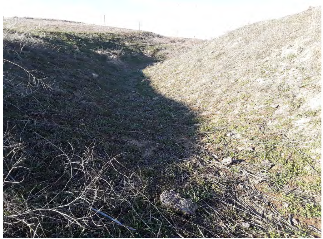
Photopoint 85. Ephemeral drainage, upland vegetation with no sign of water. EPH307.