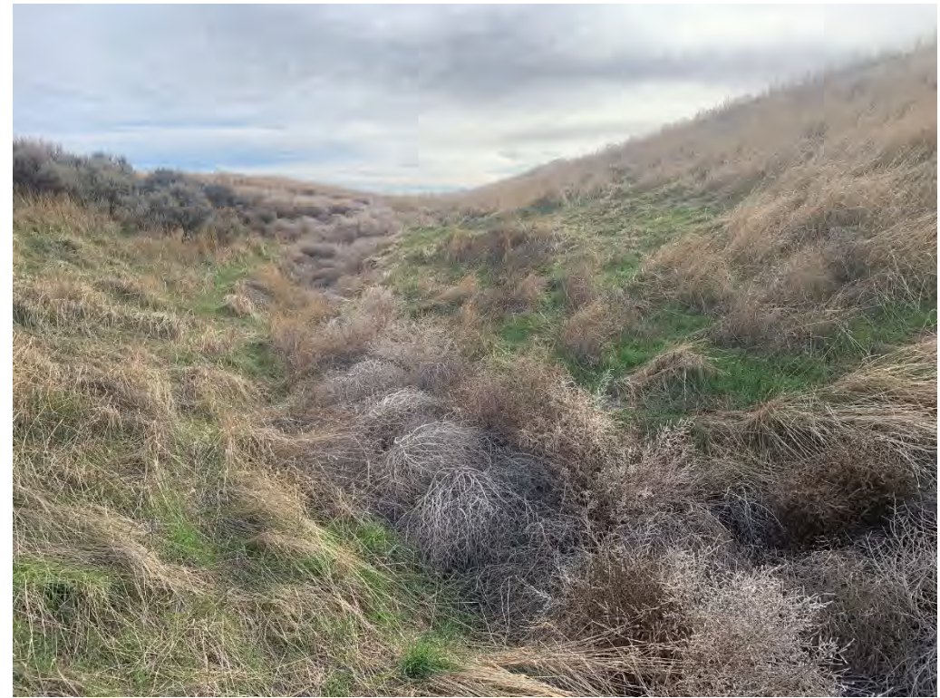
Photopoint 65. Ephemeral drainage, upland vegetation with no sign of water. EPH412.