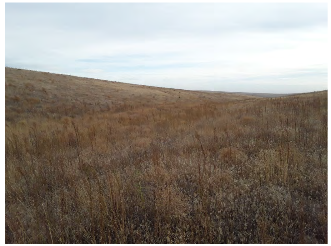
Photopoint 712. No beds, no banks, no stream present on NHD line.