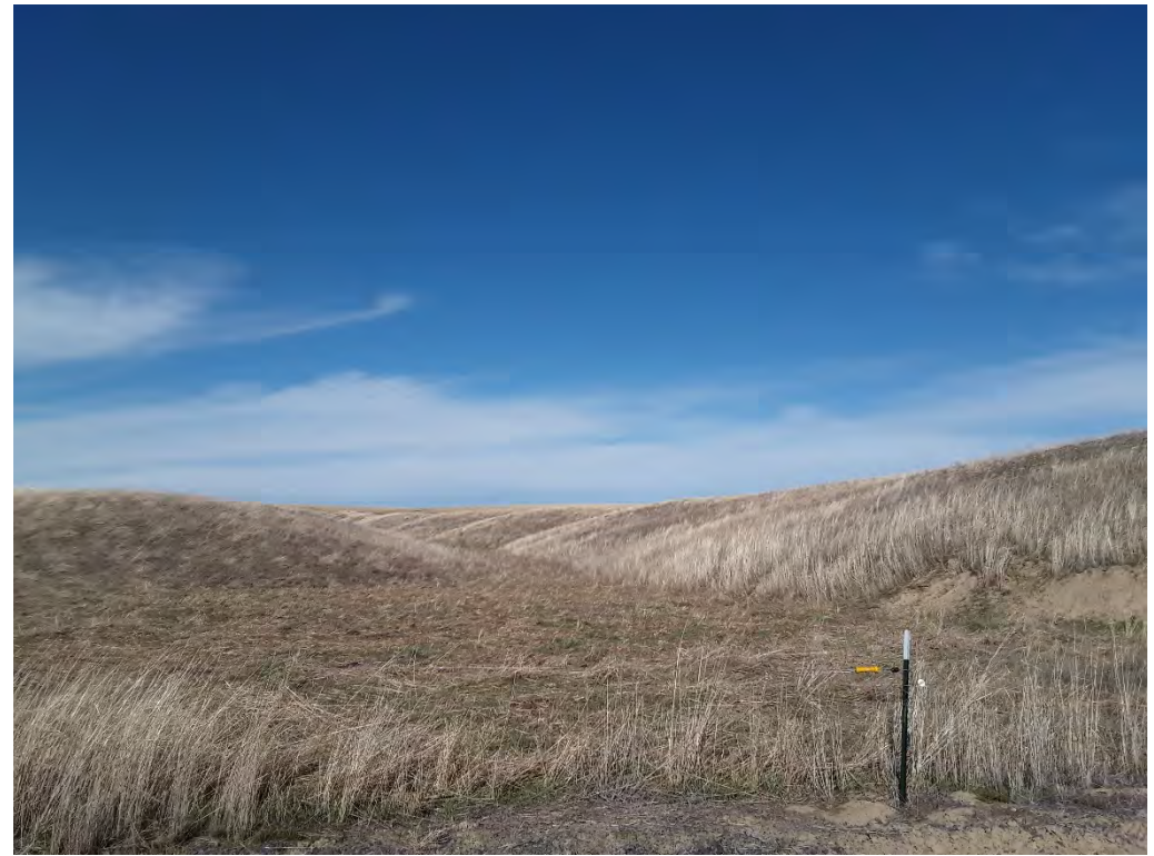
Photopoint 110. No beds, no banks, no stream present on NHD line.