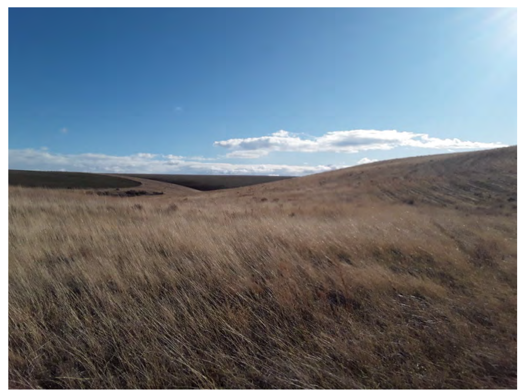
Photopoint 806. No beds, no banks, no stream present on NHD line.