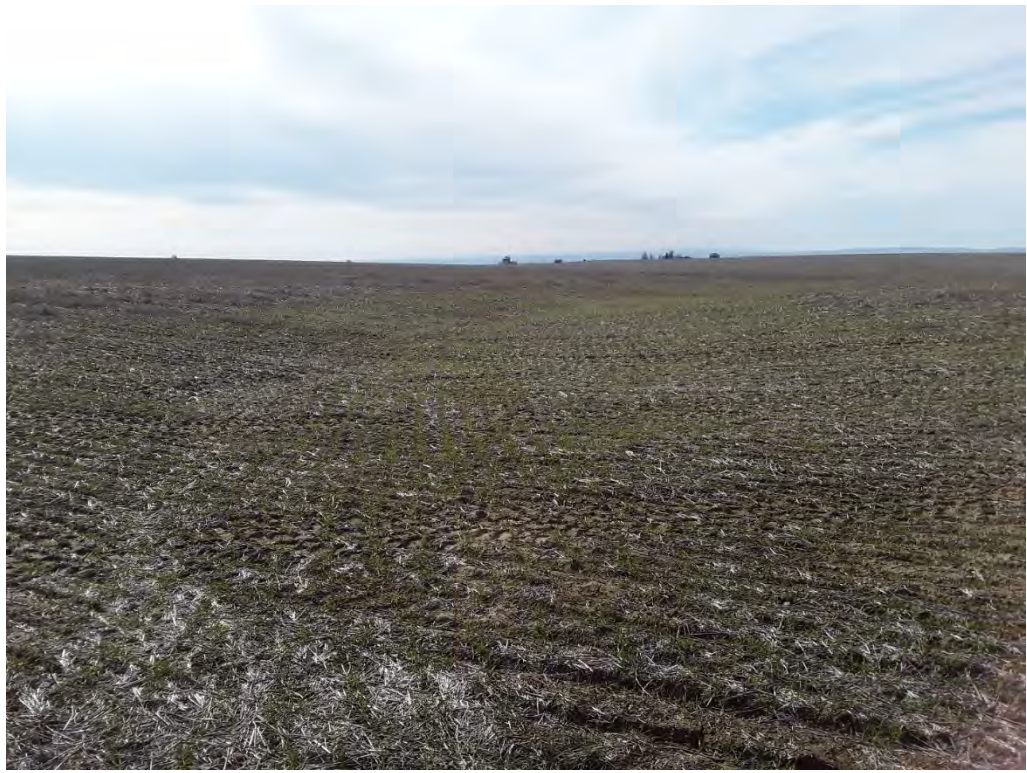
Photopoint 29. No beds, no banks, no stream present on NHD line.