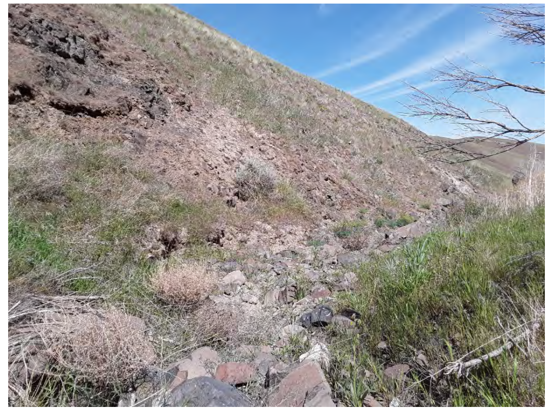
Photopoint 904. Ephemeral drainage, typical conditions. EPH-904. Facing northwest.