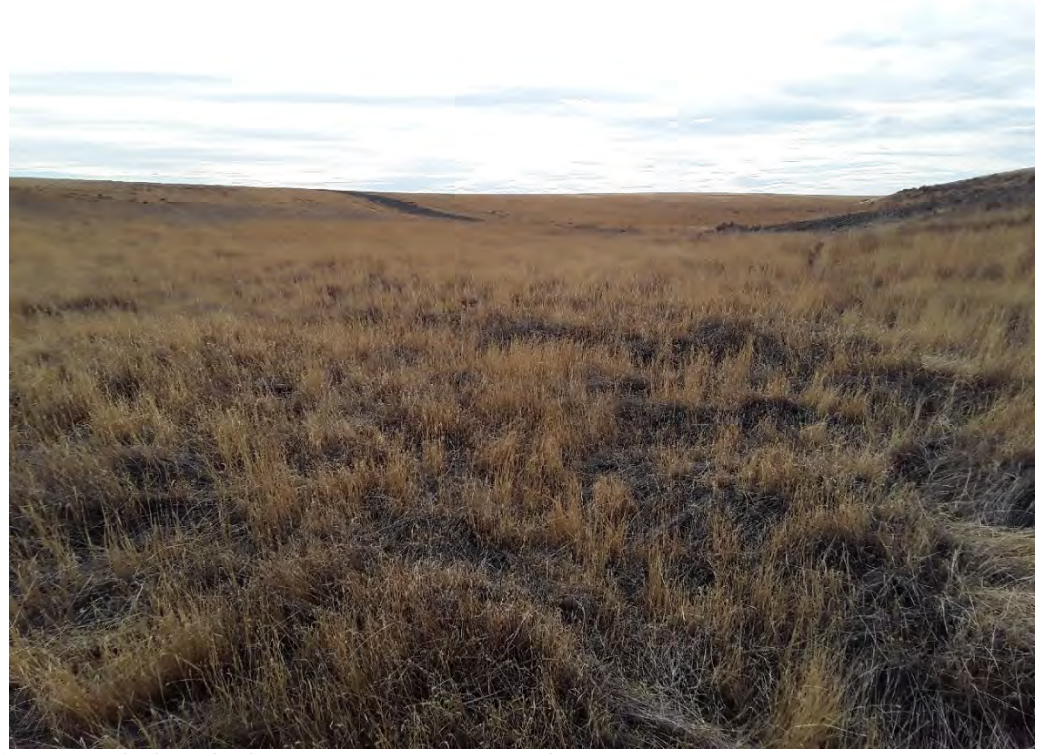
Photopoint 722. No beds, no banks, no stream present on NHD line.