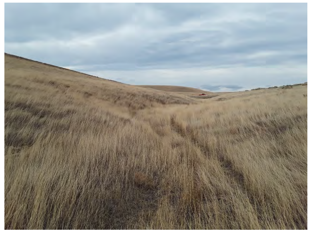
Photopoint 607. Ephemeral drainage, upland vegetation with no sign of water. Narrow ephemeral drainage, EPH600.