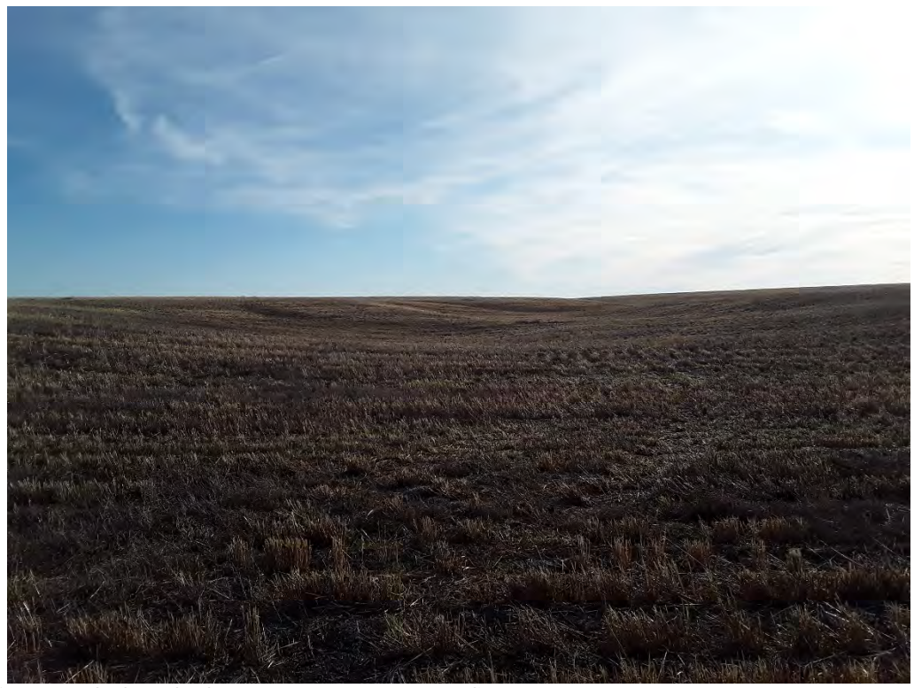
Photopoint 39. No beds, no banks, no stream present on NHD line.