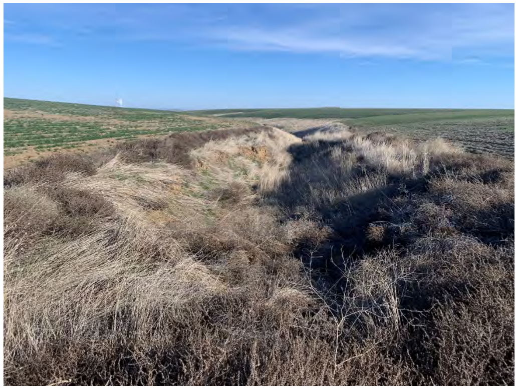
Photopoint 36. Ephemeral drainage, upland vegetation with no sign of water. EPH200.