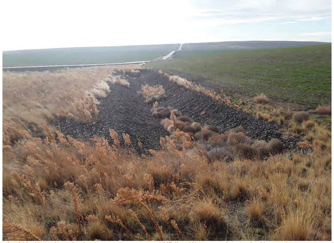
Photopoint 800. No beds, no banks, no stream present on NHD line. Water retention pond, with no culvert.