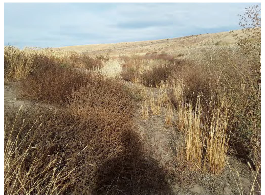
Photopoint 603. Ephemeral drainage, upland vegetation with no sign of water Ephemeral drainage, less than one foot wide. EPH306.