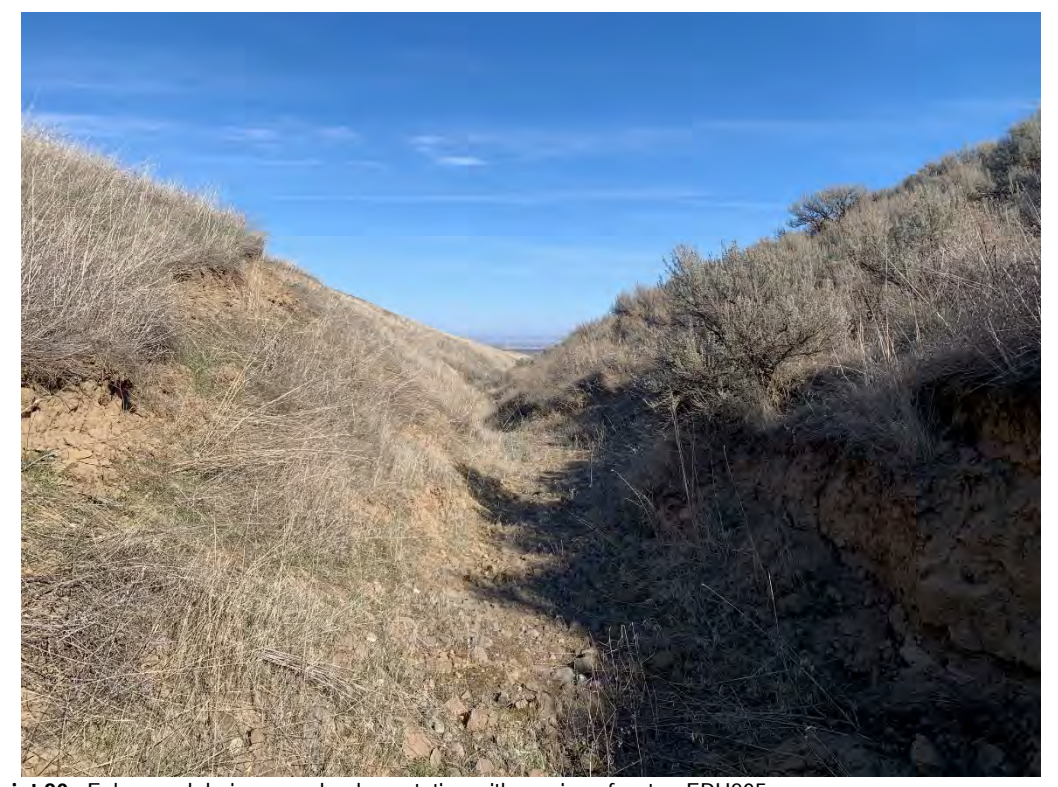
Photopoint 20. Ephemeral drainage, upland vegetation with no sign of water. EPH205.