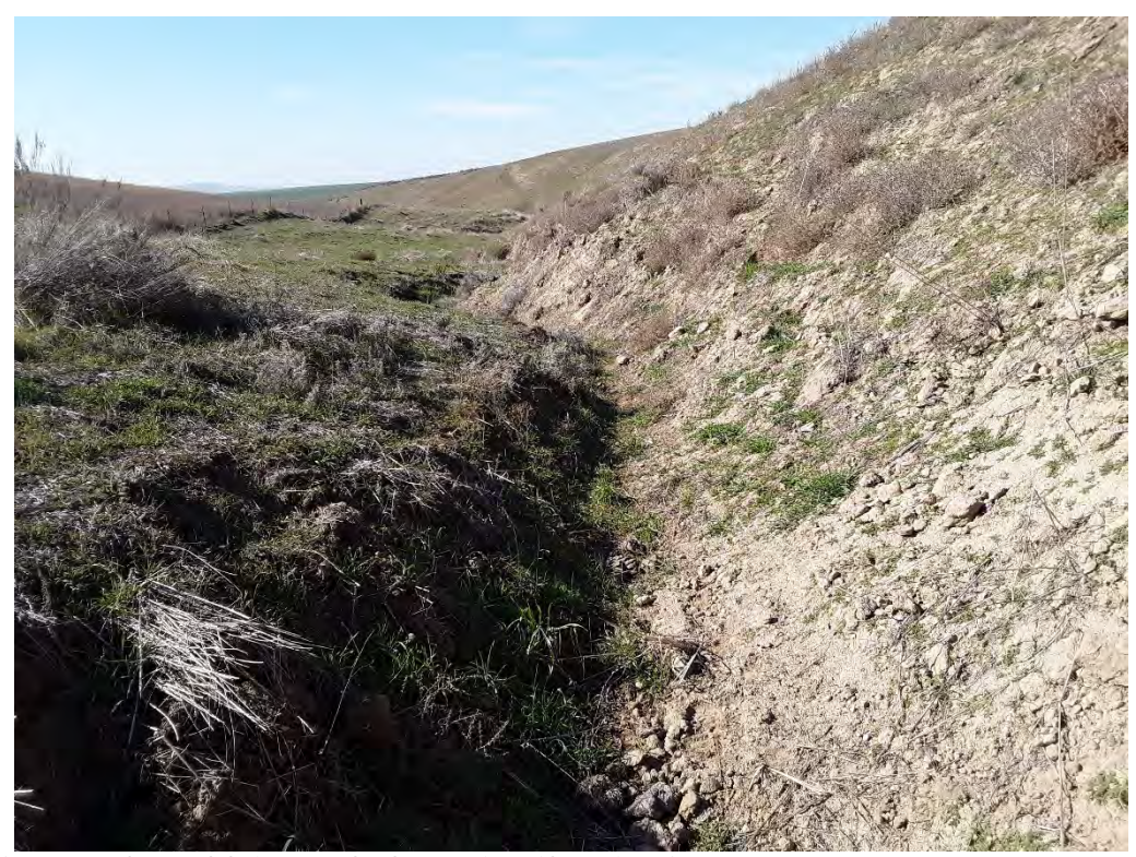
Photopoint 103. Ephemeral drainage, upland vegetation with no sign of water. EPH404.