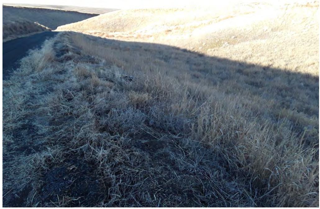
Photopoint 808. No beds, no banks, no stream present on NHD line.