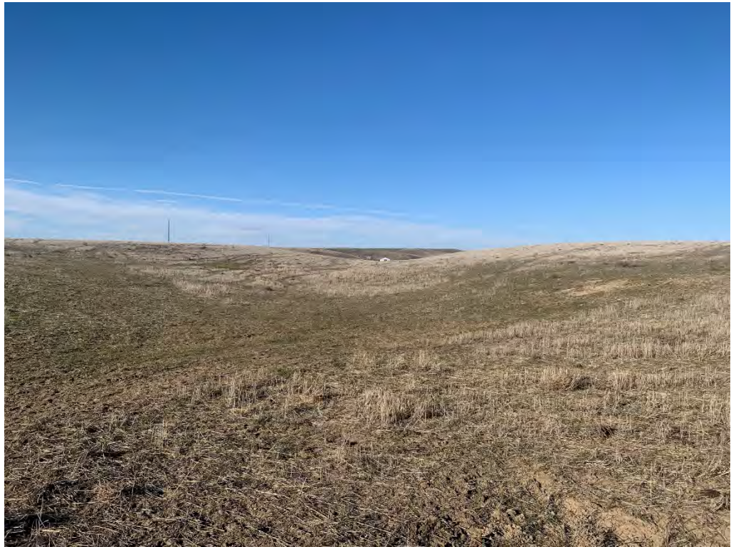
Photopoint 82. No beds, no banks, no stream present on NHD line.