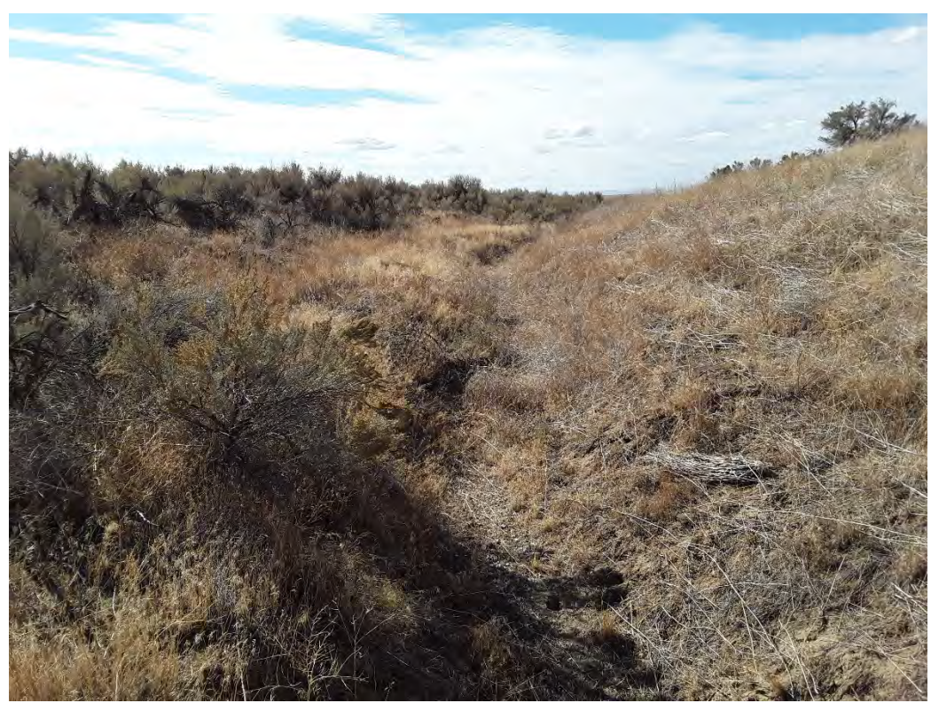
Photopoint 612. Ephemeral drainage, upland vegetation with no sign of water. EPH602.