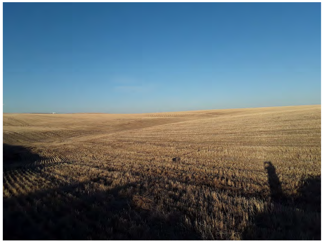
Photopoint 115. No beds, no banks, no stream present on NHD line.