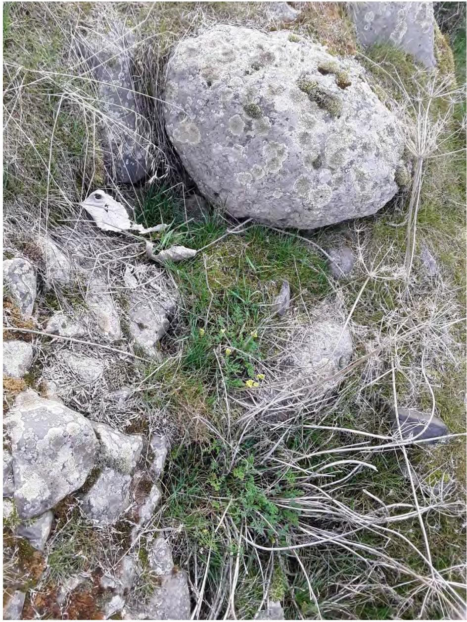
Photopoint 61. Streambed with damp soils. INT02.