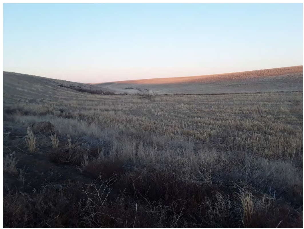
Photopoint 814. No beds, no banks, no stream present on NHD line.