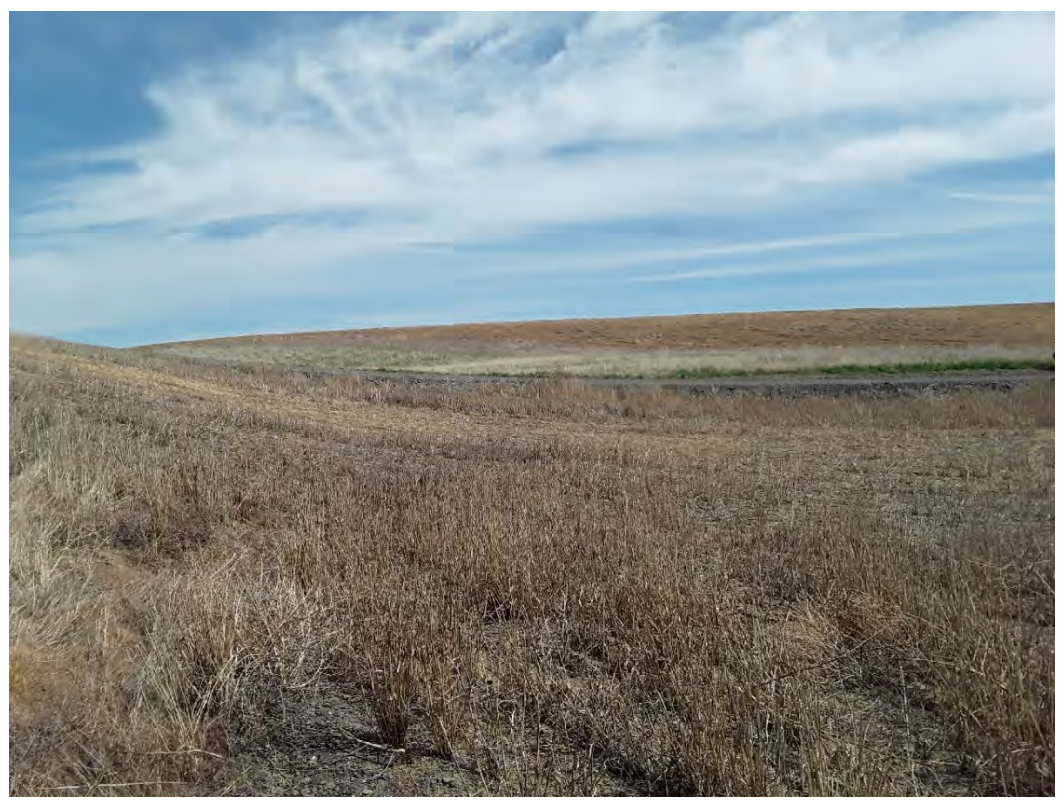
Photopoint 900. No beds, no banks, no stream present on NHD line.