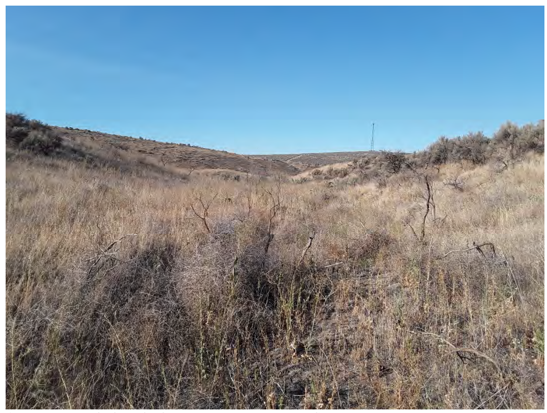
Photopoint XBB 310. No beds, no banks, no stream present on NHD line.