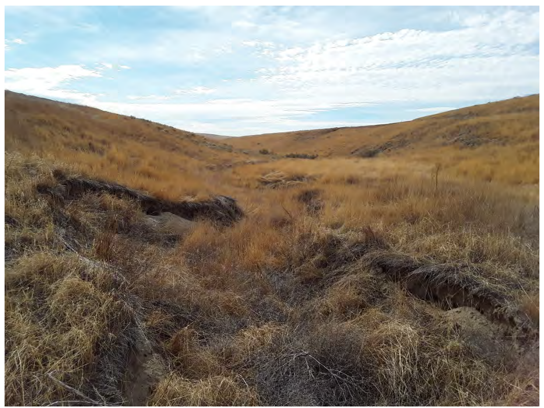
Photopoint 601. Ephemeral drainage, upland vegetation with no sign of water Ephemeral drainage, EPH401.