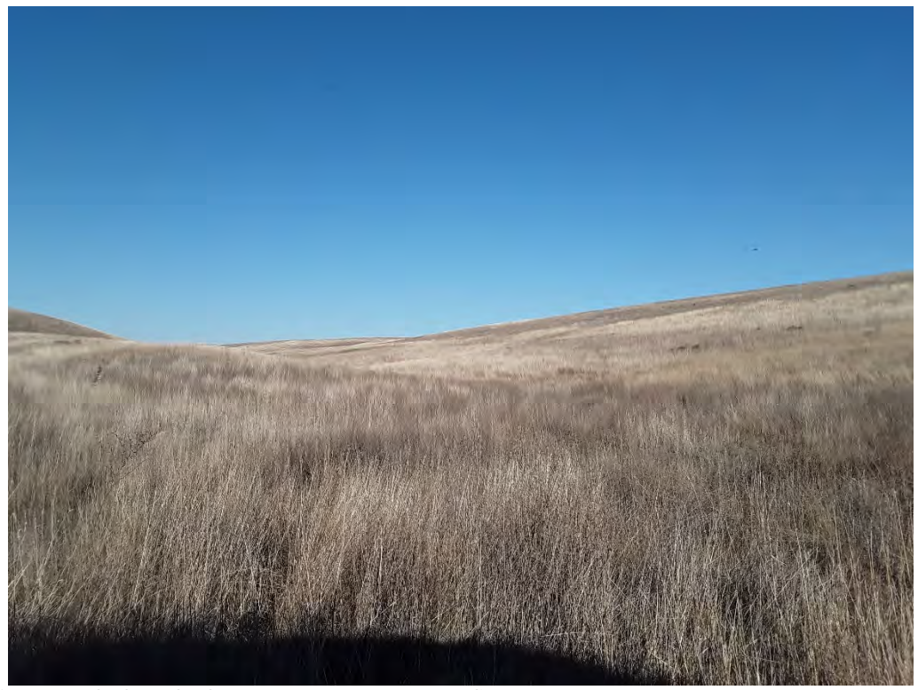
Photopoint 77. No beds, no banks, no stream present on NHD line.