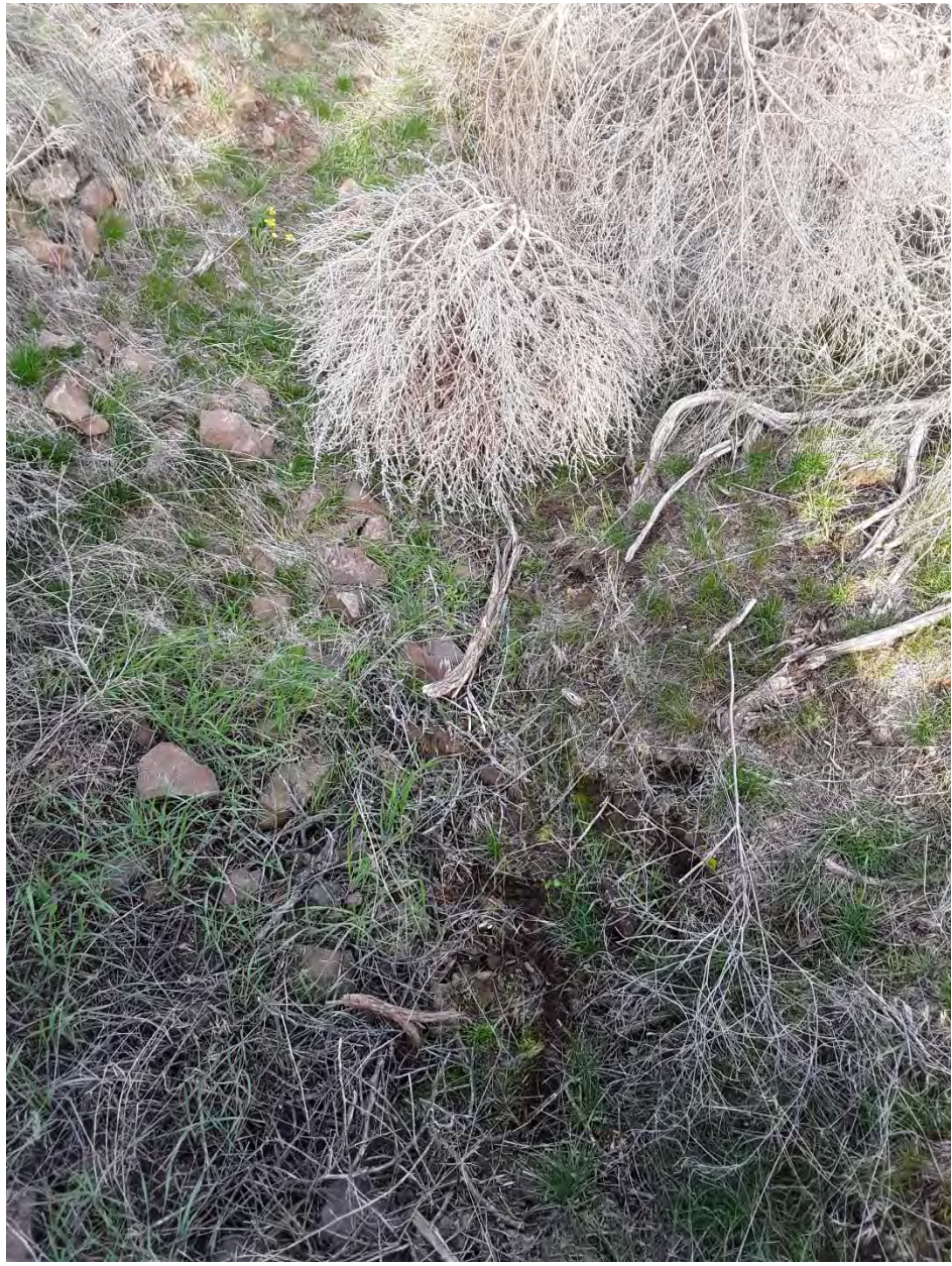
Photopoint 60. Streambed with damp soils. INT02.