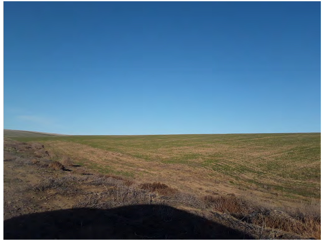
Photopoint 86. No beds, no banks, no stream present on NHD line.