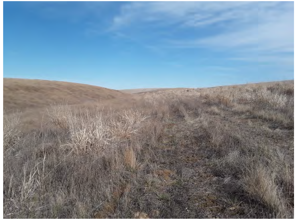
Photopoint 43. No beds, no banks, no stream present on NHD line.