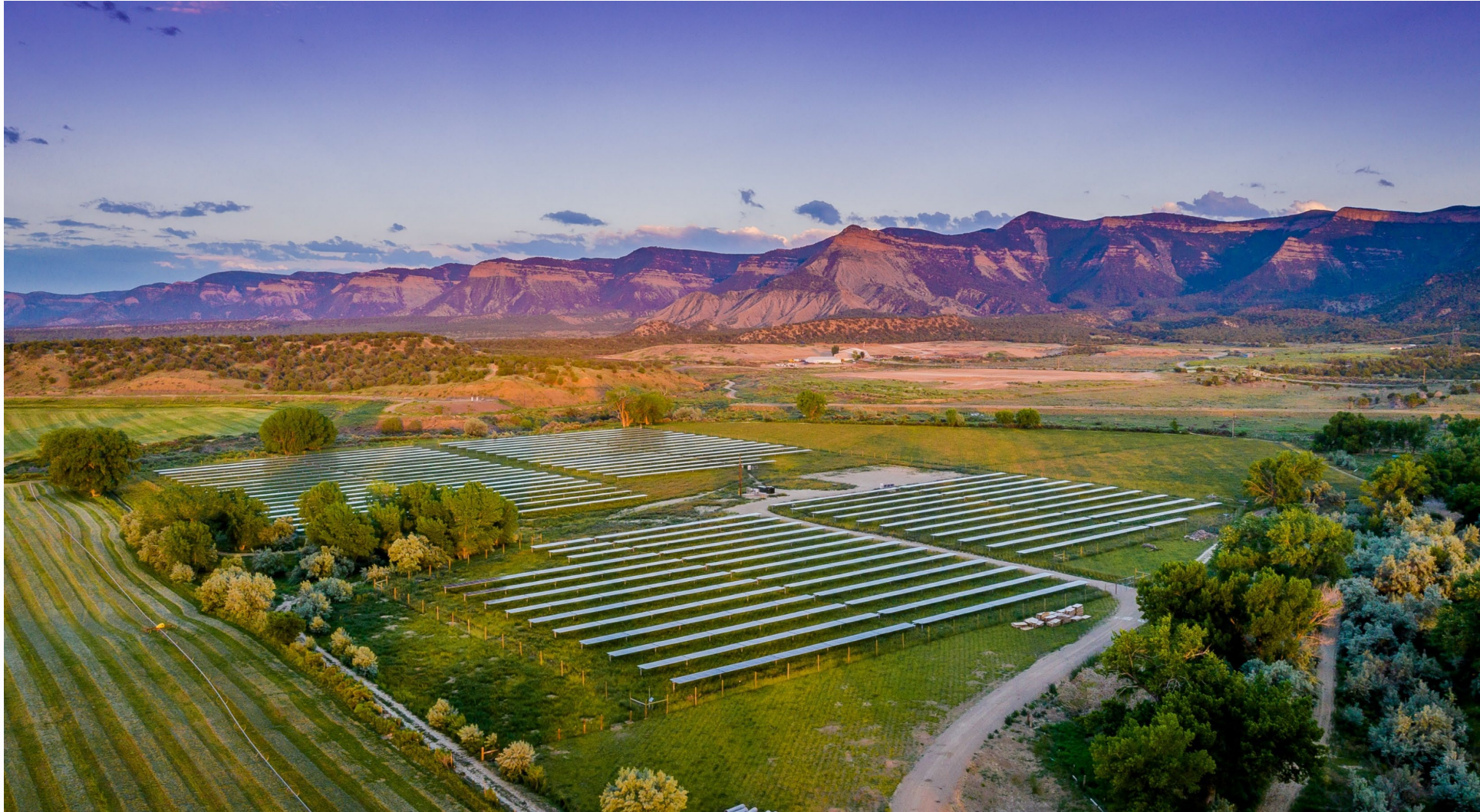
Rocky Ford Solar, Cortez, CO