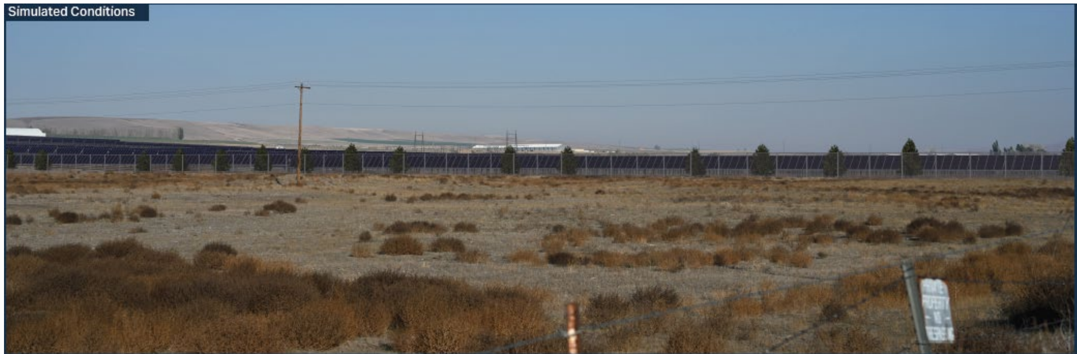
Rendering of Wallula Gap Solar looking northeast from State Route 14