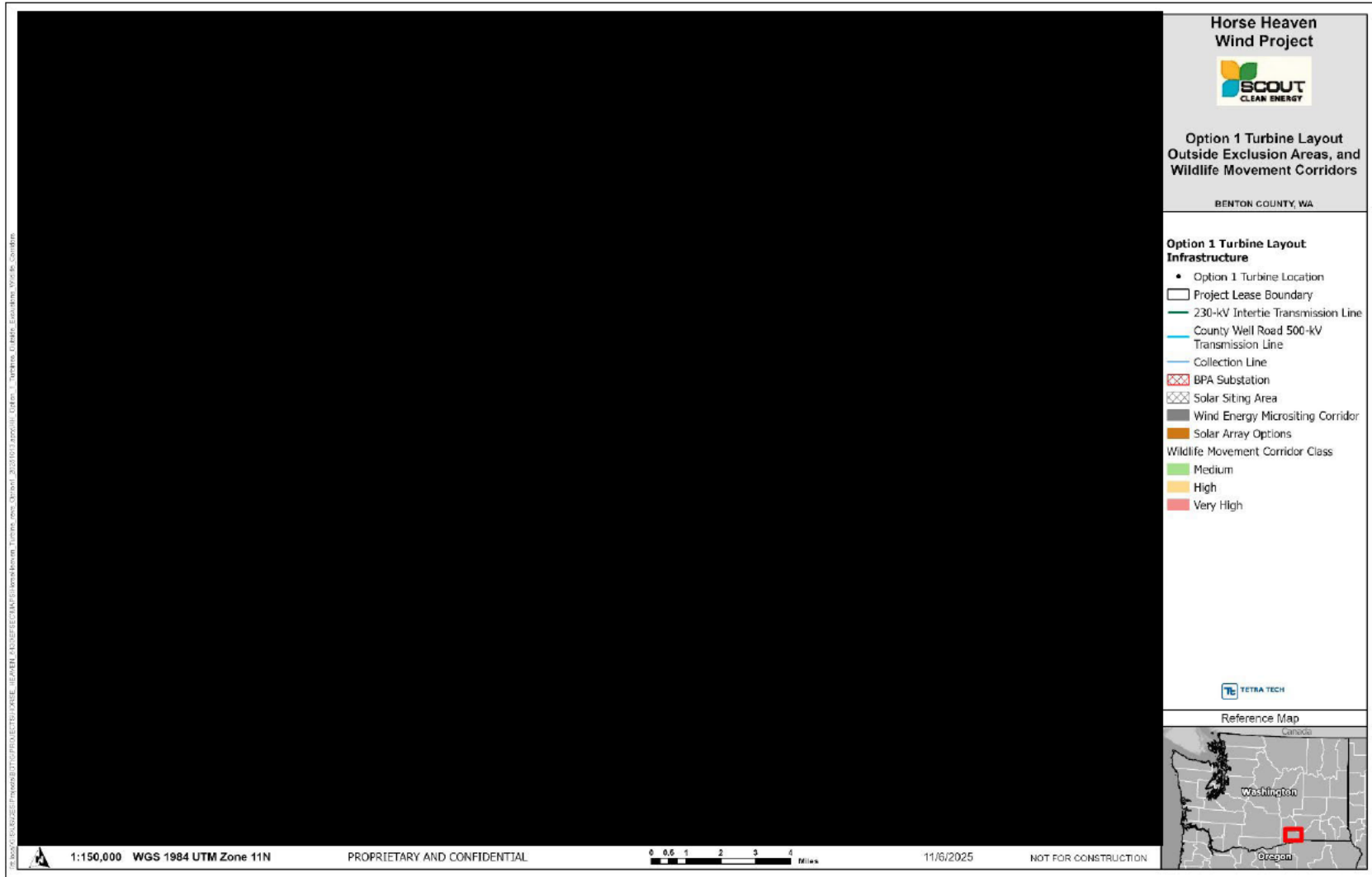
Figure 1. Wildlife Movement Corridors within the Horse Heaven Clean Energy Center